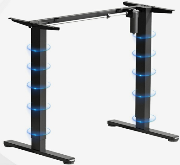
Image 4.1: Illustration of the desk's sturdy steel frame construction.