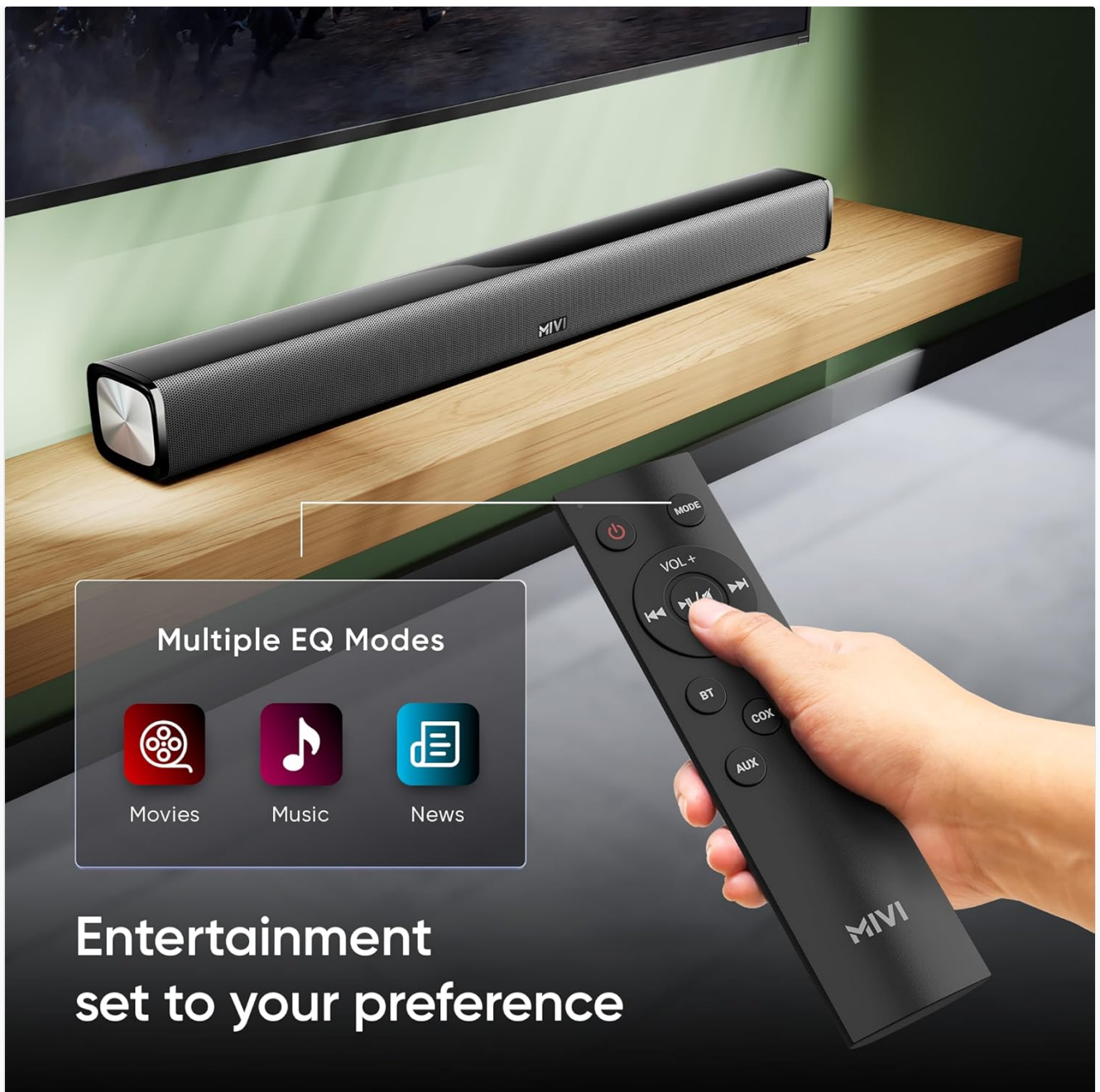
Image: The Mivi Fort Q60 Soundbar remote control, displaying buttons for power, volume, input selection (BT, COX, USB, AUX), and EQ modes.