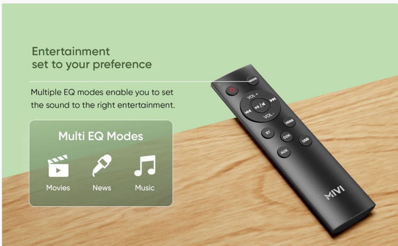
Image: The Mivi Fort Q60 Soundbar remote control highlighting the EQ mode buttons (Movies, Music, News) and illustrating the various input options.