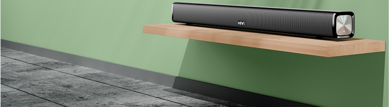
Image: A visual summary of the Mivi Fort Q60 Soundbar's key features, including 60 Watts power, 2.2 Channel sound, Bluetooth v5.0, multiple input modes, and EQ modes.