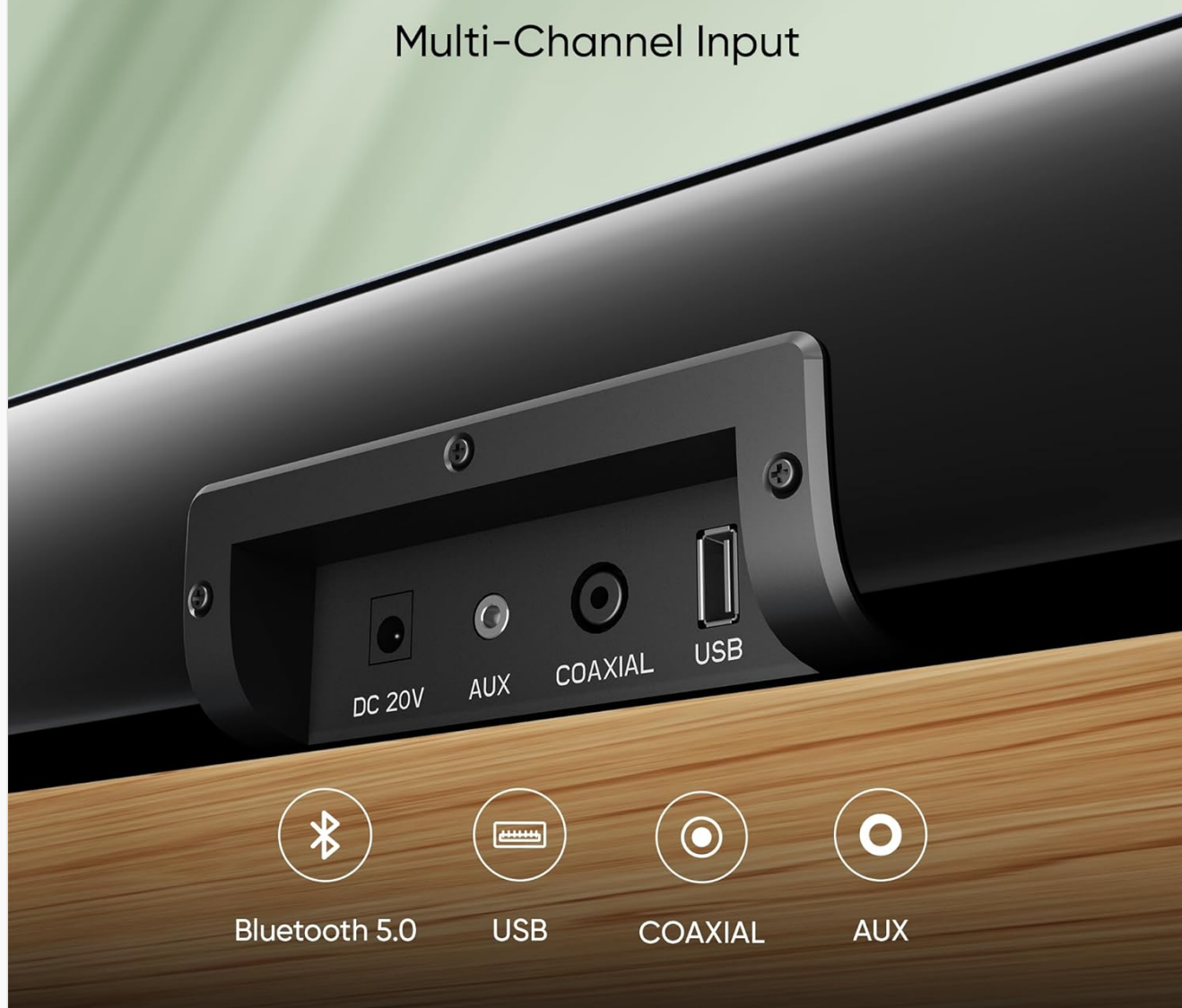
Image: Detailed view of the Mivi Fort Q60 Soundbar's rear panel, showing the DC 20V, AUX, Coaxial, and USB input ports.