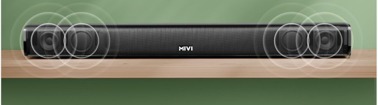
Image: The Mivi Fort Q60 Soundbar positioned beneath a television, demonstrating typical placement for home entertainment.

Home Filling Sound with dedicated subwoofers for powerful Bass