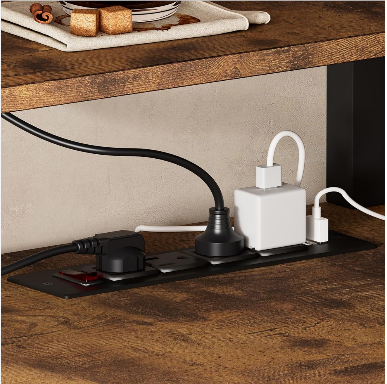
Figure 5.2: Detail of the integrated power outlets and USB ports for convenient device charging.