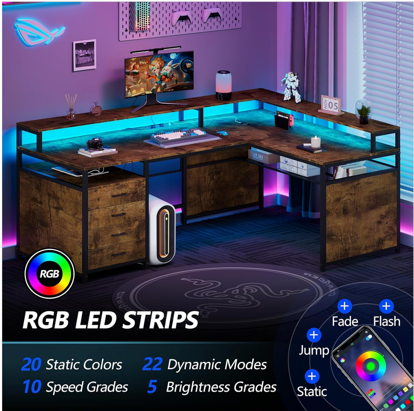
Figure 5.1: The L Shaped Desk with its integrated LED lights creating an ambient glow.