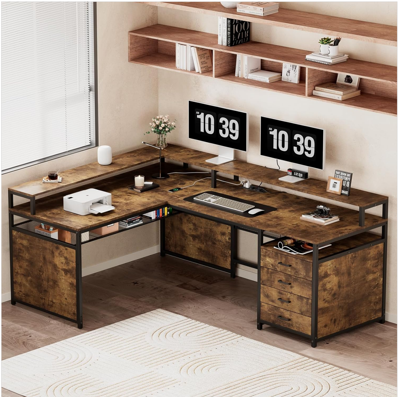
Figure 1.1: Overview of the YOMILUVE L Shaped Desk in an office environment, showcasing its design and functionality.