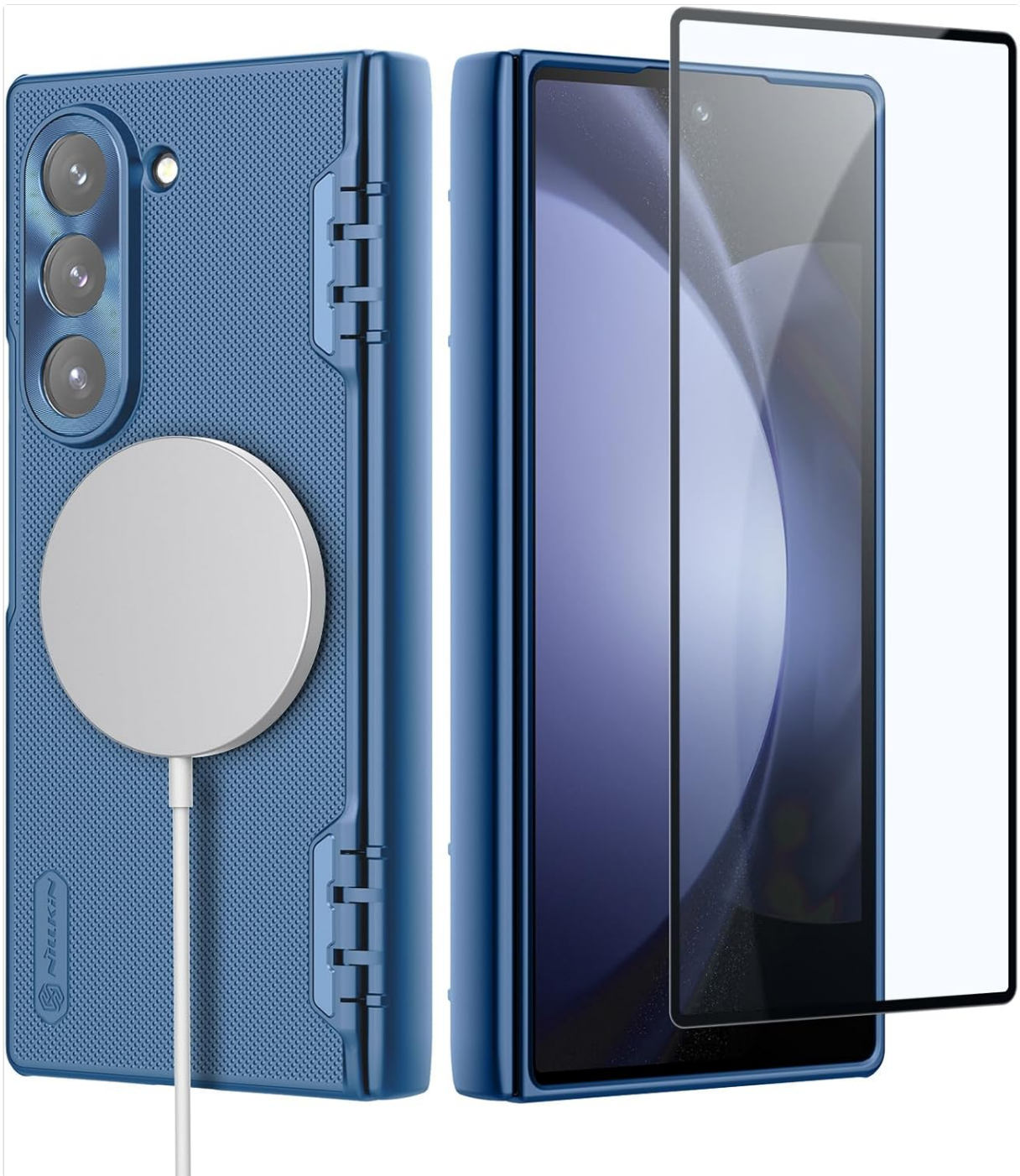
Image: Nillkin Magnetic Case Components. This image shows the back case with its magnetic ring and the front frame with the integrated screen protector.