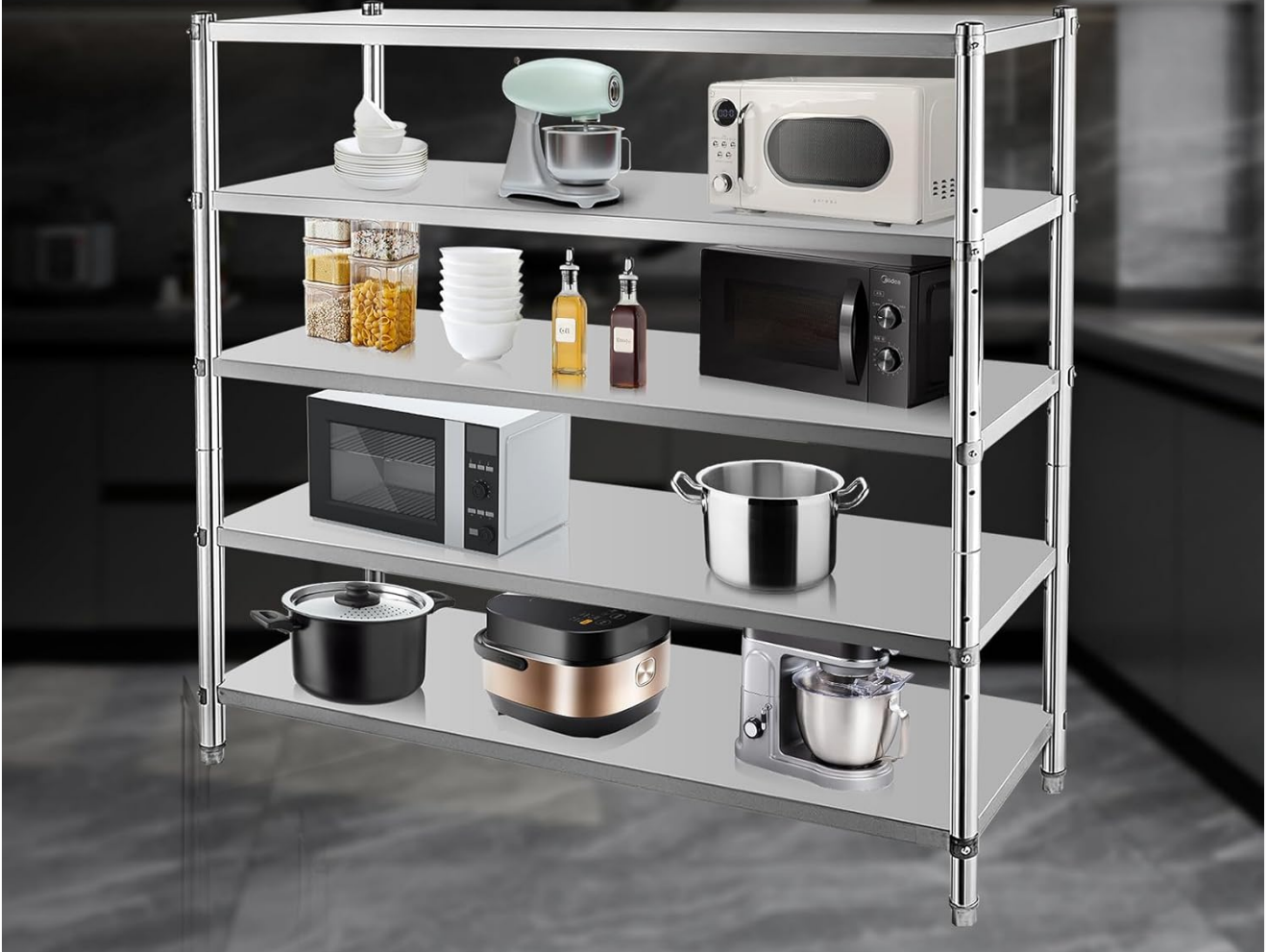
Image: Illustration of the 330lb weight capacity per shelf.