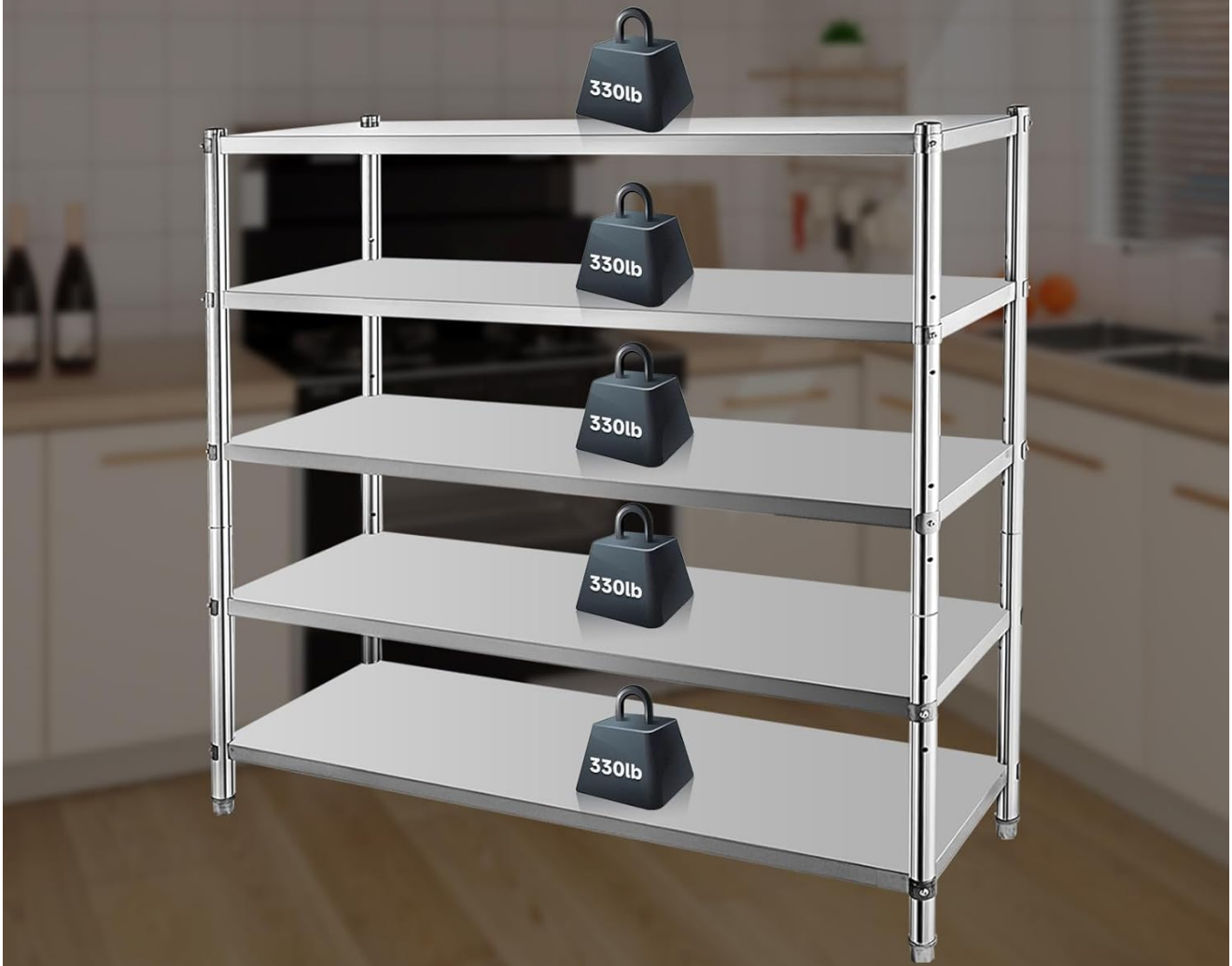
Image: Key features of the durable stainless steel construction.