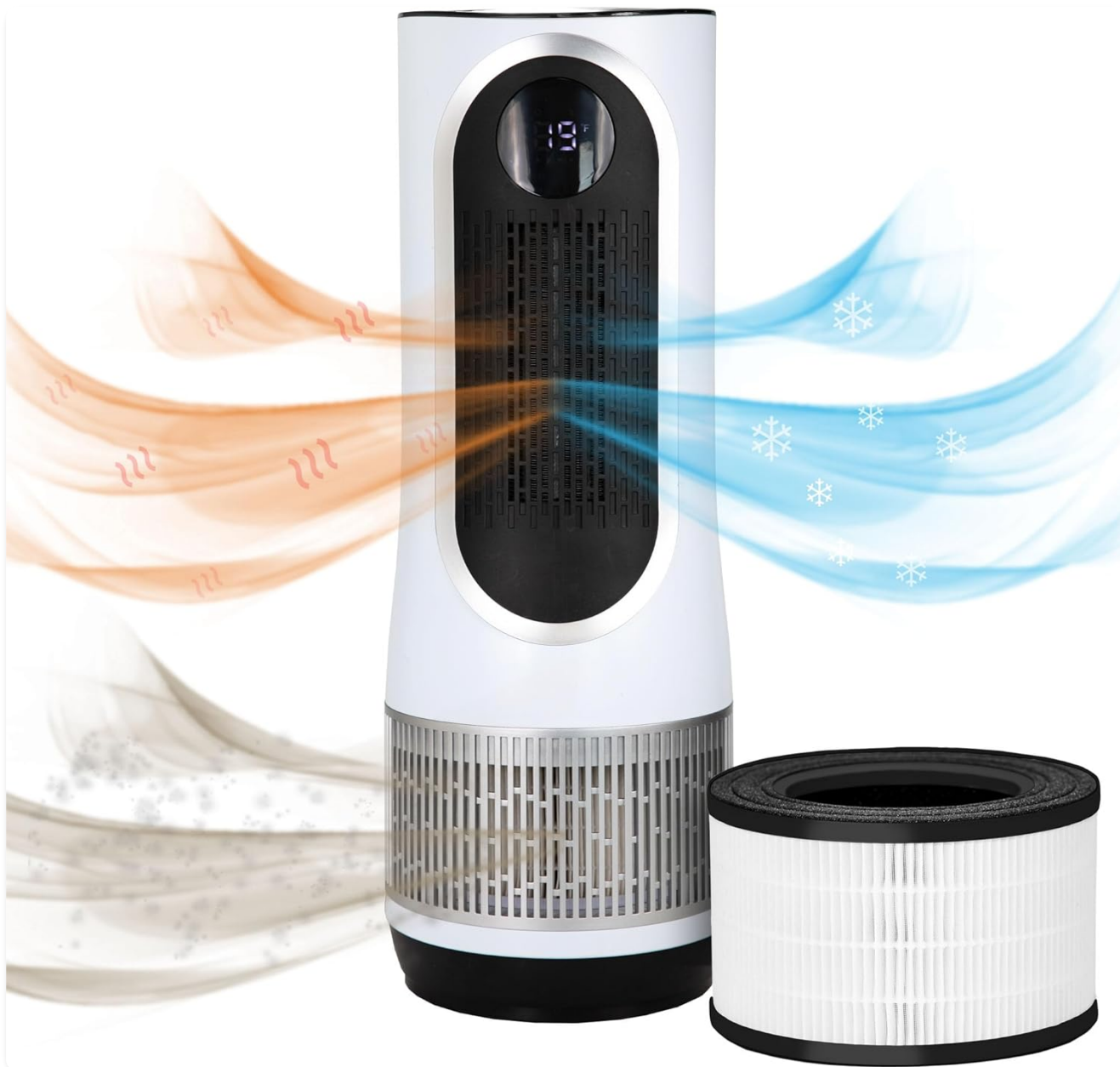
Image: The Silvergear 3-in-1 Air Purifier, illustrating its dual function of providing both warm and cool air, alongside a detached HEPA filter.