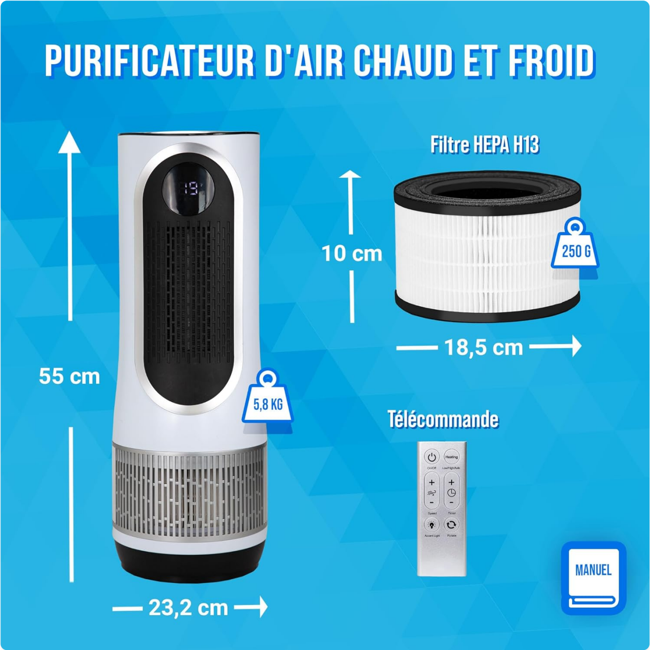
Image: Visual representation of the air purifier's dimensions (55 cm height, 23.2 cm base diameter, 5.8 KG weight) and the HEPA H13 filter's dimensions (18.5 cm width, 10 cm height, 250 G weight), along with the remote control.