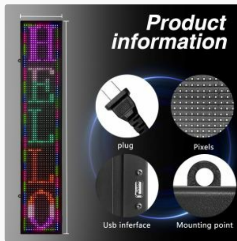
Image: Close-up view of product features including the power plug, USB interface, pixel detail, and mounting point.