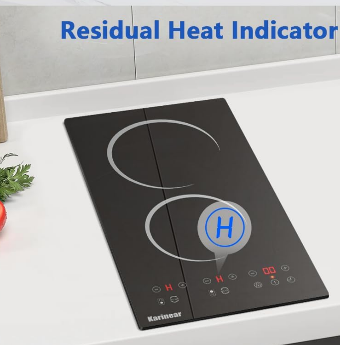
Residual Heat Indicator

Image: A composite image showing the cooktop's display indicating the Child Safety Lock ('Lo'), the 99-minute Timer function, and the Residual Heat Indicator ('H').