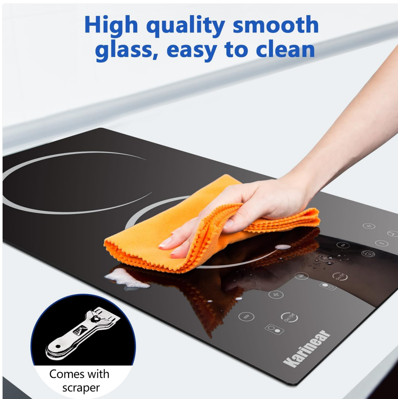
Image: A hand wiping the smooth black glass surface of the cooktop with a cleaning cloth, demonstrating its ease of cleaning. A scraper tool is also shown in the corner.