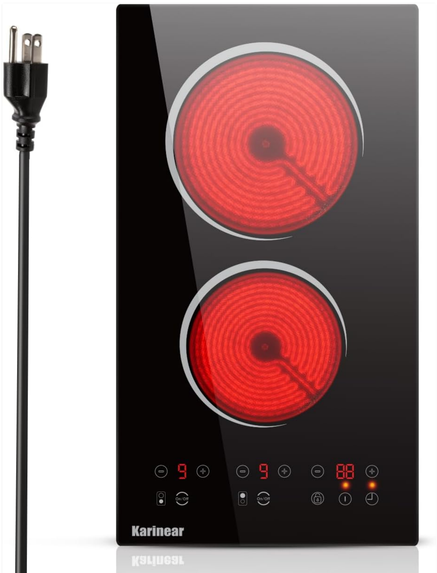
Image: The Karinear 110V Electric Cooktop, showing its sleek black glass surface, two heating elements, and attached power cord with a standard 110V plug.