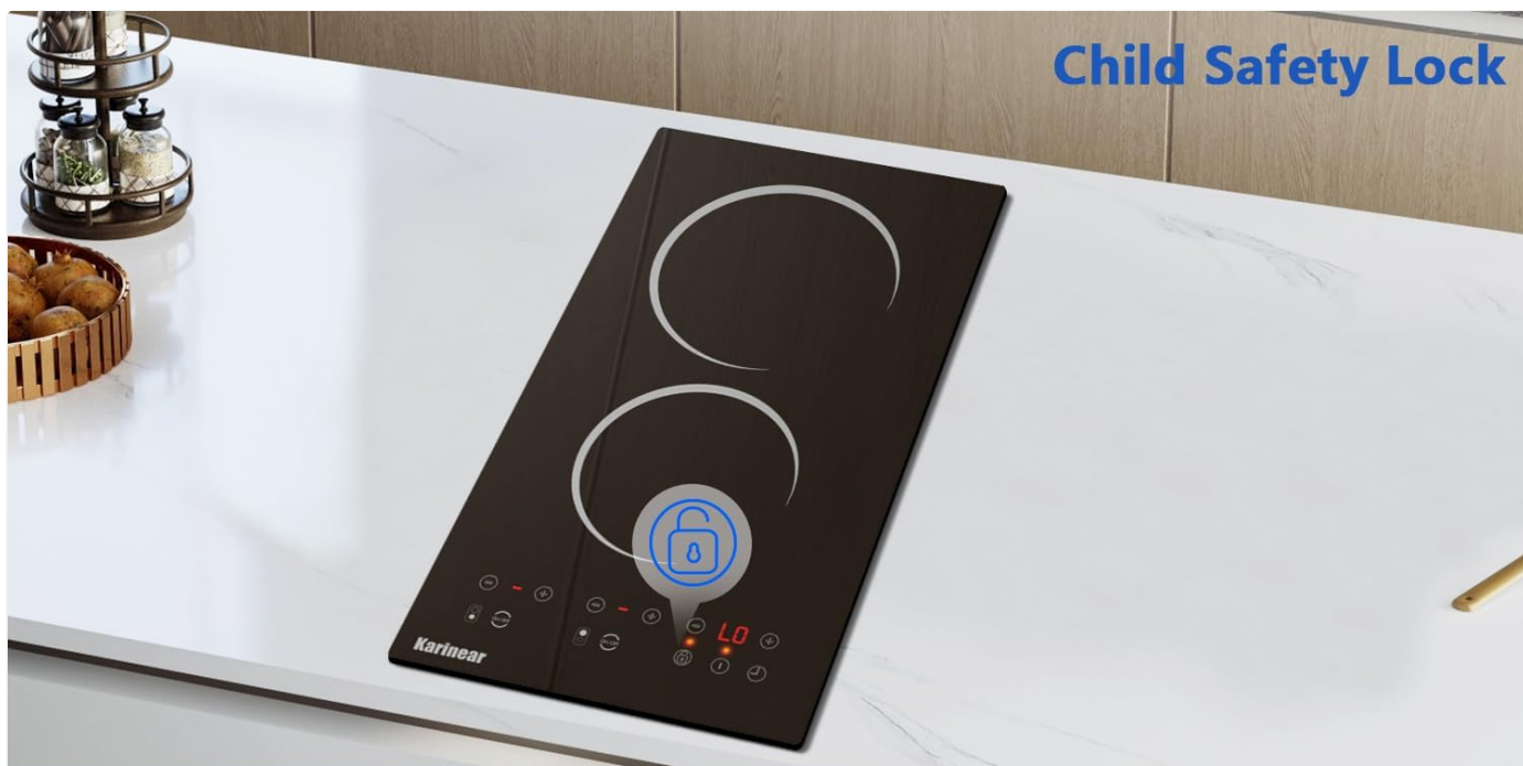
Child Safety Lock