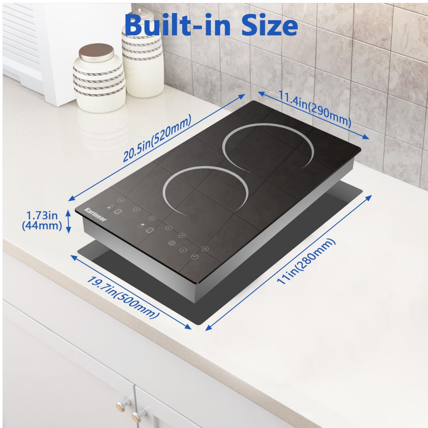
Image: A detailed diagram illustrating the precise dimensions for built-in installation, including stovetop size and cutout size in both inches and millimeters.

No special wiring is required as the unit comes with a standard 110V plug. Simply plug it into a compatible outlet after installation.