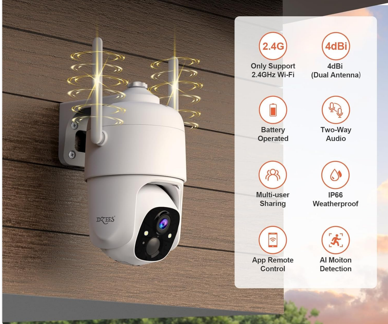
Image: Always Stay Online with Strong WiFi Signal.