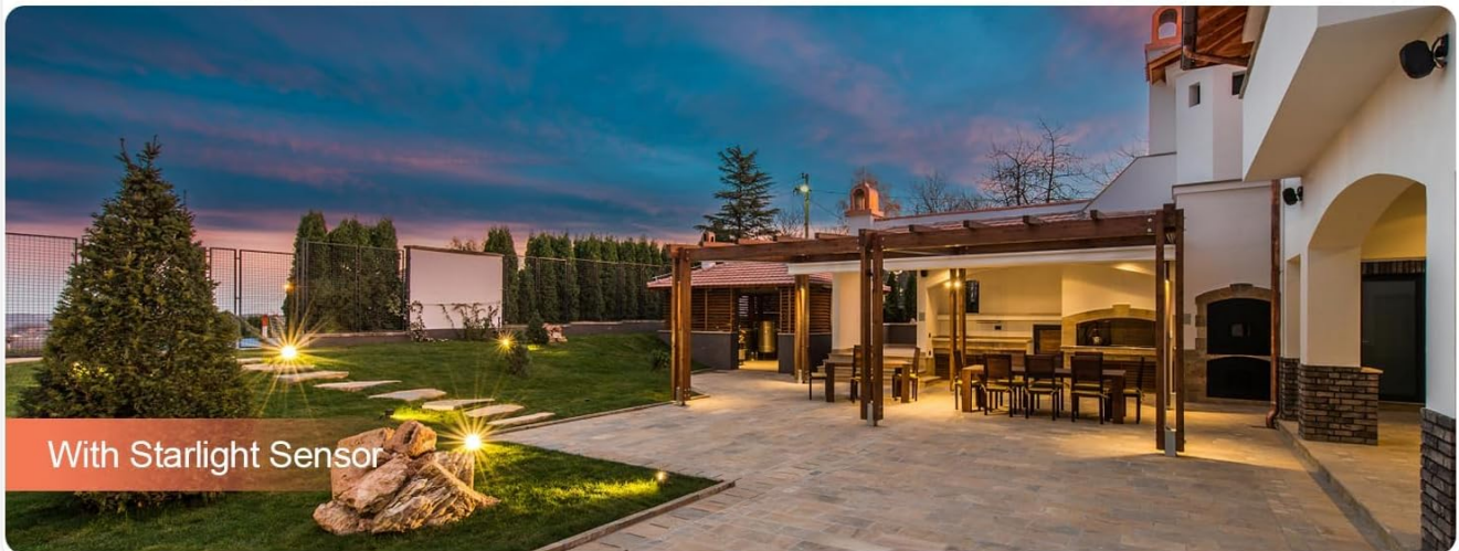
Image: Color Night Vision - Capture every story in color, even at night.