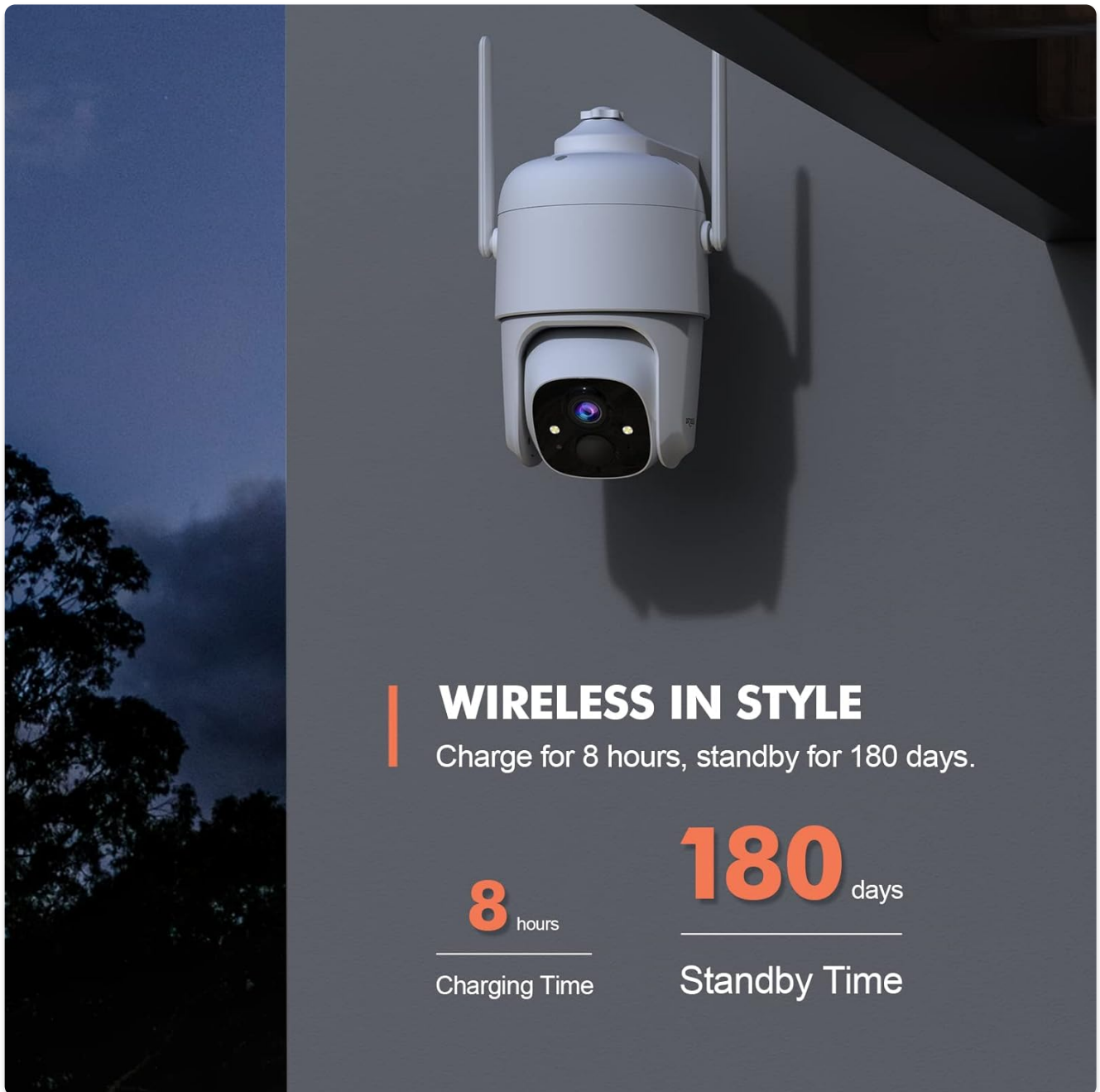
Image: Wireless in Style - Camera and accessories.