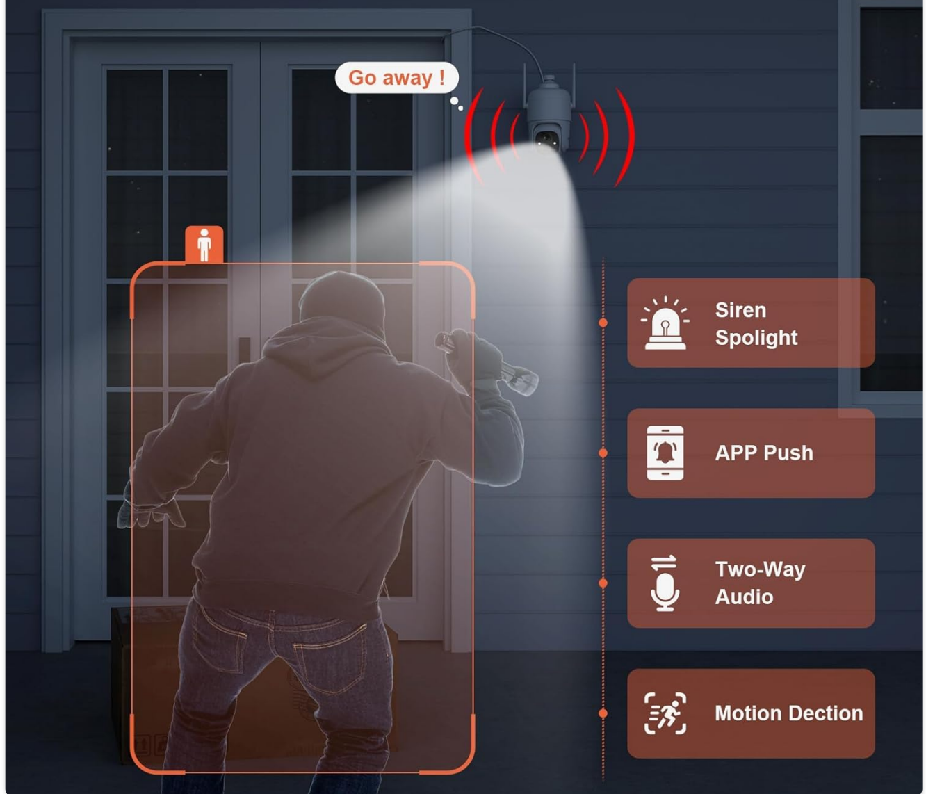
Image: Property Protection with Multi-Alarms.