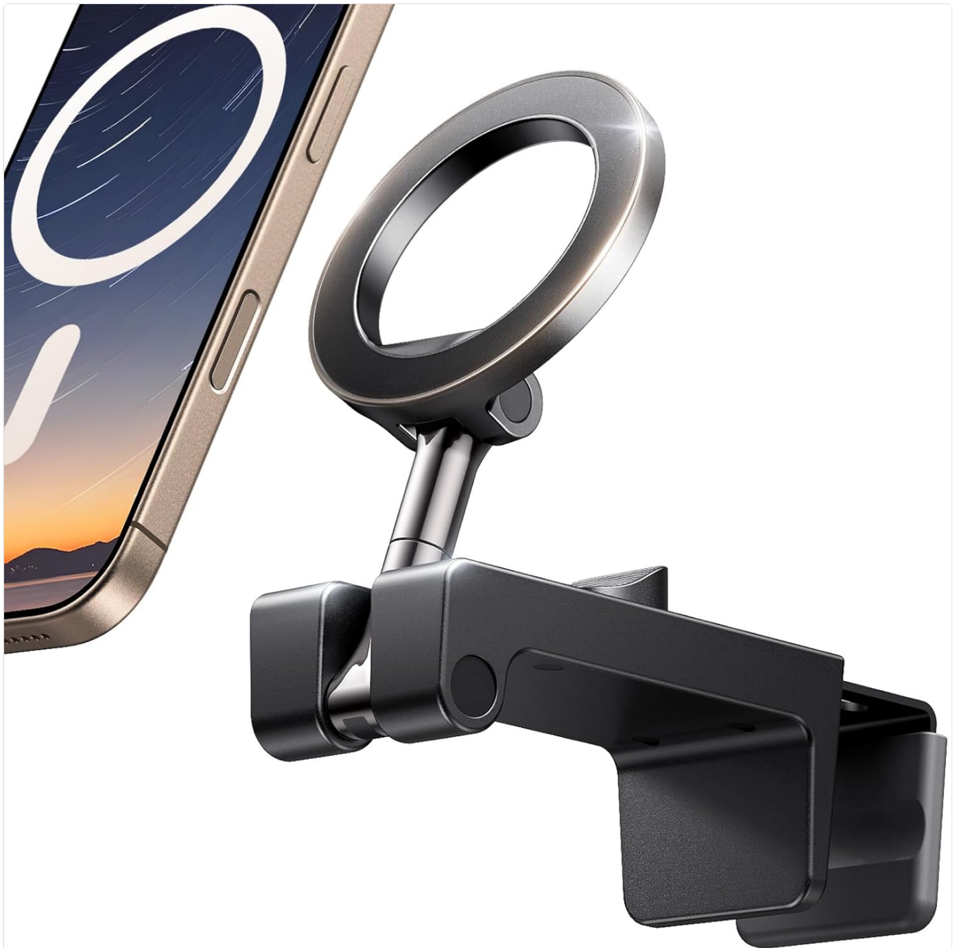
Figure 1.1: UGREEN Magnetic Airplane Phone Holder with a smartphone.