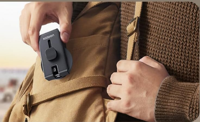
Figure 2.1: Secure clamp lock mechanism with a maximum opening of 0.98 inches.