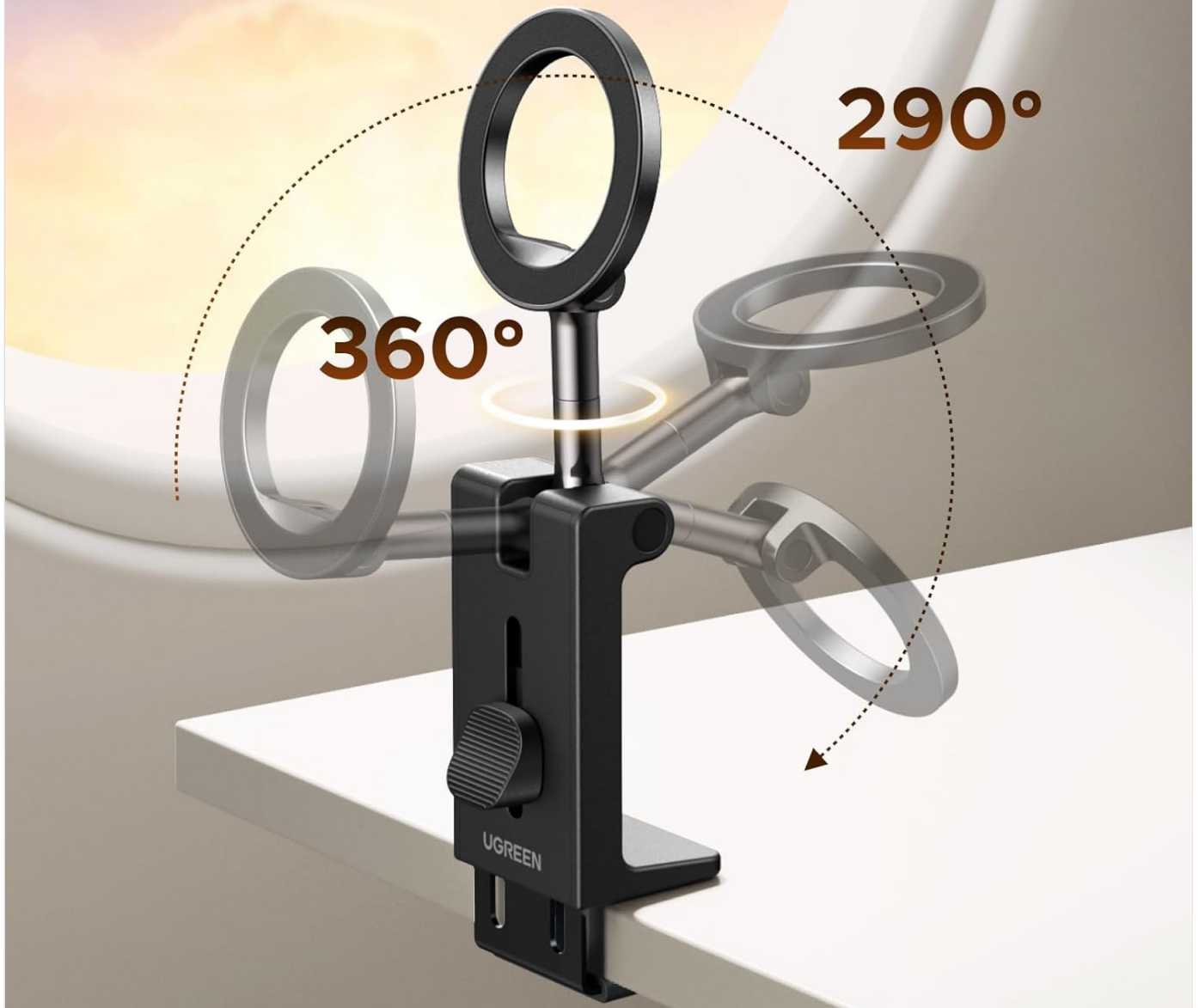
Figure 3.1: Multi-angle adjustment capabilities.