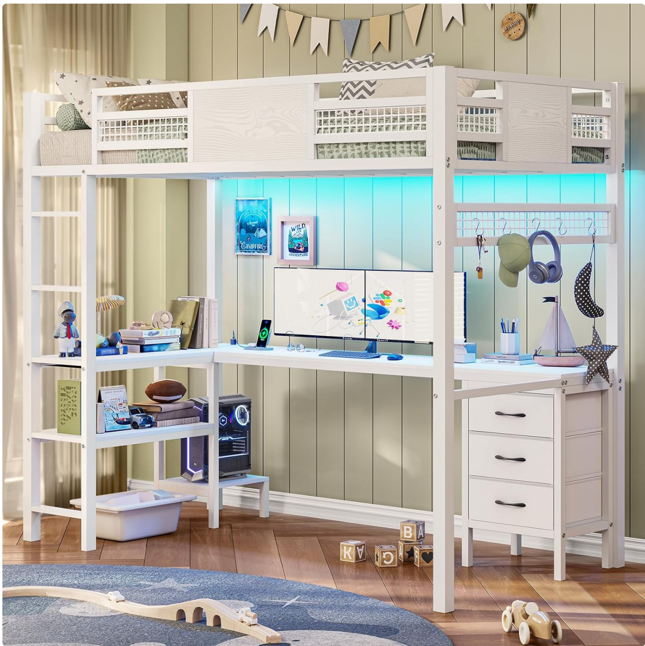
Figure 1: ADORNEVE Twin Loft Bed with L-Shaped Desk