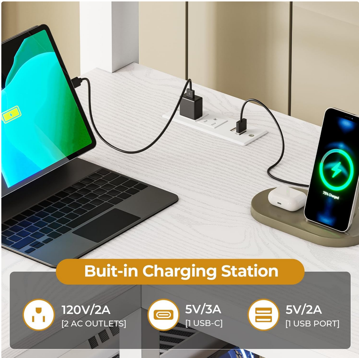
Figure 8: Built-in Charging Station