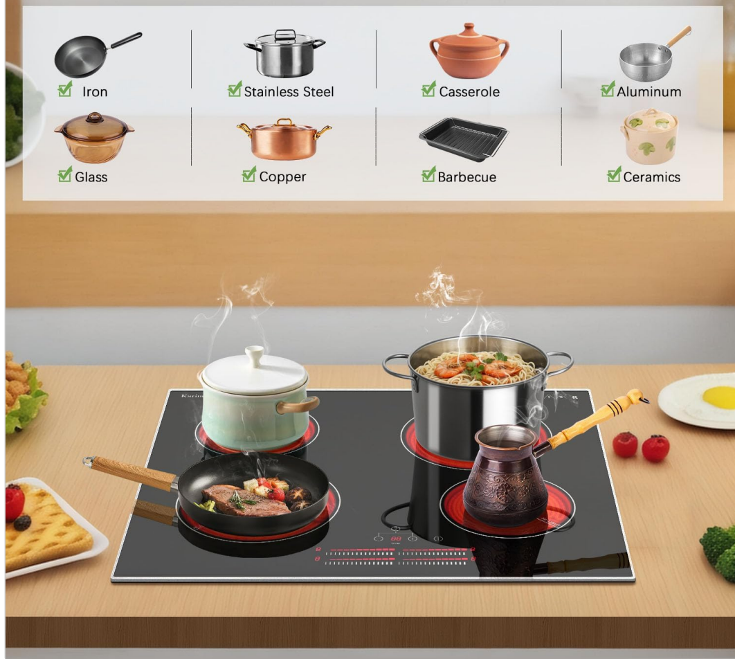
Image: Examples of compatible cookware for the electric cooktop.