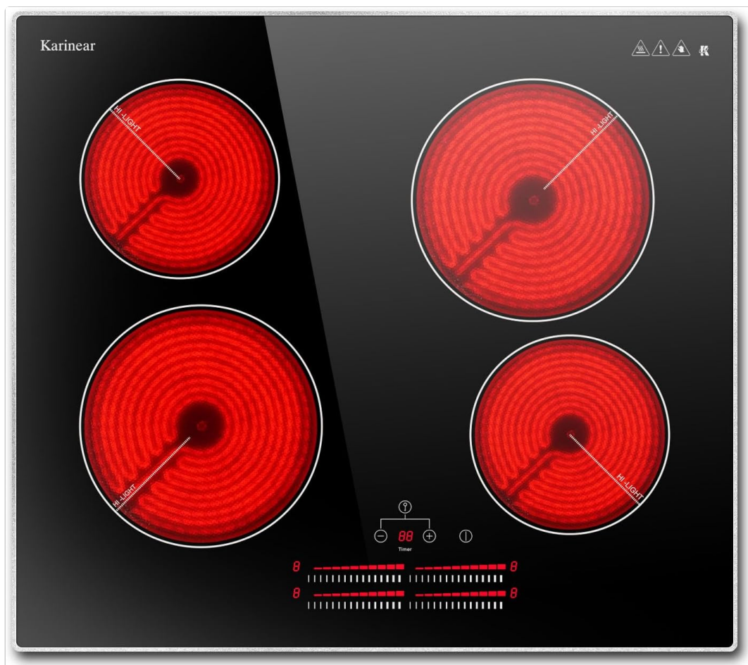
Image: Karinear 24-inch Electric Cooktop with four radiant burners and touch controls.