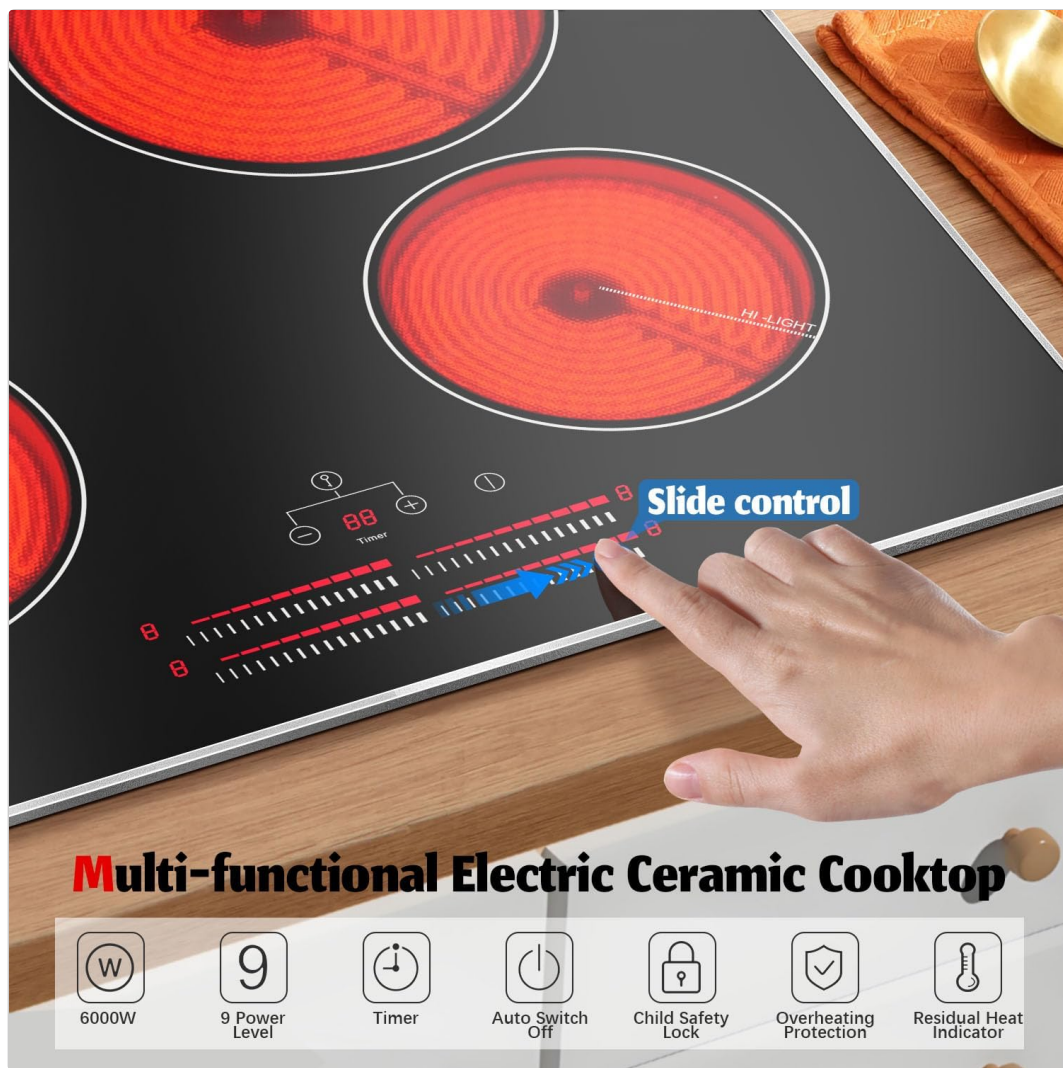
Image: Using the slide control to adjust power levels.