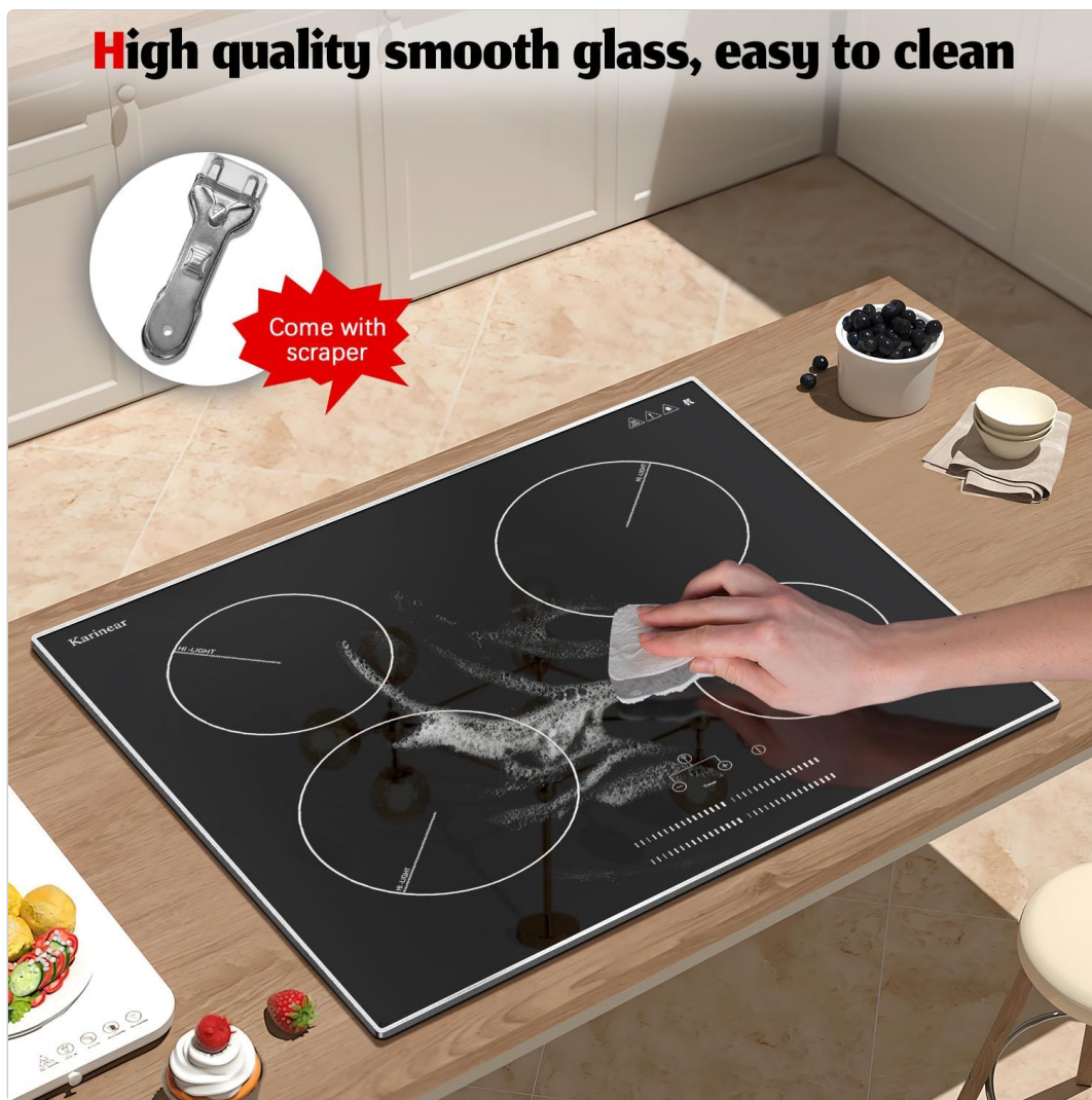
Image: Cleaning the glass-ceramic cooktop surface with a scraper.