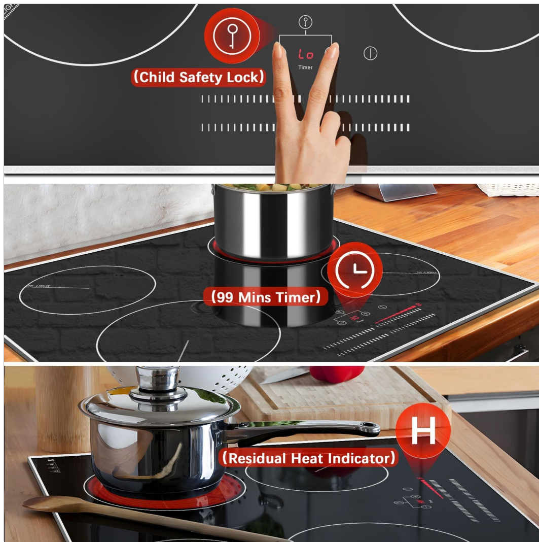
Image: Child Safety Lock, Timer, and Residual Heat Indicator features.