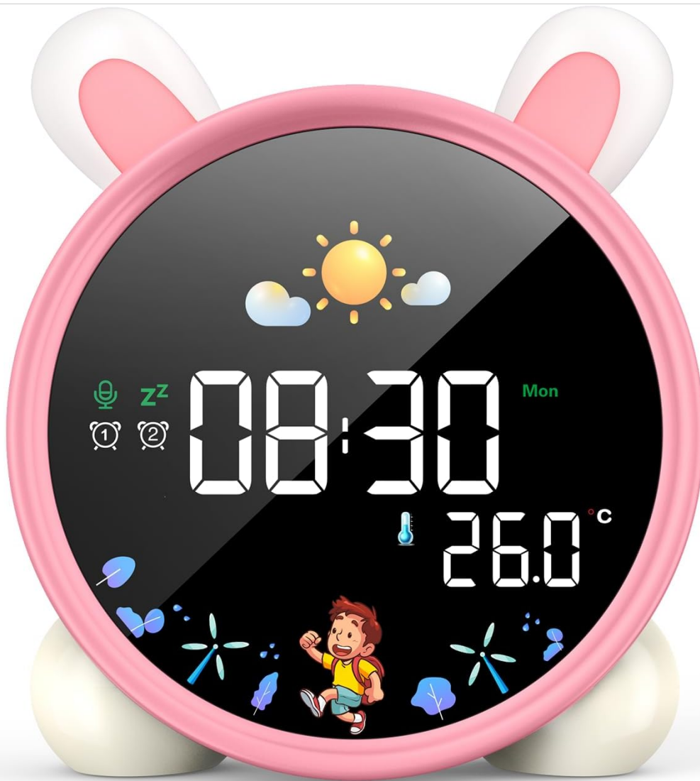
Image: Front view of the LEMNOI SG7 Educational Day/Night Alarm Clock, Rabbit Model, displaying time and temperature.