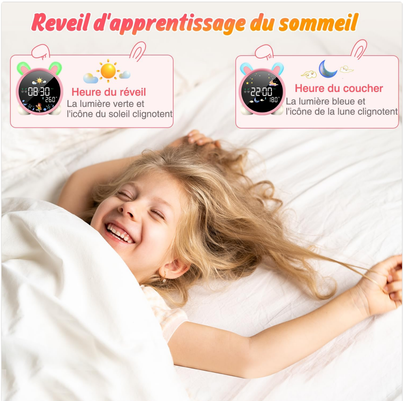
Image: The alarm clock displaying green light and sun icon for wake-up time, and blue light with moon icon for sleep time.

When the set wake-up time approaches, the clock will display a green light and sun icon. For sleep time, a blue light and moon icon will appear.