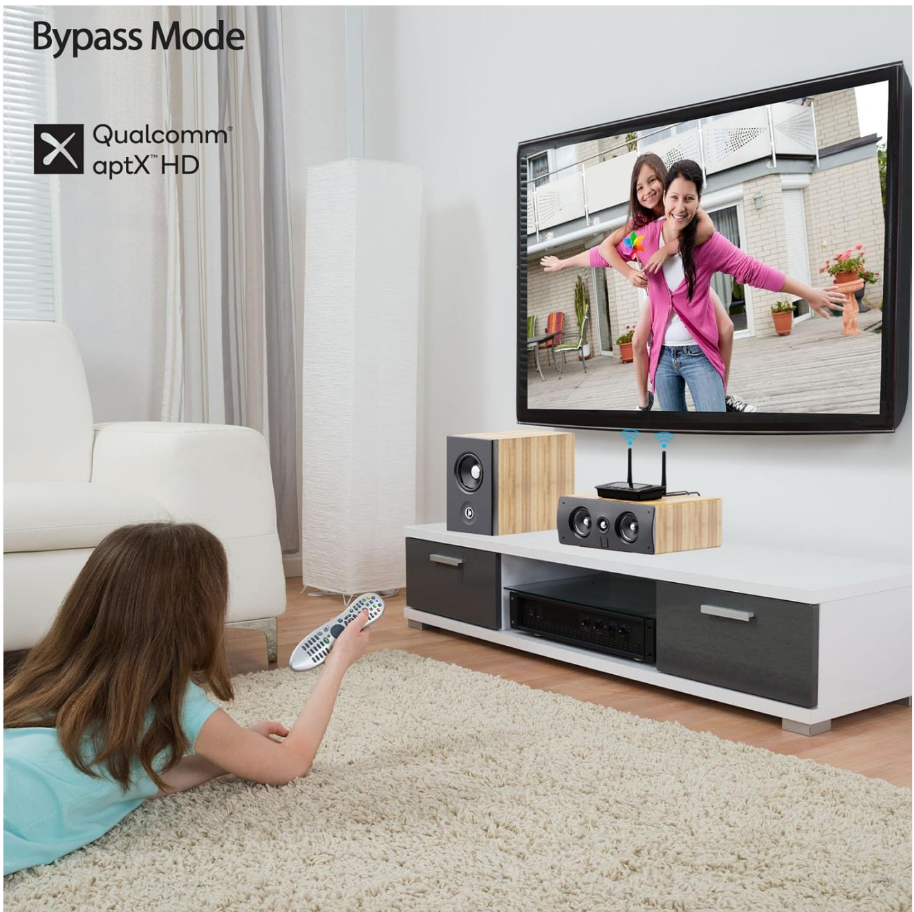
Image: The 1Mii B03Pro in Bypass mode, allowing direct audio output to a soundbar from a TV.