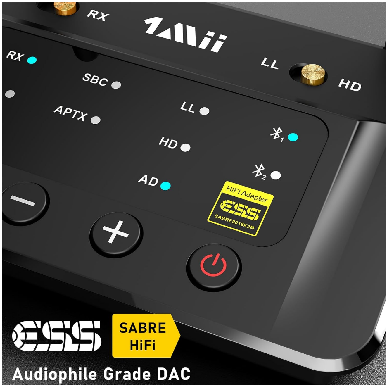
Image: Detail of the 1Mii B03Pro's top panel, showing codec indicators and the ESS SABRE DAC chip.