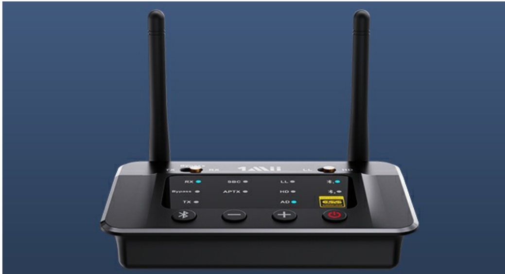
Image: Top view of the 1Mii B03Pro, highlighting controls and indicators.