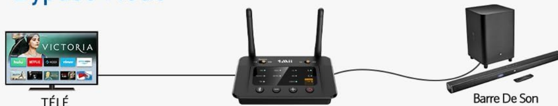
Image: Overview of the 1Mii B03Pro's three operational modes: Receiver, Transmitter, and Bypass.