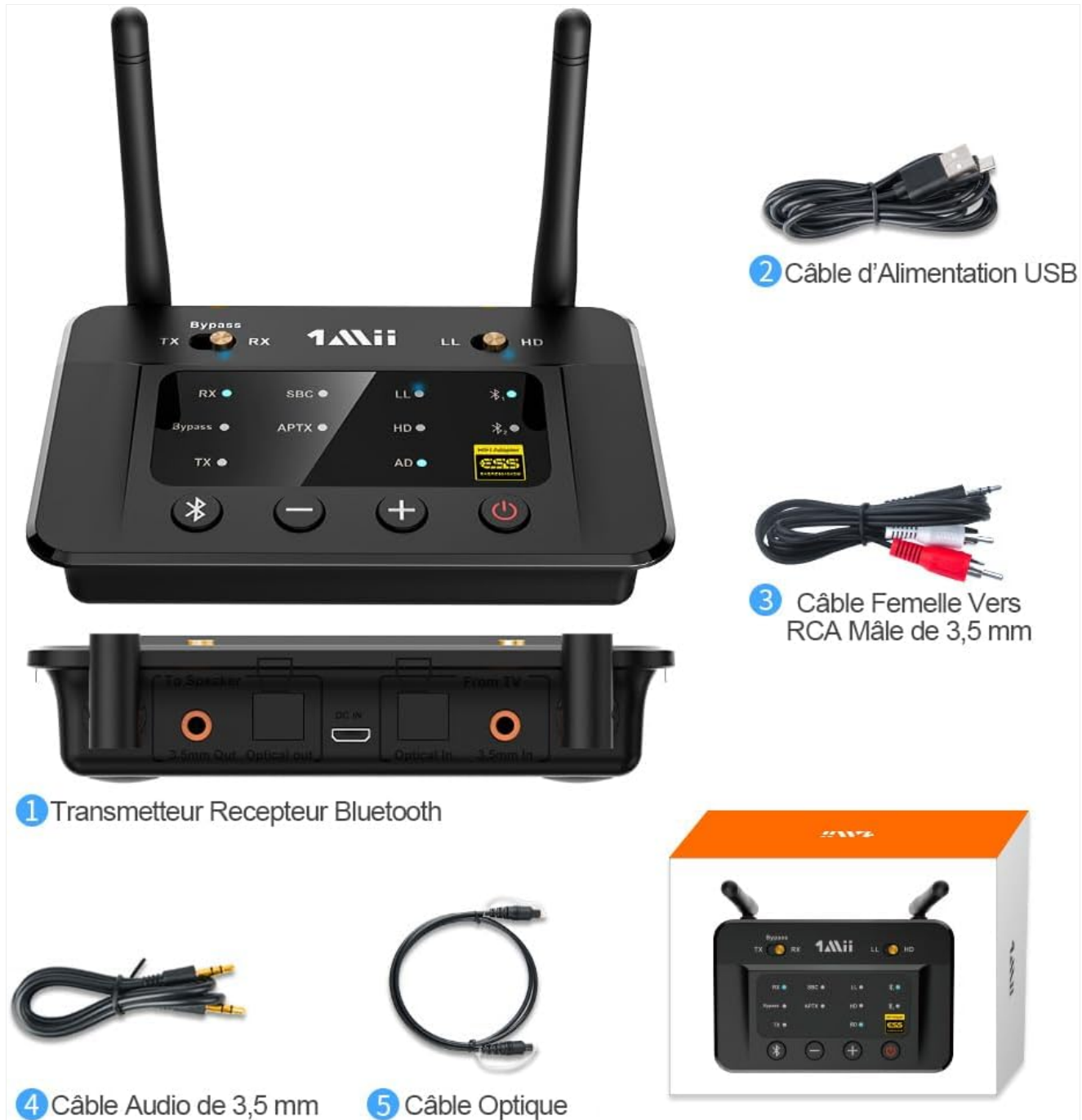
Image: The 1Mii B03Pro unit and its included cables for various audio connections.