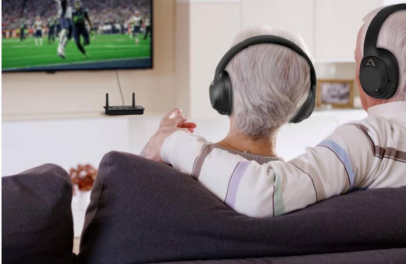
Image: The 1Mii B03Pro in Transmitter (TX) mode, enabling two people to listen to TV audio via Bluetooth headphones.