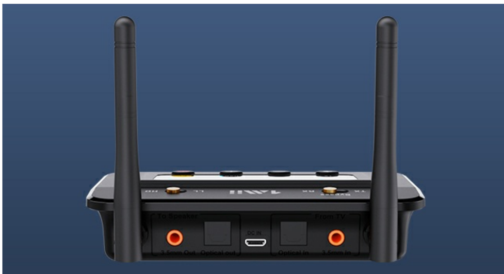
Image: Rear view of the 1Mii B03Pro, showing all connection ports.