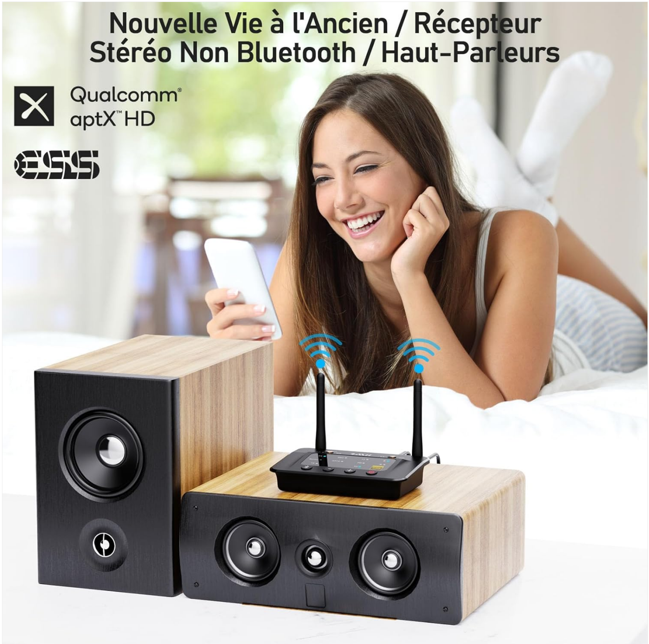
Image: Example of the 1Mii B03Pro in Receiver (RX) mode, connecting a smartphone to traditional speakers.