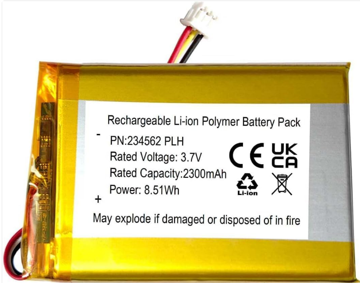
Image 1: XINLANTECH 2300mAh 3.7V Lithium Polymer Battery Pack. This image shows the battery with its specifications printed on the label, including PN: 234562 PLH, Rated Voltage: 3.7V, Rated Capacity: 2300mAh, and Power: 8.51Wh.