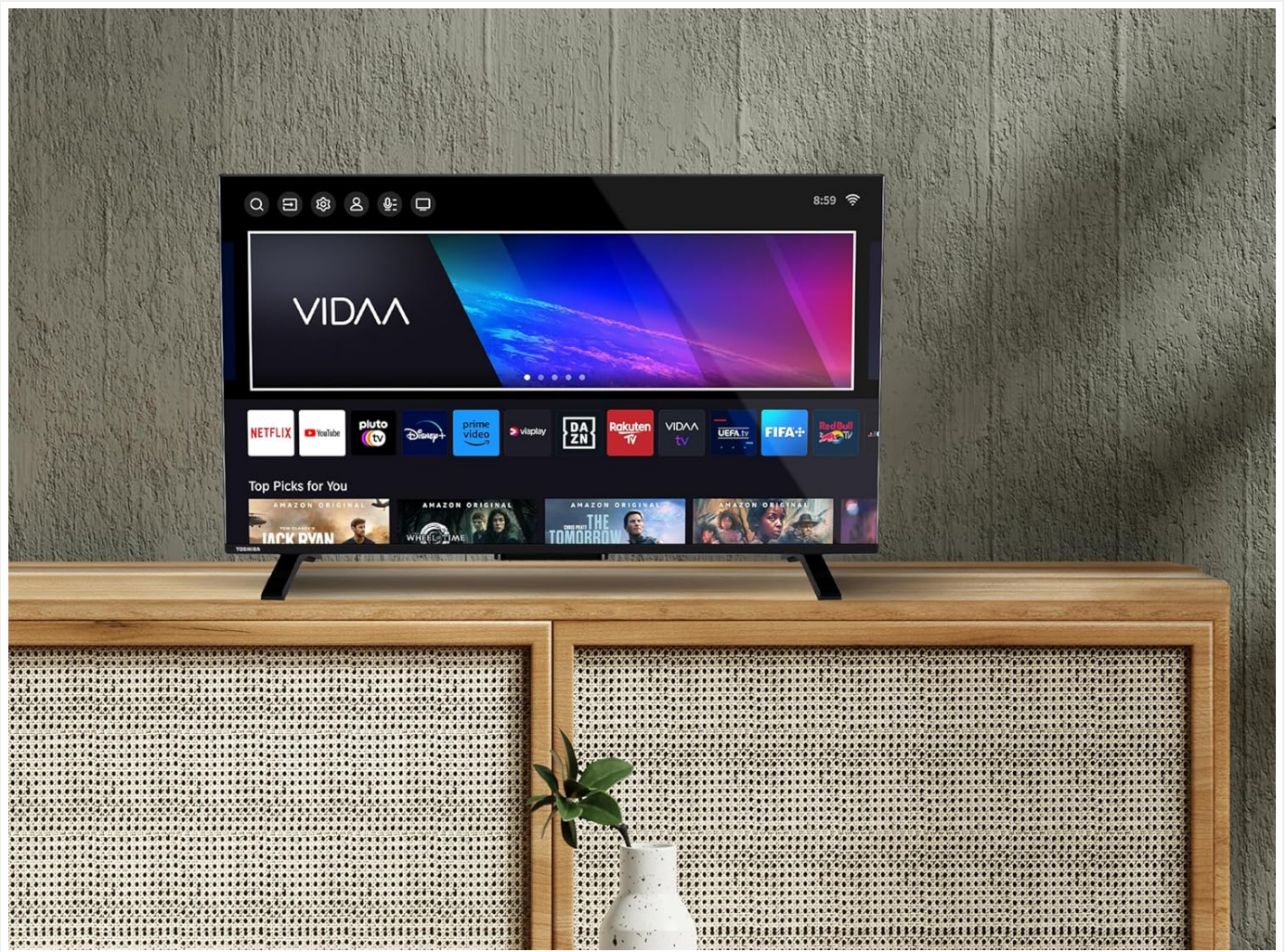
Image 5.2: Toshiba QLED TV in a living room setting. This image shows the television positioned on a piece of furniture, highlighting its slim design and the clarity of its display.