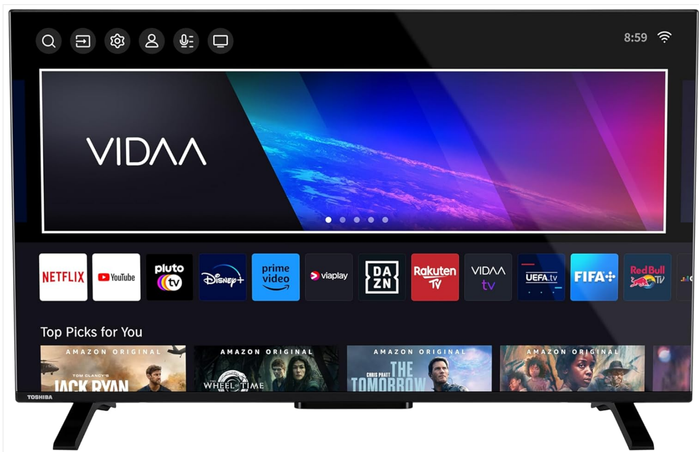
Image 5.1: VIDAA Smart TV Interface. The screen shows the home interface of the VIDAA operating system, featuring icons for popular streaming applications like Netflix, YouTube, and Prime Video.

Your Toshiba TV runs on the VIDAA U6 operating system, providing access to a wide range of applications and streaming services.