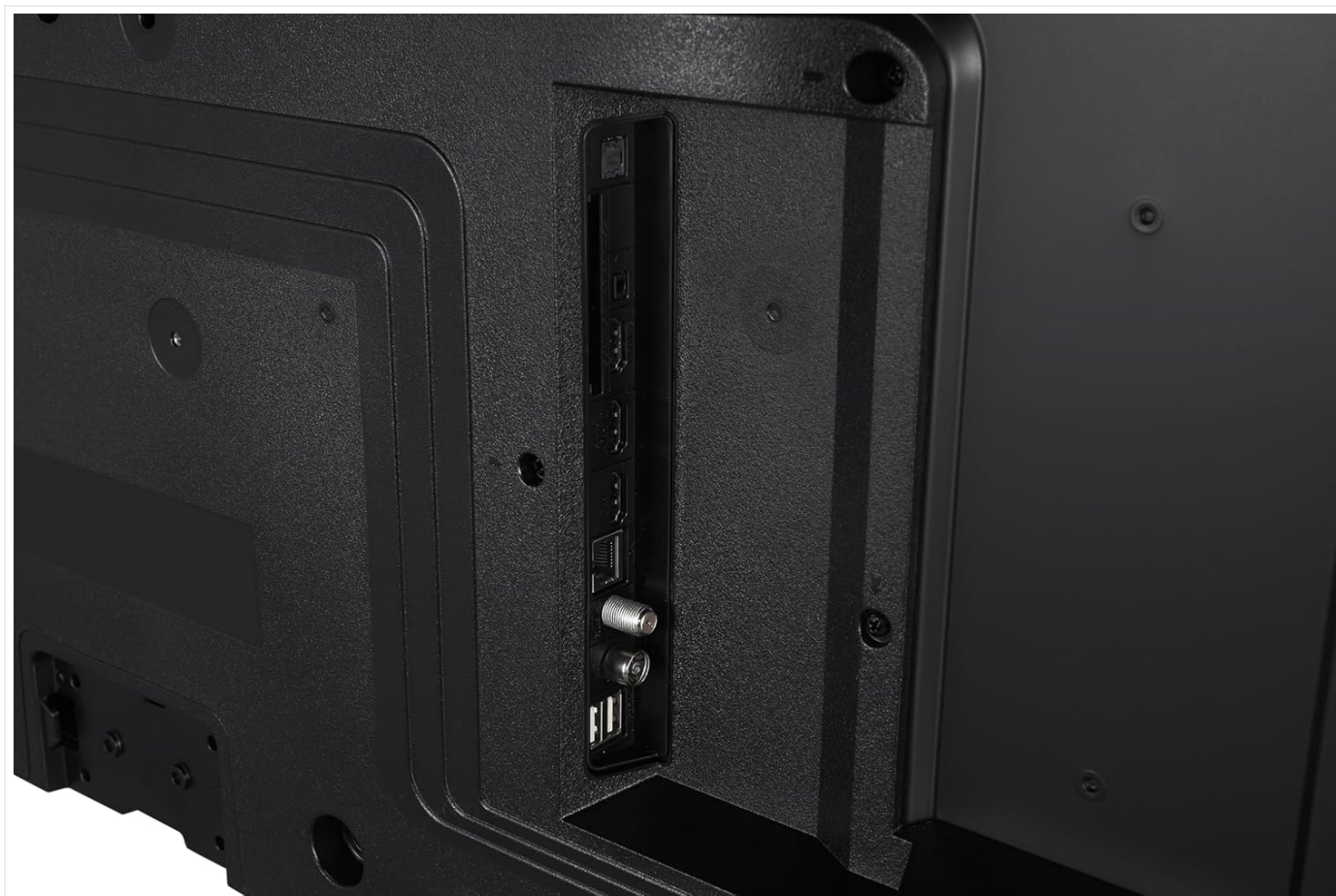
Image 4.2: Rear Connection Ports. This image displays the various input and output ports located on the back of the television, including HDMI, USB, and antenna inputs.