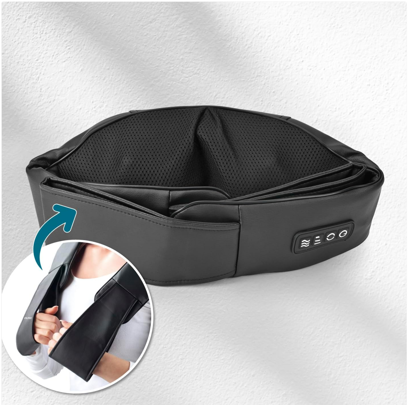
Figure 5.1: The VITALmaxx Shiatsu Massager shown folded, demonstrating its compact design for easy storage or transport.