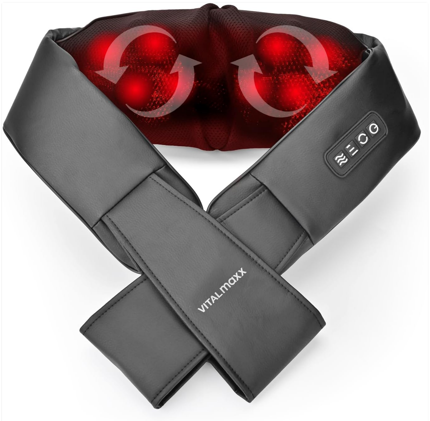
Figure 2.1: Main view of the VITALmaxx Shiatsu Massager. The device is black with a central red mesh area where the massage nodes are located, and two arm loops for user control.