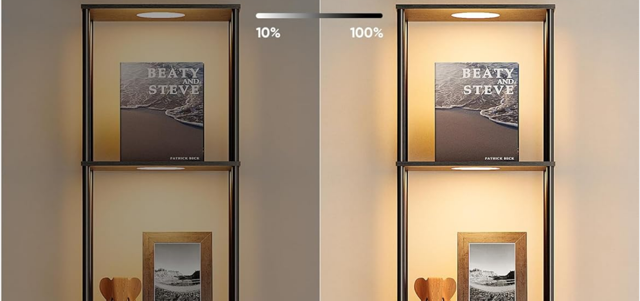
Image 4: Demonstration of adjustable color temperatures and stepless dimming.

Your browser does not support the video tag.