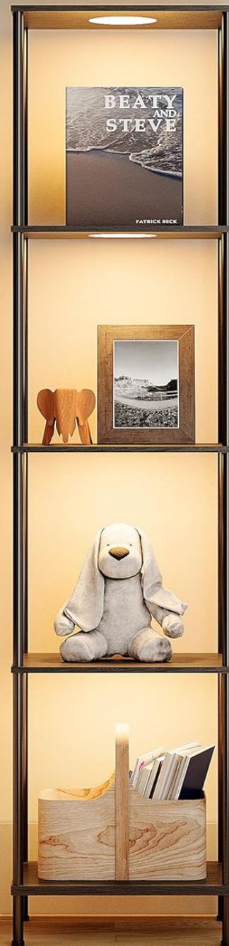
Image 3: Demonstration of 6 adjustable colors and 3 lighting modes.