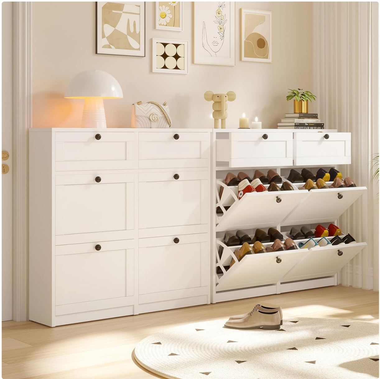
Image: The VOWNER Shoe Cabinet with all four flip-down compartments open, revealing various shoes stored within, alongside the two accessible top drawers.