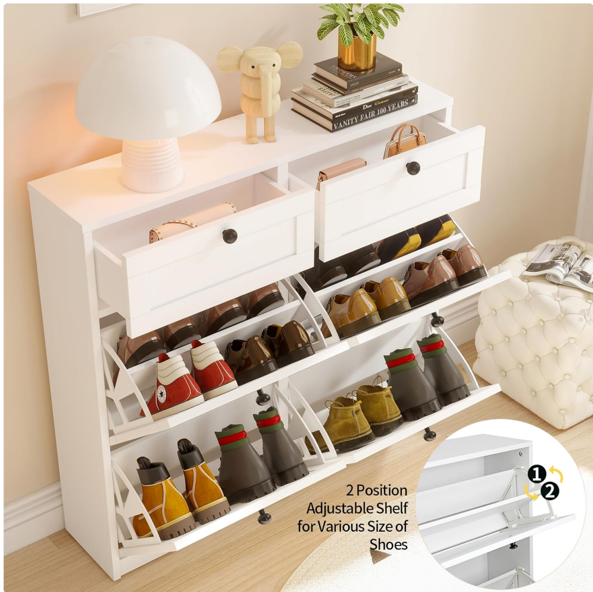
Image: A close-up view of a VOWNER Shoe Cabinet flip-down compartment, illustrating the two-position adjustable shelf feature designed to accommodate various shoe sizes.