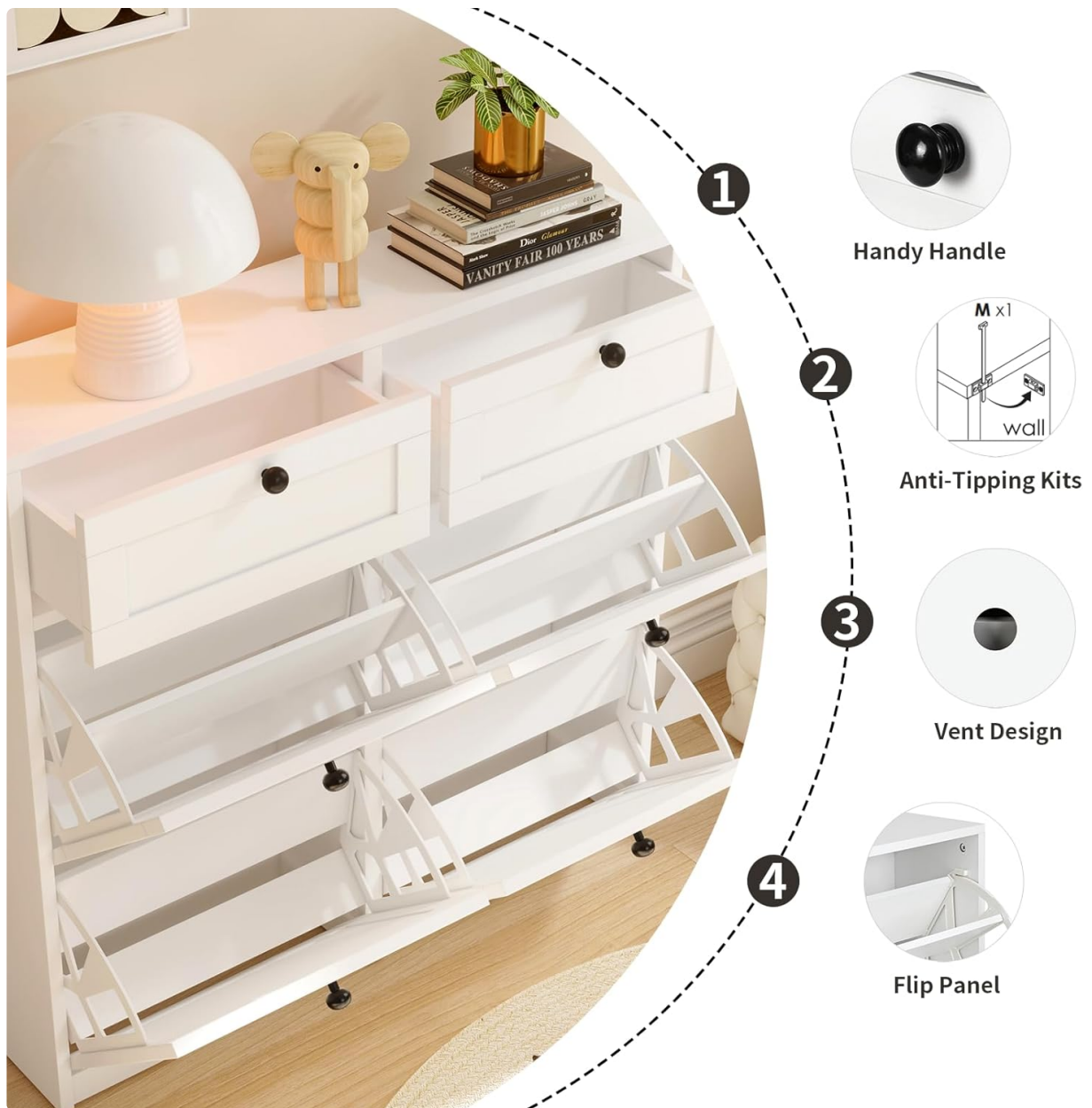
Image: A visual guide highlighting the key components and features of the VOWNER Shoe Cabinet, including handles, anti-tipping kits, ventilation, and the flip-down panel design.

Video: Official product video demonstrating the VOWNER Shoe Cabinet's features and providing a visual overview of its functionality.