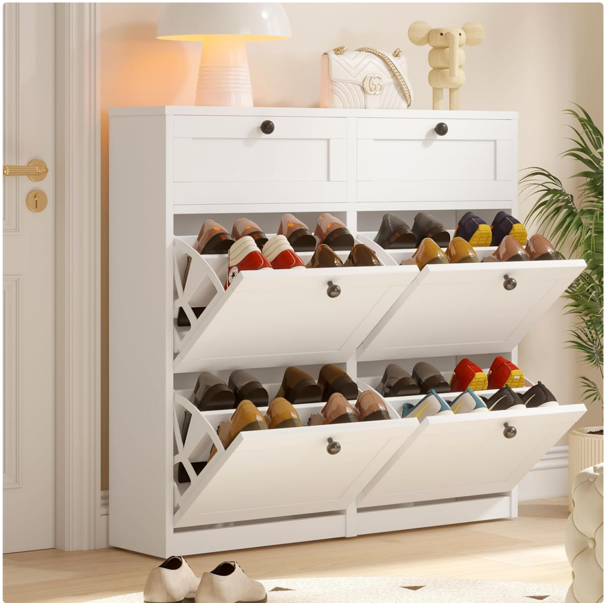
Image: The VOWNER Shoe Cabinet in white, showcasing its design with four flip-down shoe compartments and two top drawers, ideal for an entryway.