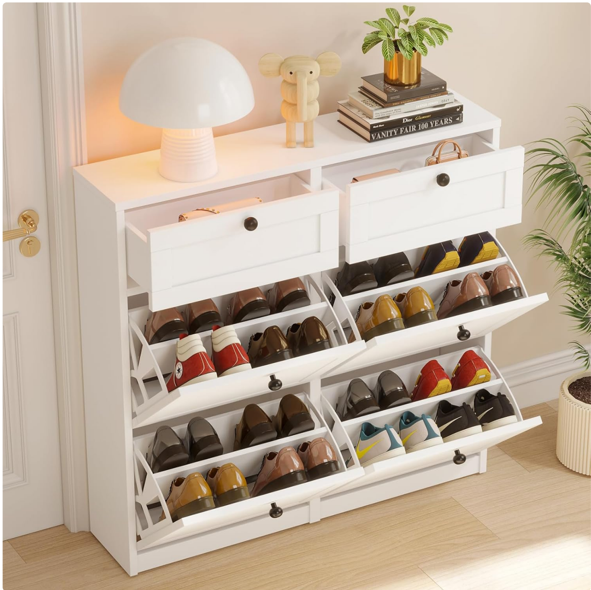
Image: The VOWNER Shoe Cabinet showcasing shoes neatly stored in its open flip-down compartments, with the top drawers also open to reveal additional storage for accessories.