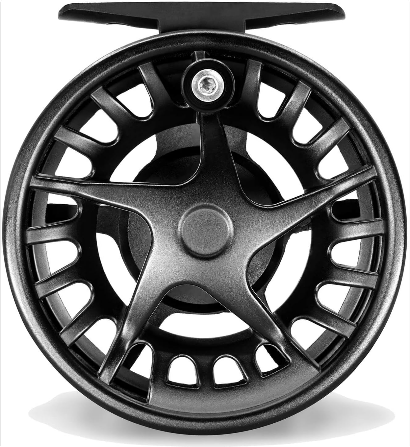
Figure 4: Back view of the Delphin ERAX Fly Fishing Reel, showing the drag adjustment knob for fine-tuning line tension.