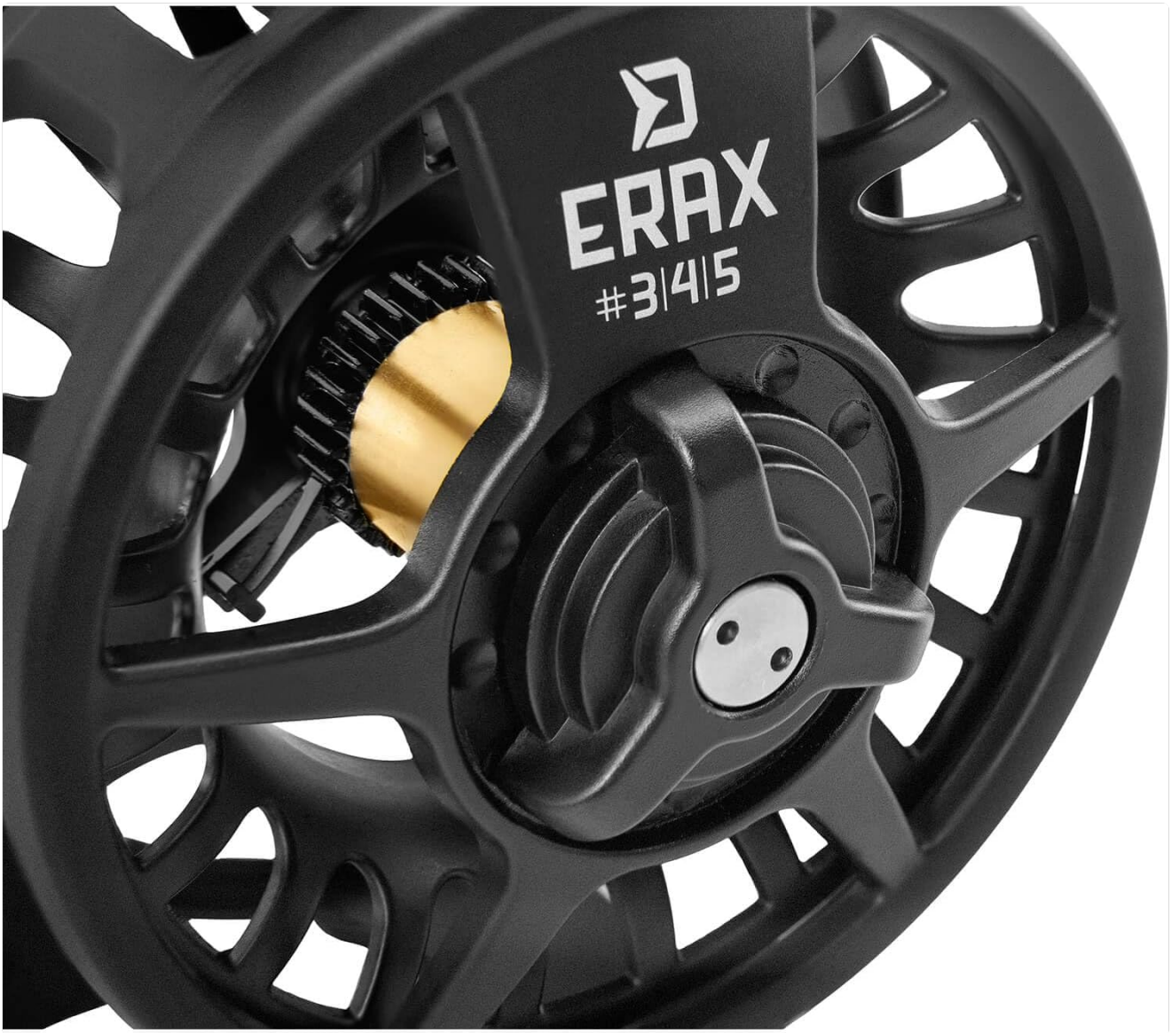
Figure 6: Close-up of the ERAX reel's drag system, illustrating the internal components that benefit from proper cleaning and care.