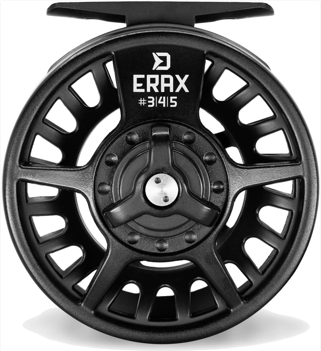
Figure 1: Front view of the Delphin ERAX Fly Fishing Reel. Note the matte black finish and the overall robust construction.