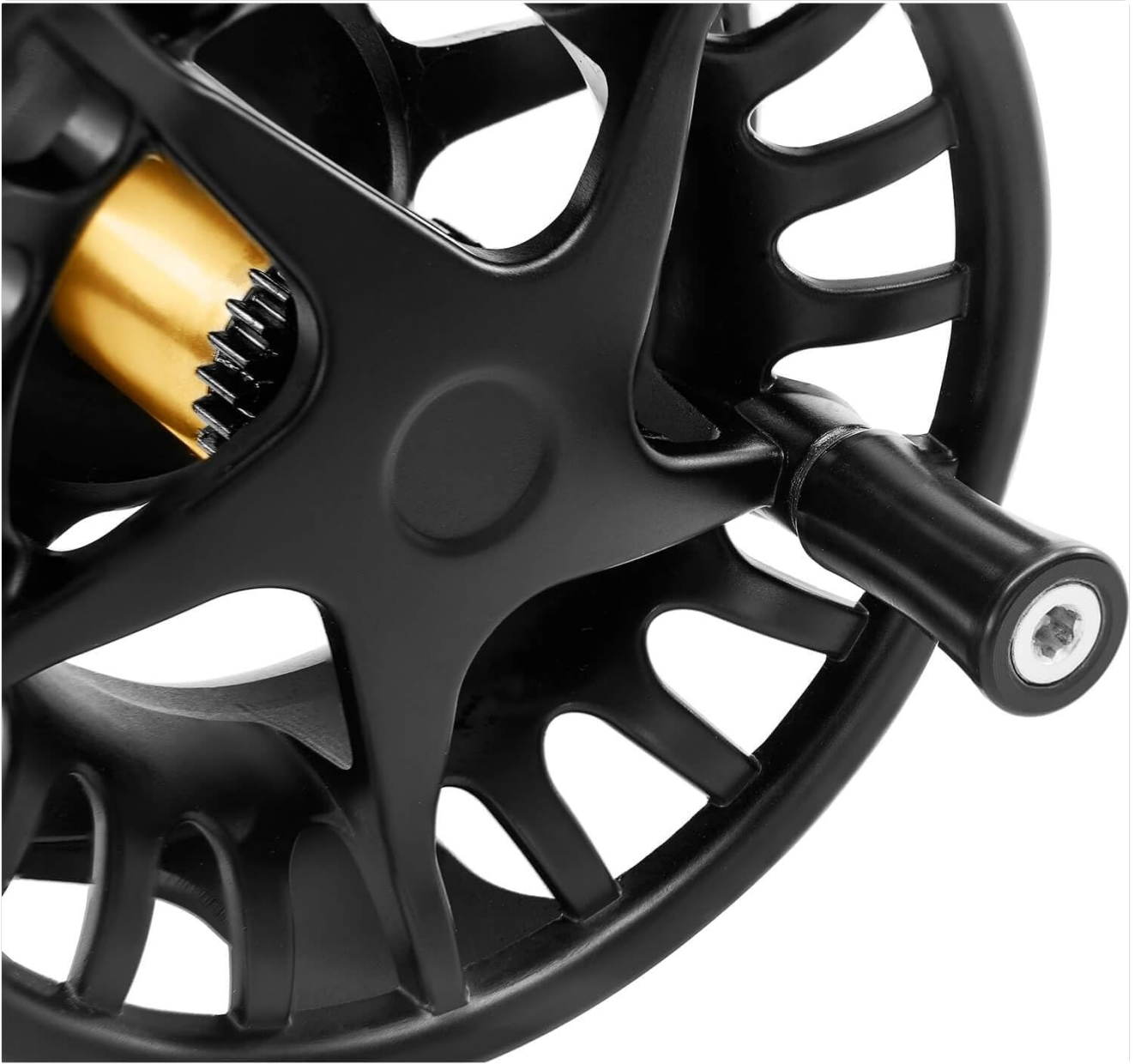
Figure 5: Close-up of the Delphin ERAX Fly Fishing Reel's handle and spool, demonstrating the design for comfortable retrieval.