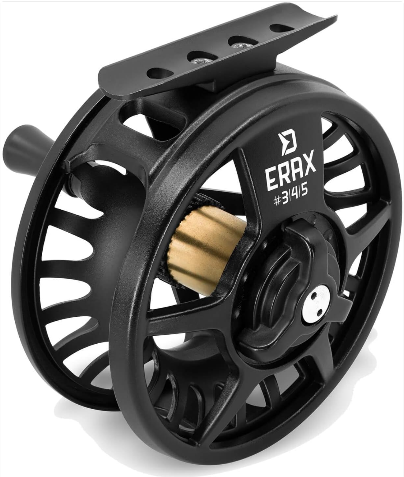
Figure 2: Side view of the Delphin ERAX Fly Fishing Reel, illustrating the wide spool design for optimal line management.