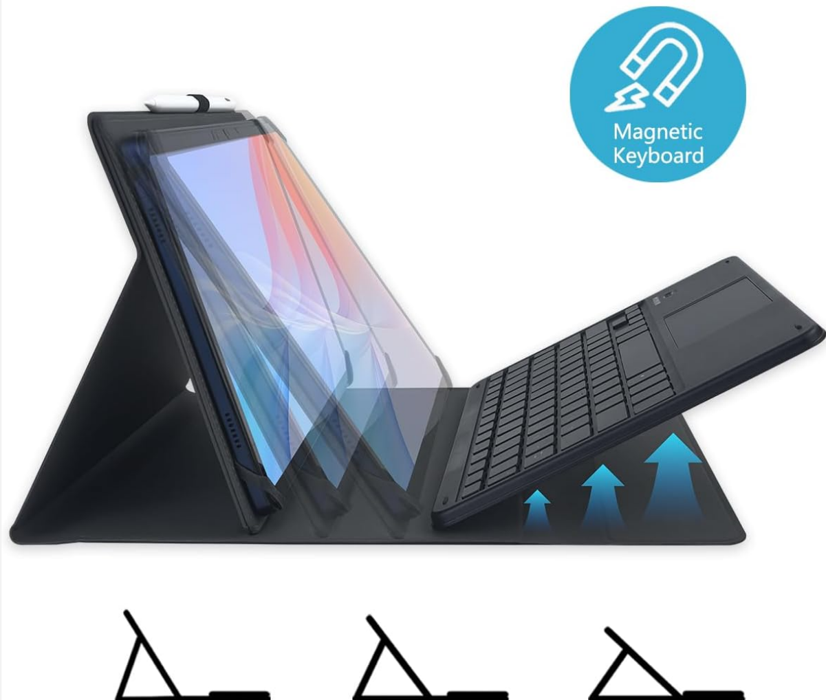
Image 3.4: The MePadKey case configured to provide an adjustable viewing angle for the tablet. The detachable magnetic keyboard is shown positioned for comfortable typing, illustrating the flexibility of the design.