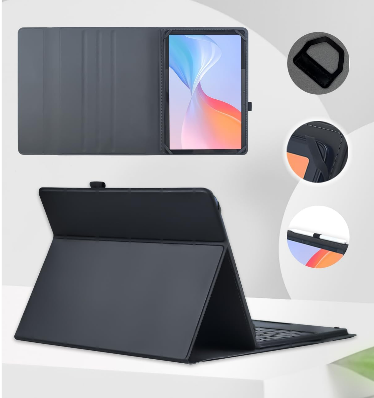
Image 2.1: A close-up view of the elastic corner straps designed to hold the tablet securely within the case. The image highlights the flexible nature of the straps for accommodating different tablet dimensions.

Retractable elastic band to accommodate different sized devices