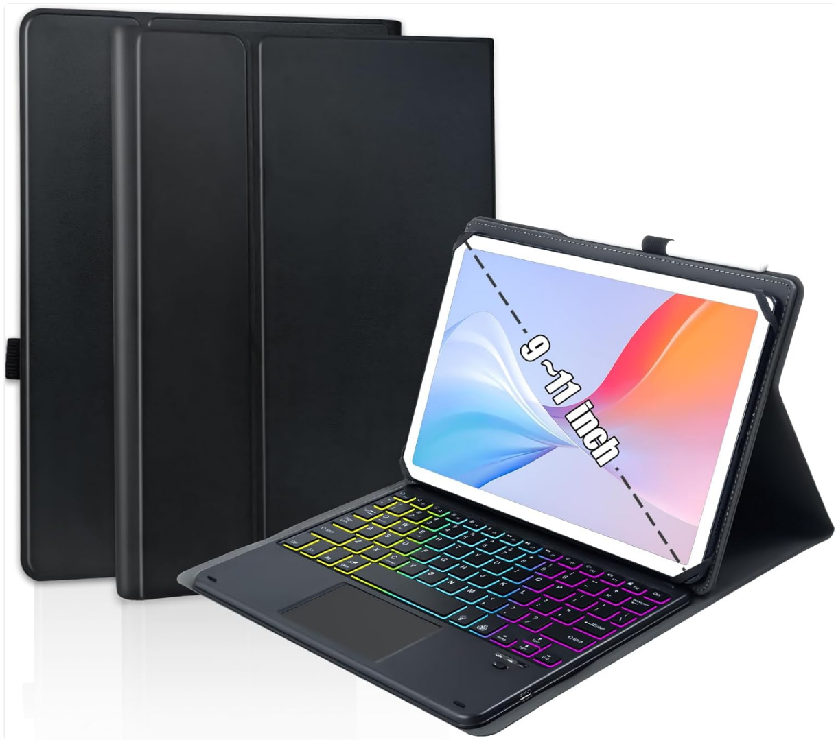
Image 1.1: MePadKey Universal Touchpad Keyboard Case with a tablet displaying a colorful screen and the keyboard's rainbow backlight activated. The case is black and designed to hold tablets between 9 and 11 inches.