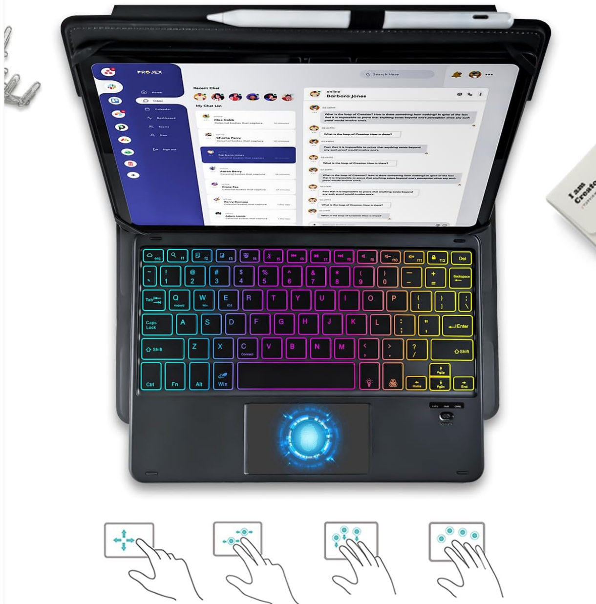
Image 3.2: A visual guide demonstrating common multi-finger touchpad gestures, such as scrolling, zooming, and switching applications, to enhance navigation on your tablet.

(Different systems have different gesture effects)