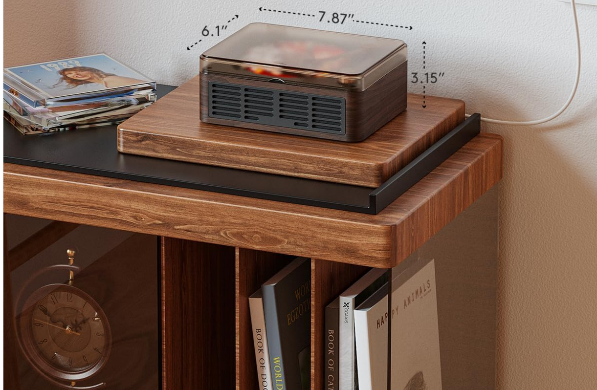
Image: The CARONSORT CD Player with its physical dimensions clearly marked for reference.

Top opening CD player compact size, record player look, actual CD player.