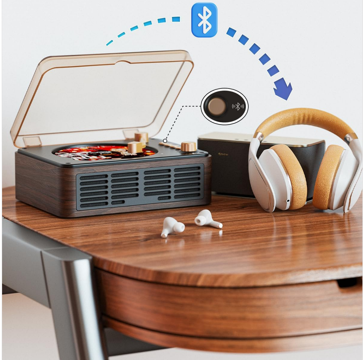
Image: The CD player wirelessly transmitting audio via Bluetooth to a pair of over-ear headphones and in-ear earbuds.

When playing a CD album on a CD player You can listen to CD songs with a Bluetooth device.