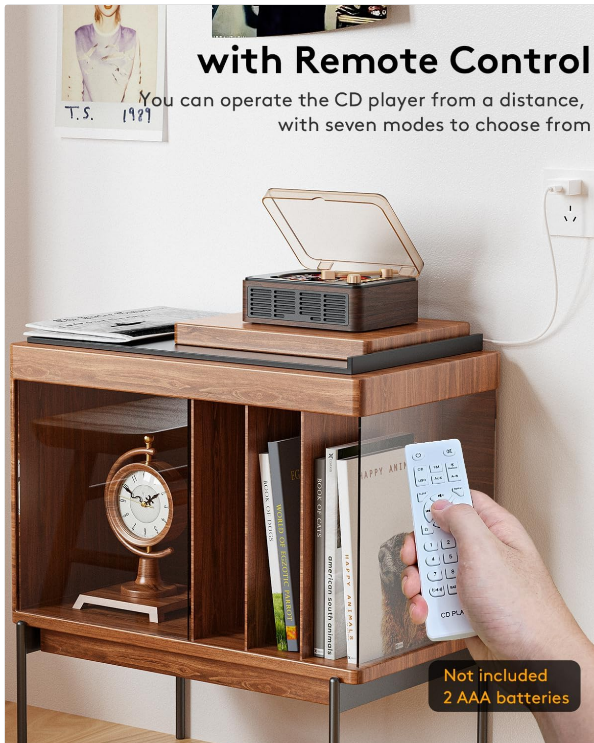
Image: A hand holding the white remote control, showing its various buttons for controlling the CD player's functions.

The included remote control provides full functionality for operating the CD player from a distance. Insert 2x AAA batteries (not included) into the remote before use.