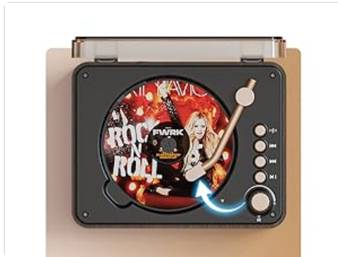
Image: The tone arm is shown in position over a CD, signifying that the player is in CD playback mode.