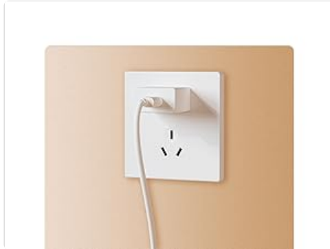
Image: The USB power adapter connected to a wall socket, ready to power the device.