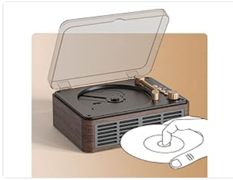
Image: A hand demonstrating the correct way to place a compact disc onto the player's central spindle.