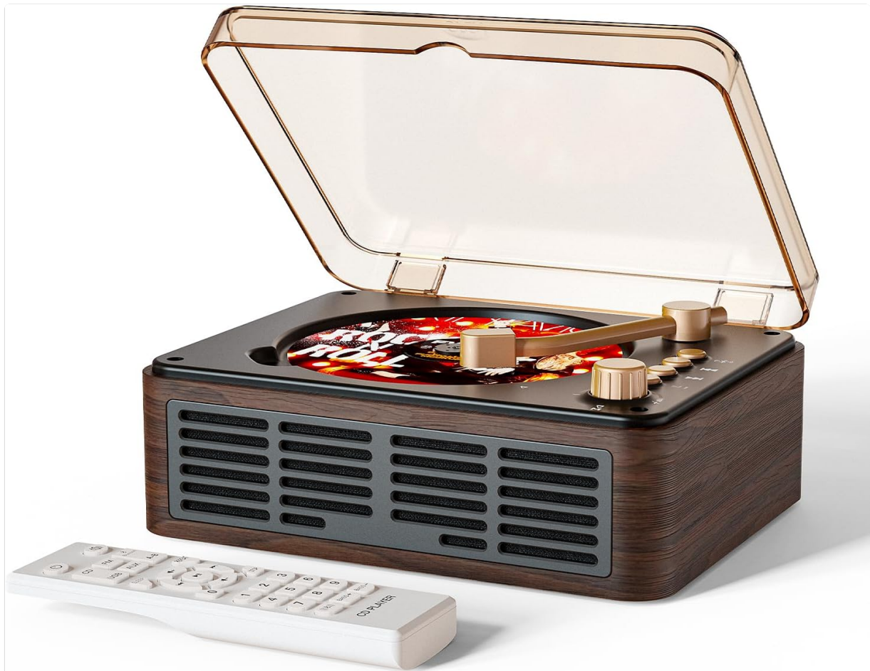
Image: Front and top view of the CARONSORT CD Player, displaying the CD compartment, control knobs, and integrated speakers.