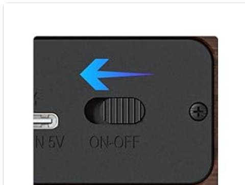
Image: A close-up of the power toggle switch, indicating its function for turning the unit on or off.