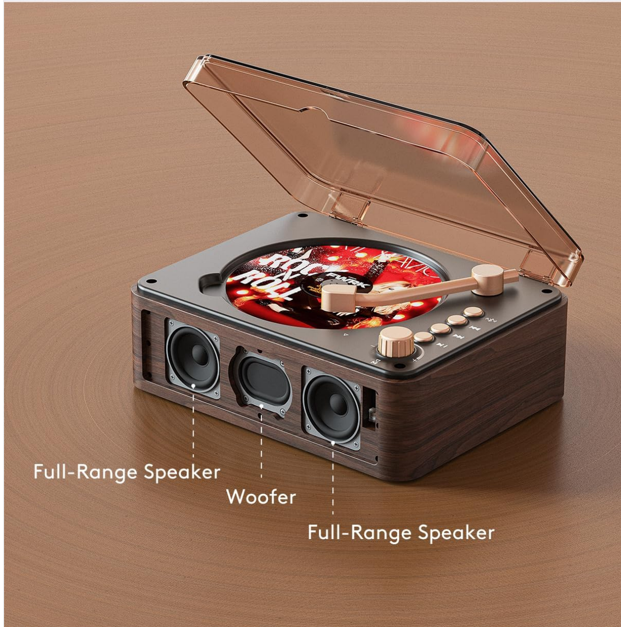
Image: Internal view highlighting the speaker setup: two full-range speakers and a central woofer for enhanced bass. The unit features a 2.1 speaker system with two full-range speakers and one dedicated woofer for improved bass response. Bass boost functionality can be controlled via the remote.

1 Bass + 2 full-range speakers for better sound quality