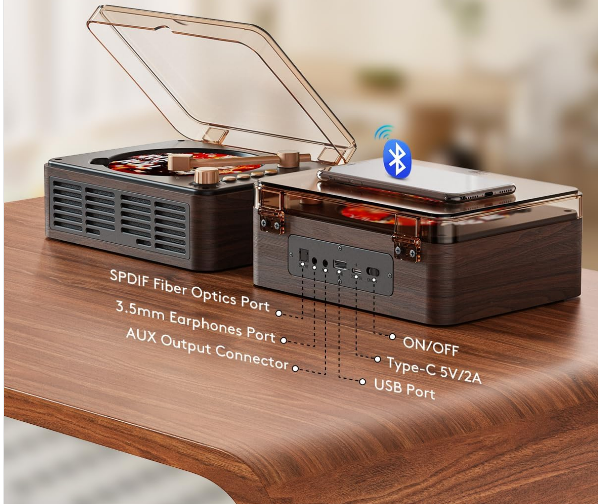
Image: Detailed view of the rear panel, indicating the locations of the SPDIF Fiber Optics Port, 3.5mm Earphones Port, AUX Output Connector, Type-C 5V/2A power input, USB Port, and the ON/OFF switch.