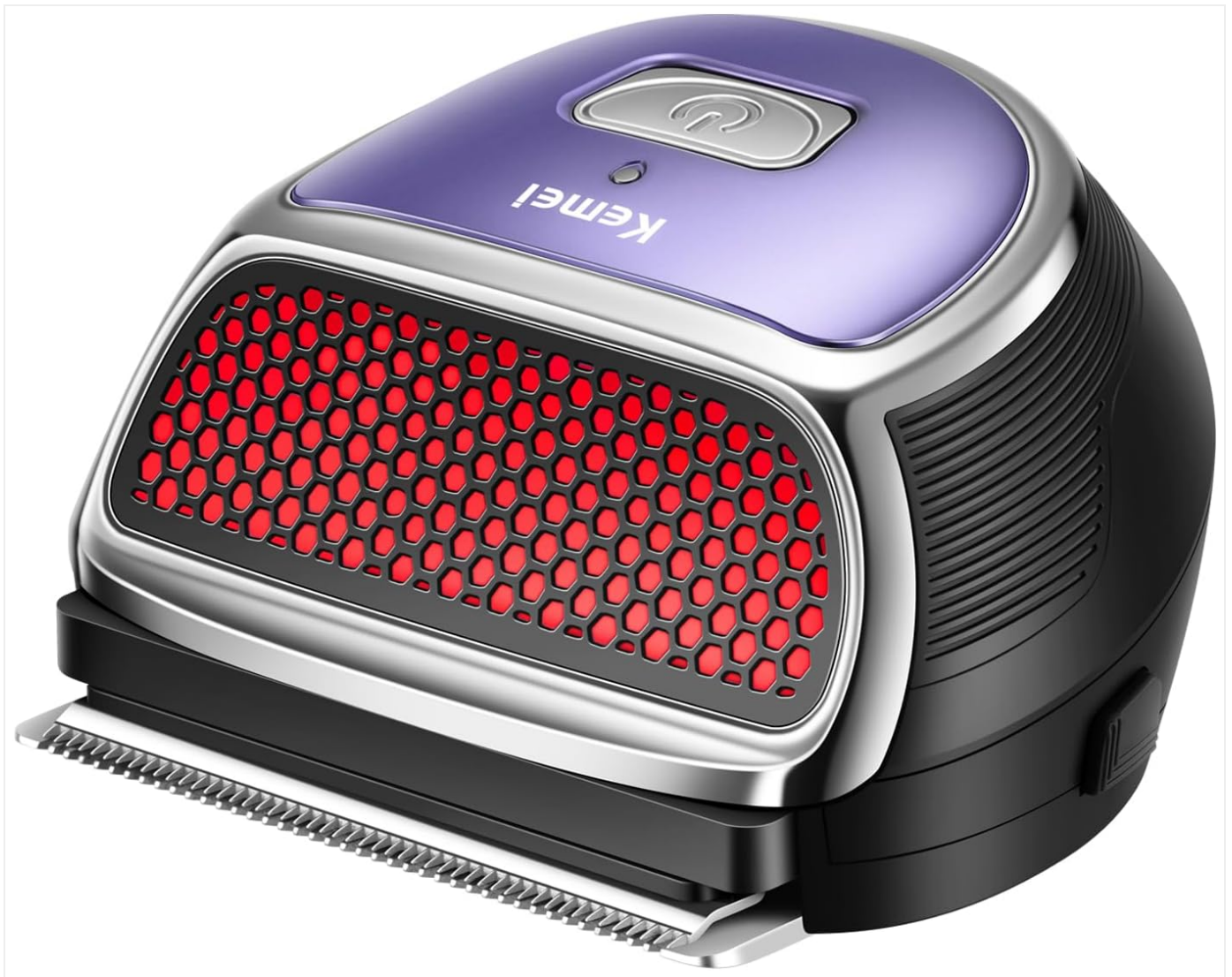
Figure 1: KEMEI Shortcut Self-Haircut Kit, a compact and ergonomic hair clipper designed for easy self-grooming.