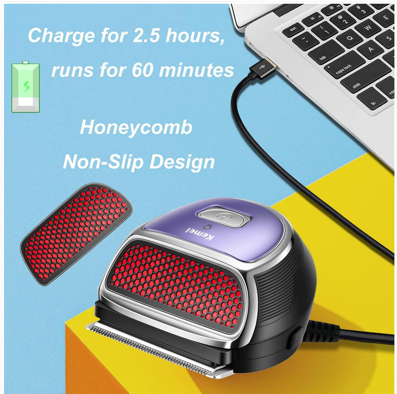
Figure 7: The clipper can be conveniently charged via USB from various power sources.