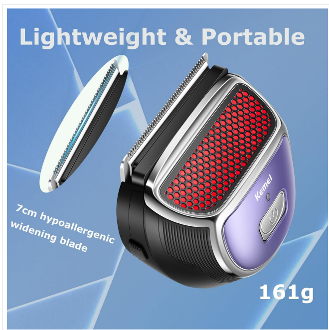
Figure 3: The clipper's lightweight and portable design, weighing only 161g, makes it ideal for travel.