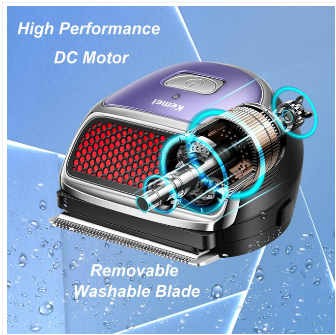
Figure 5: High-performance DC motor ensures consistent and powerful cutting.