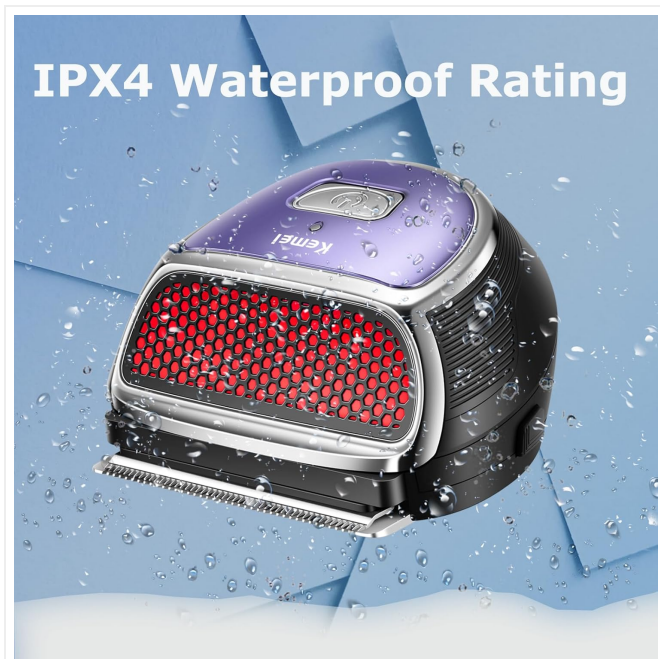
Figure 4: The IPX4 waterproof rating allows for easy cleaning of