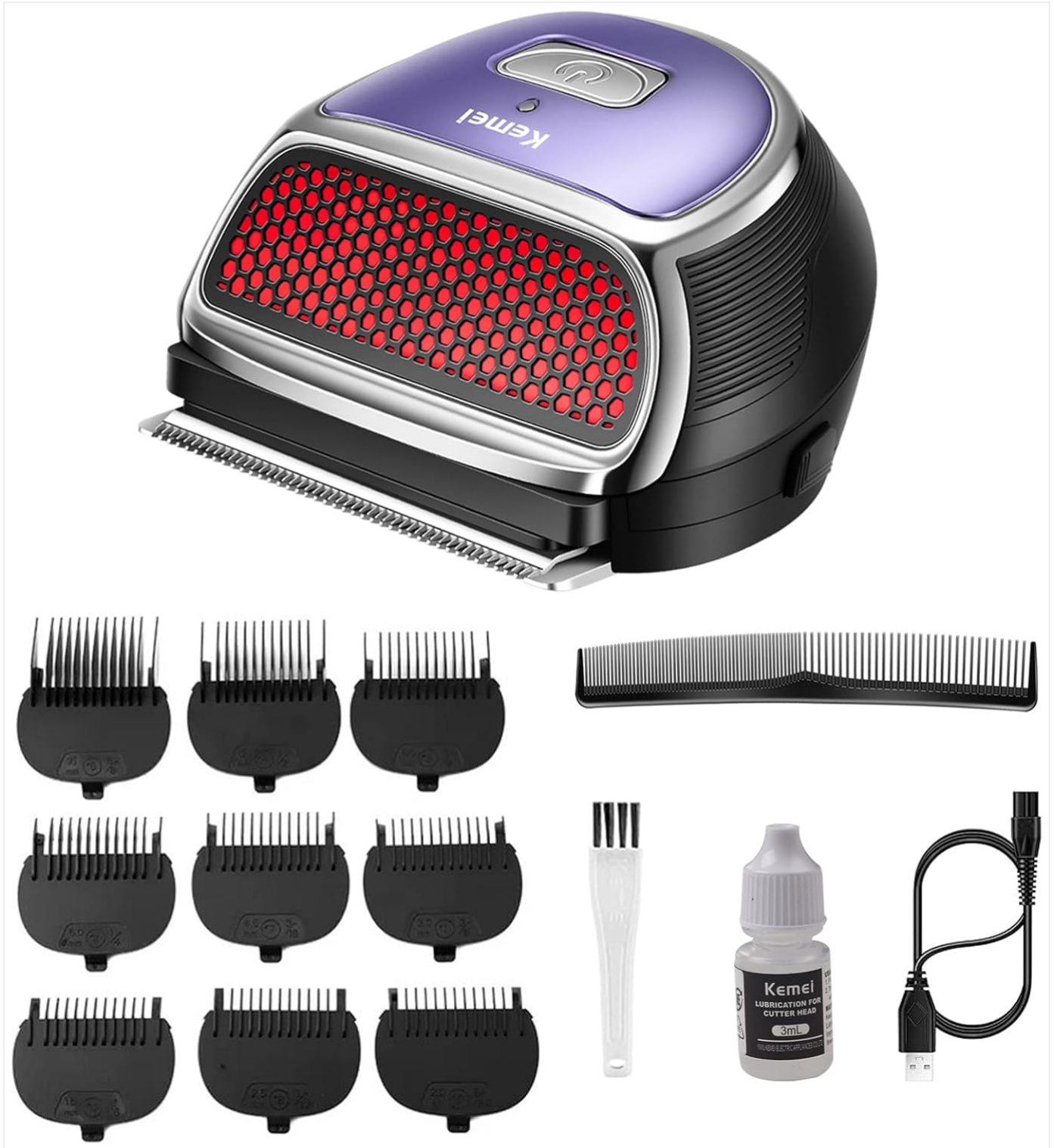
Figure 2: All components included in the KEMEI Shortcut Self-Haircut Kit package.