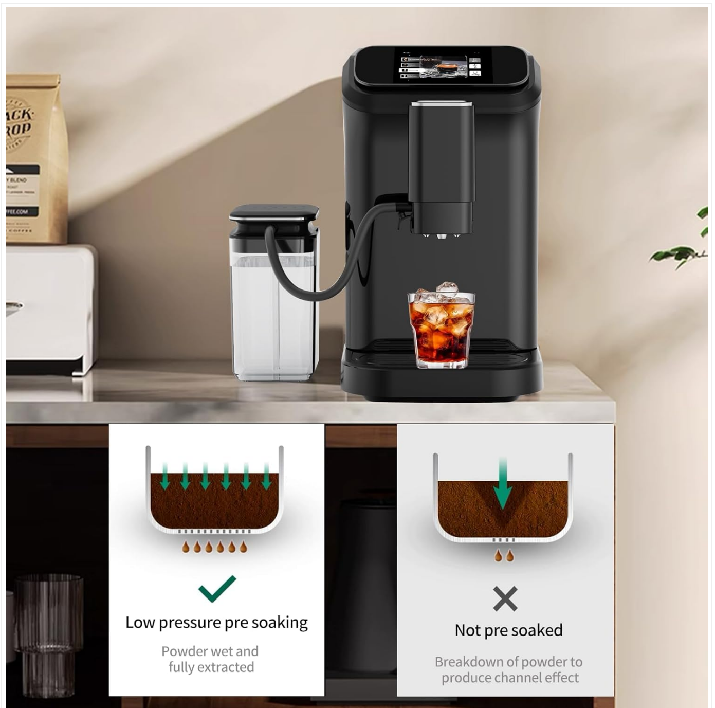
Figure 5.3: The low-pressure pre-soaking function ensures coffee powder is fully wetted and extracted, preventing channeling and improving flavor.