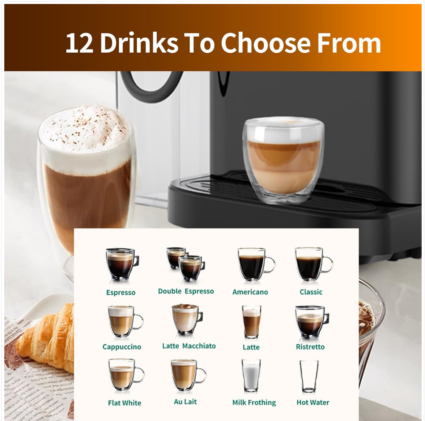
Figure 5.1: The touch screen interface displays 12 distinct coffee and hot water options for easy selection.

The WS-D5 offers 12 types of drinks. Use the touch screen to select your desired beverage.