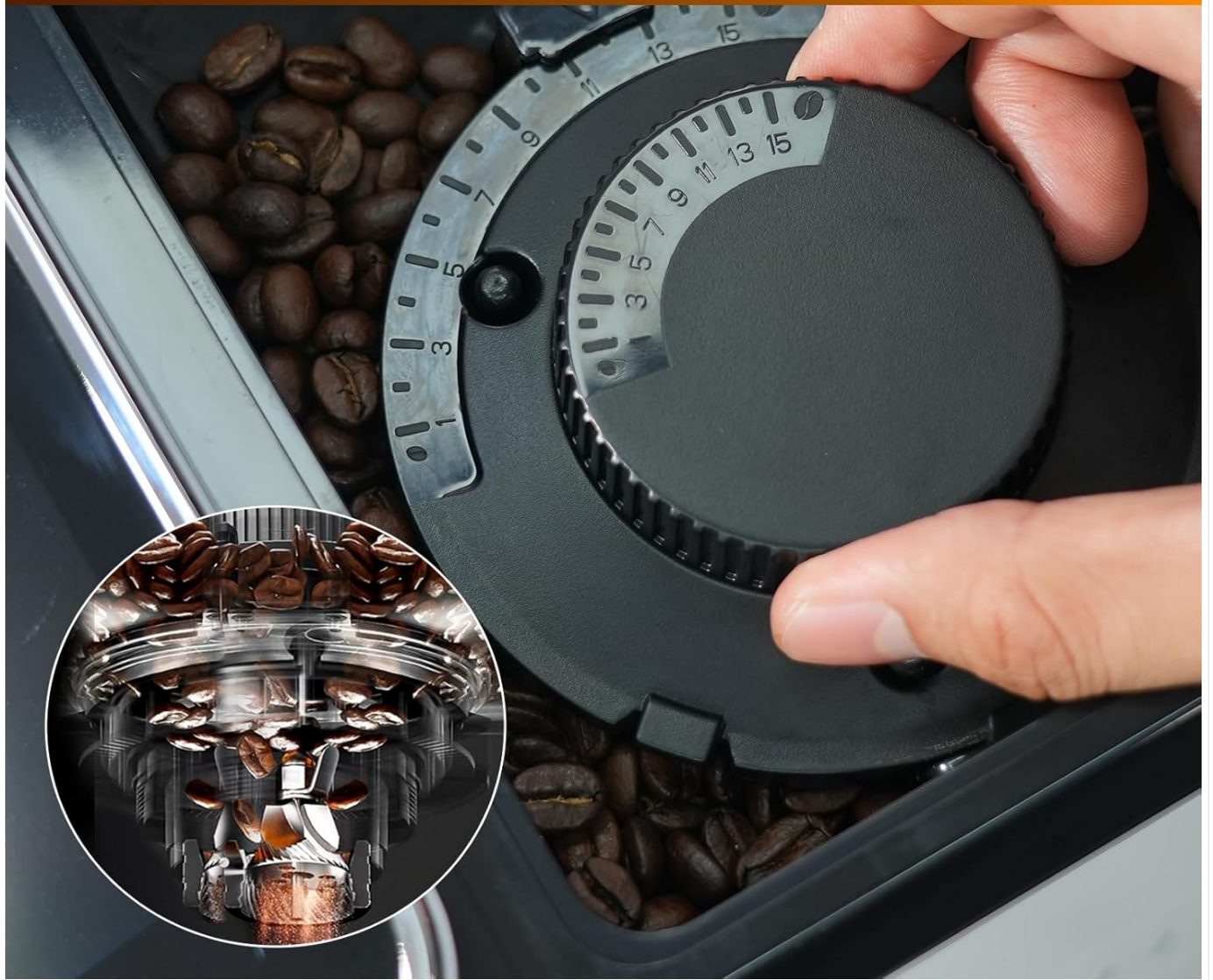
Figure 5.2: The machine features a 15-gear grinding adjustment for precise control over coffee fineness, ensuring perfect extraction. The cutter head is removable for cleaning.