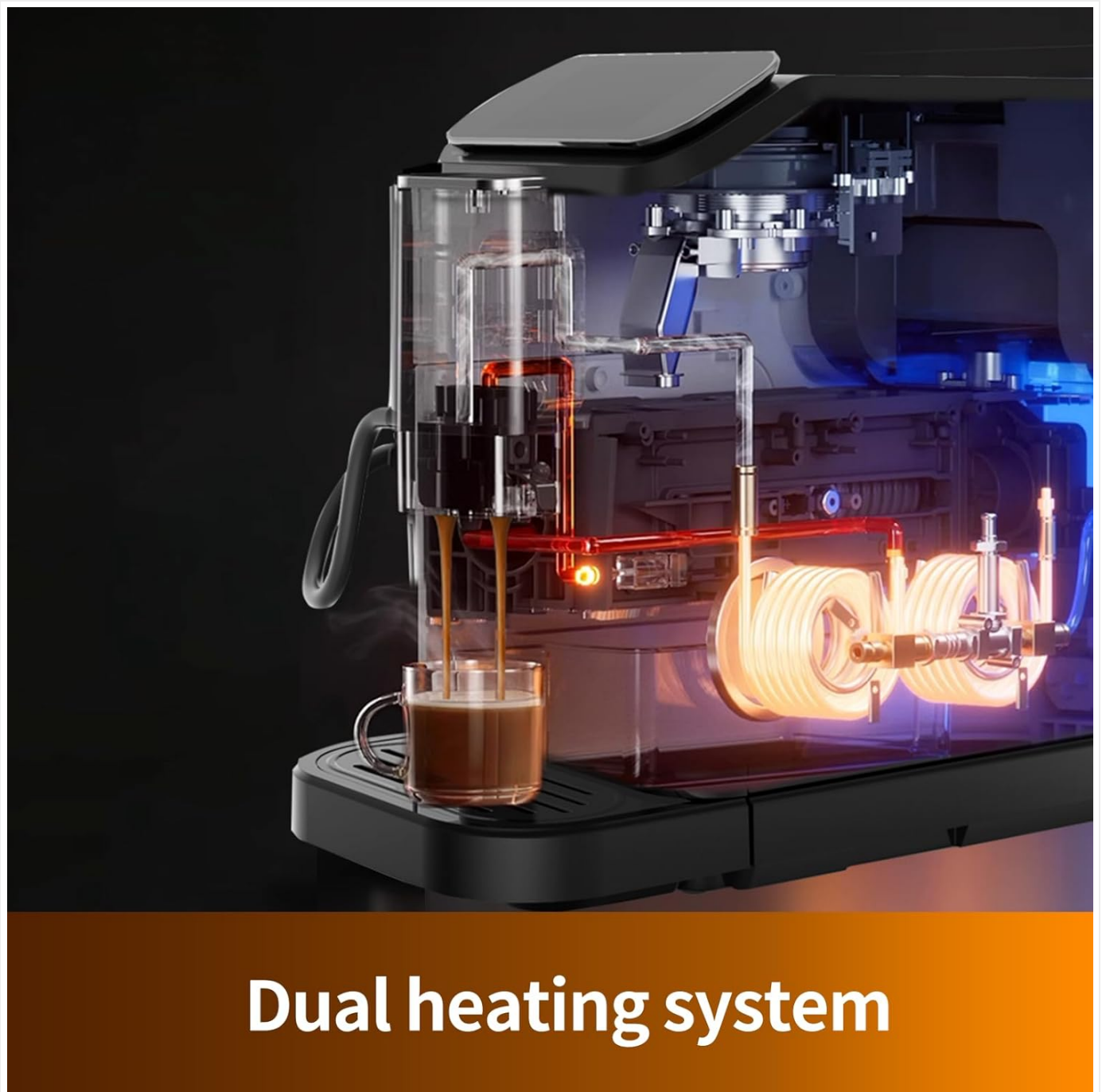
Figure 8.2: The machine incorporates a dual heating system for efficient and precise temperature management during brewing.