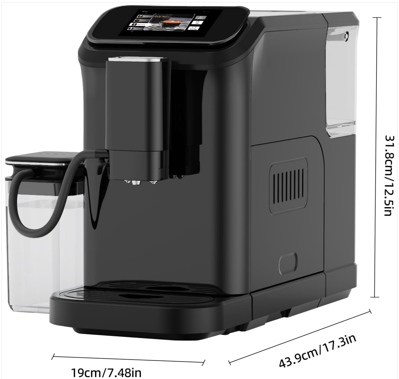
Figure 8.1: Dimensions of the Mclilpoo WS-D5 coffee machine.