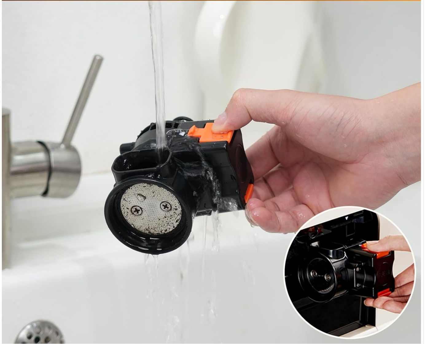
Figure 6.2: The brewing unit is small, easy to disassemble, and can be rinsed under running water for simple and effective cleaning.