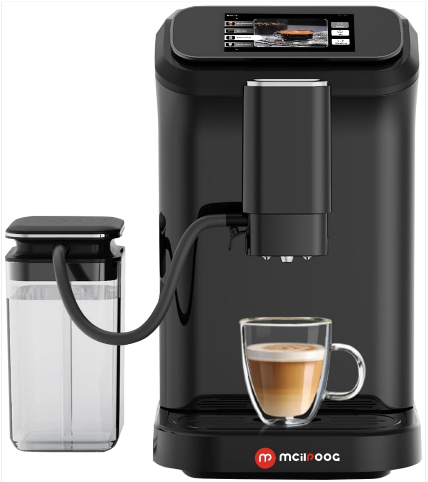
Figure 3.1: Front view of the McilpooG WS-D5 coffee machine, showing the main unit, external milk frother container, and a prepared coffee drink.