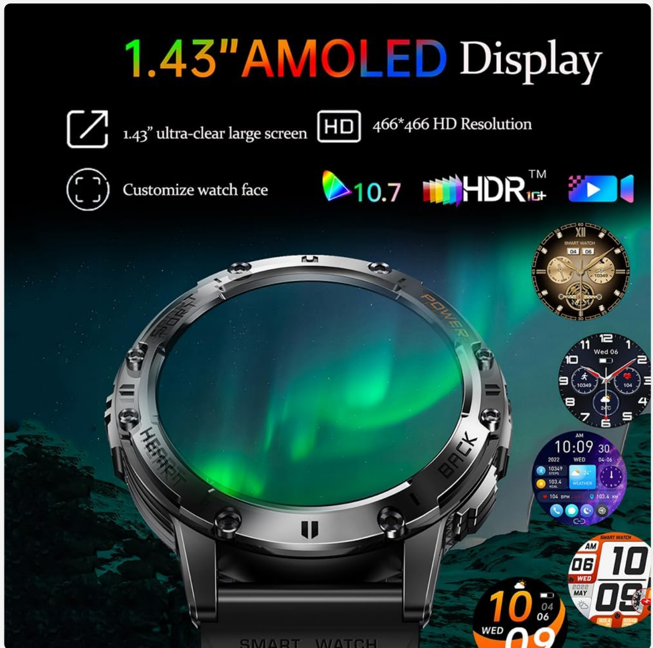
Figure 3: 1.43" AMOLED Display Features.

The smart watch features a 1.43" AMOLED HD display. Swipe across the screen to access different functions and menus. Use the physical buttons on the side for power, back, and quick access to features like the flashlight.