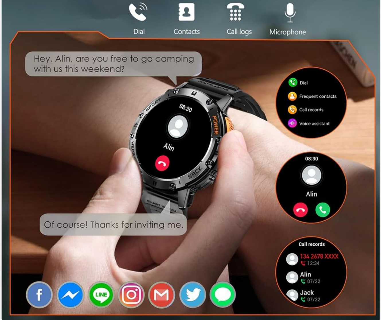
Figure 4: Bluetooth Call and Smart Notification Features.