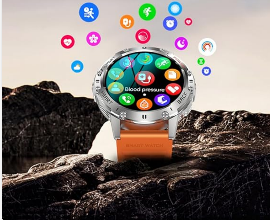
Figure 8: IP68 Waterproof and Additional Features.

Sedentary Reminder, Alarm Clock, Stopwatch, Timer, Incoming Call Notification, Message Reminder, Multi-language Push, Remote Photo .... Wear a wonderful smart life on your wrist