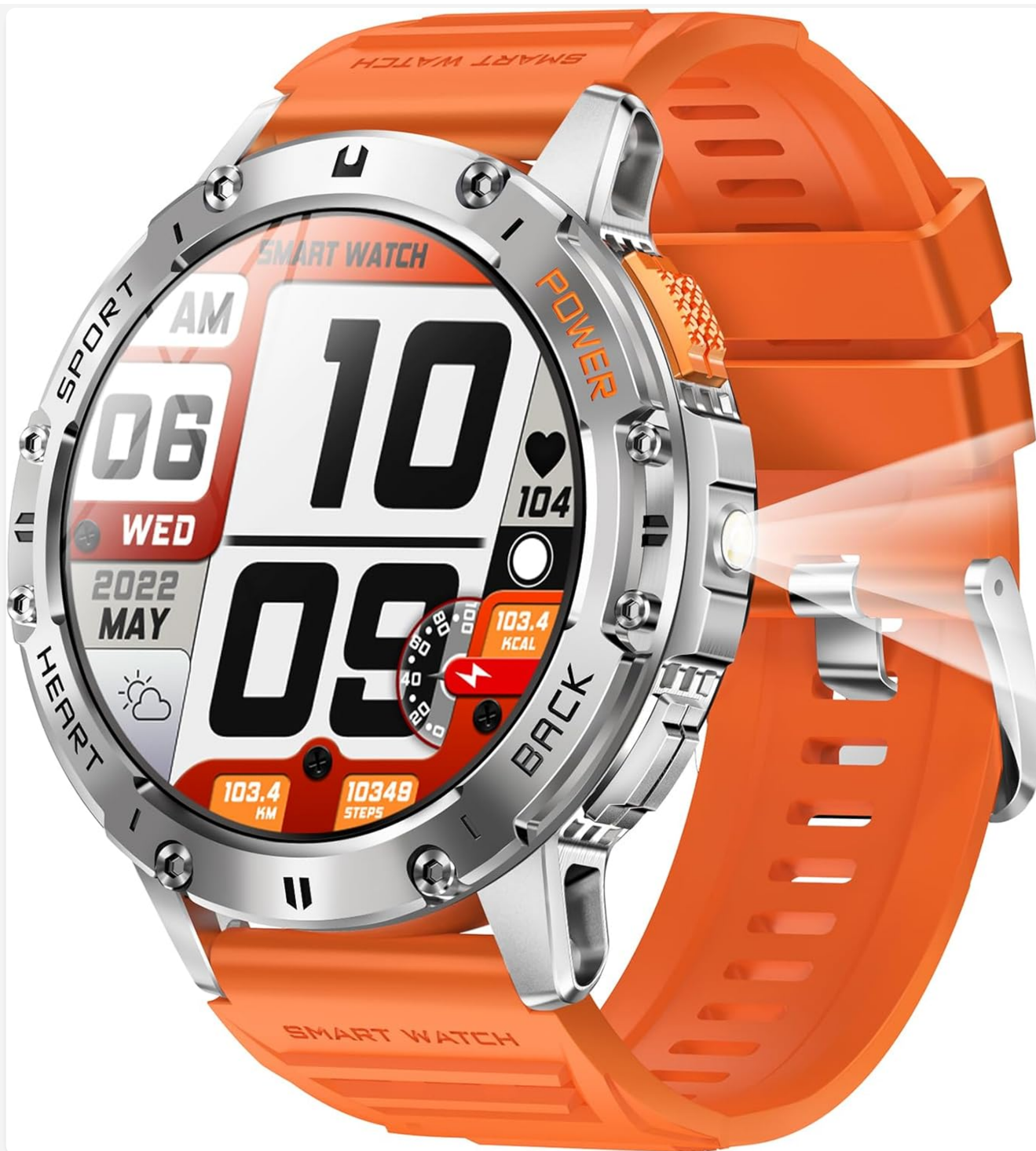
Figure 1: SEDSEY Smart Watch (Orange Silver variant) with active display and flashlight feature.