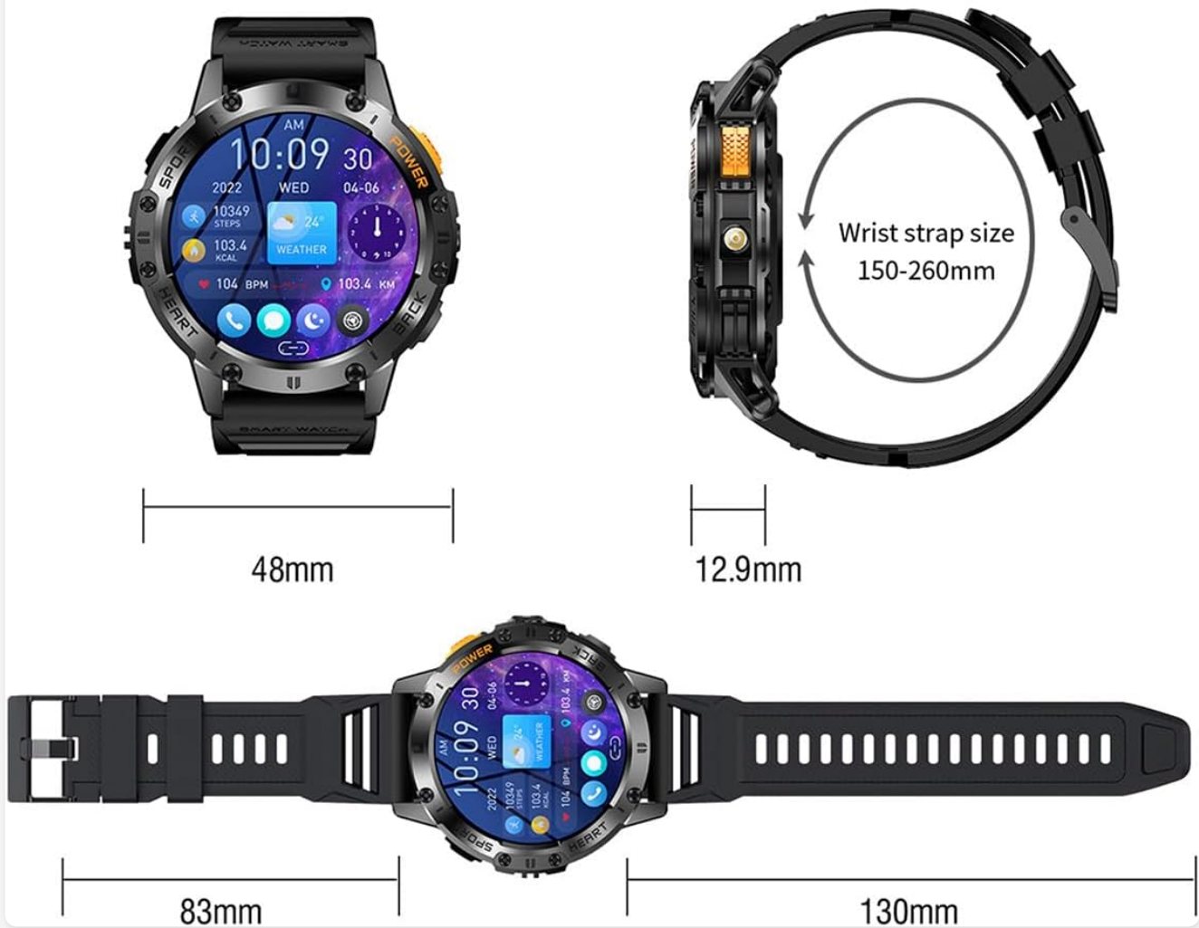
Figure 9: Product Dimensions.