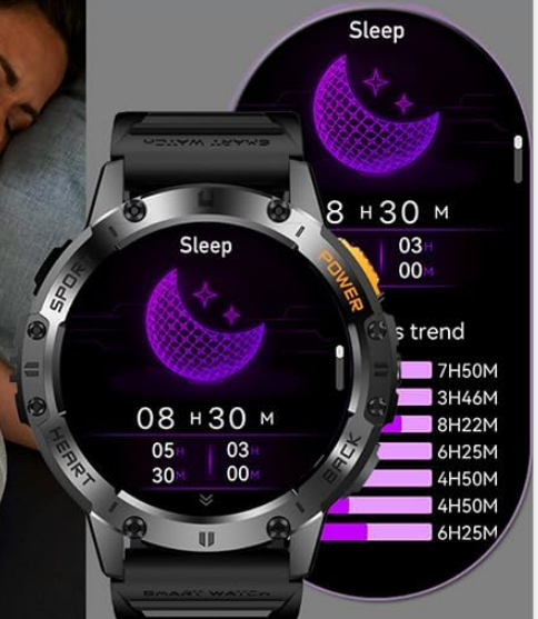
Figure 5: Health Monitoring Features.