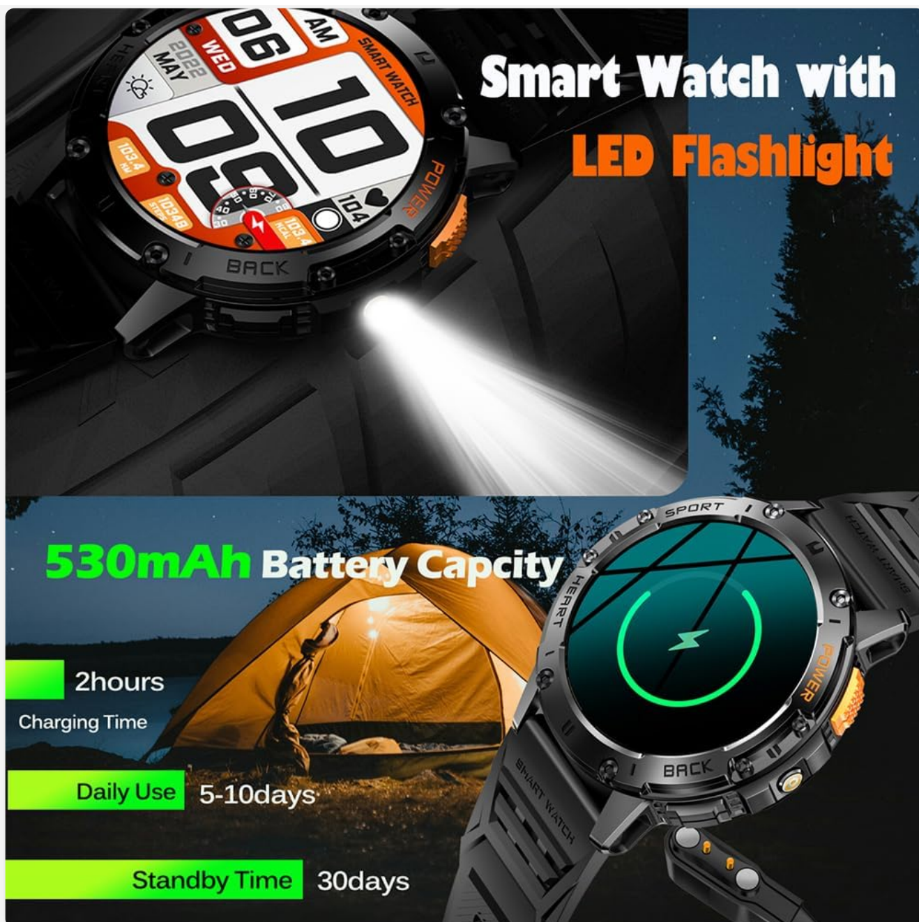
Figure 2: Smart Watch with LED Flashlight and Battery Information.