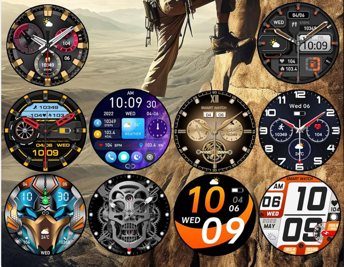
Figure 7: Customizable Watch Faces.

A large number of personalized dials to cater to diversified aesthetics, you can pick and choose, match with your heart, show your own personalized trend.