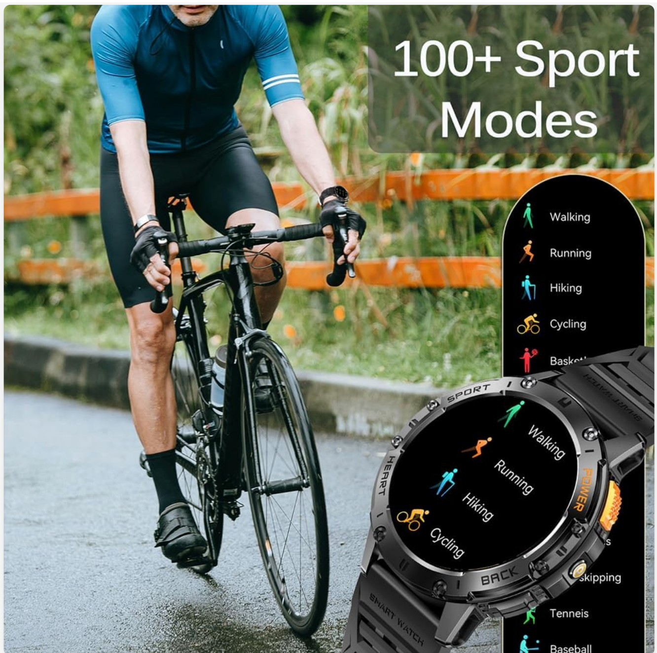
Figure 6: 100+ Sports Modes.