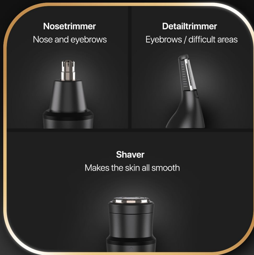
Image: The three interchangeable attachments: nose trimmer, detail trimmer, and shaver head.