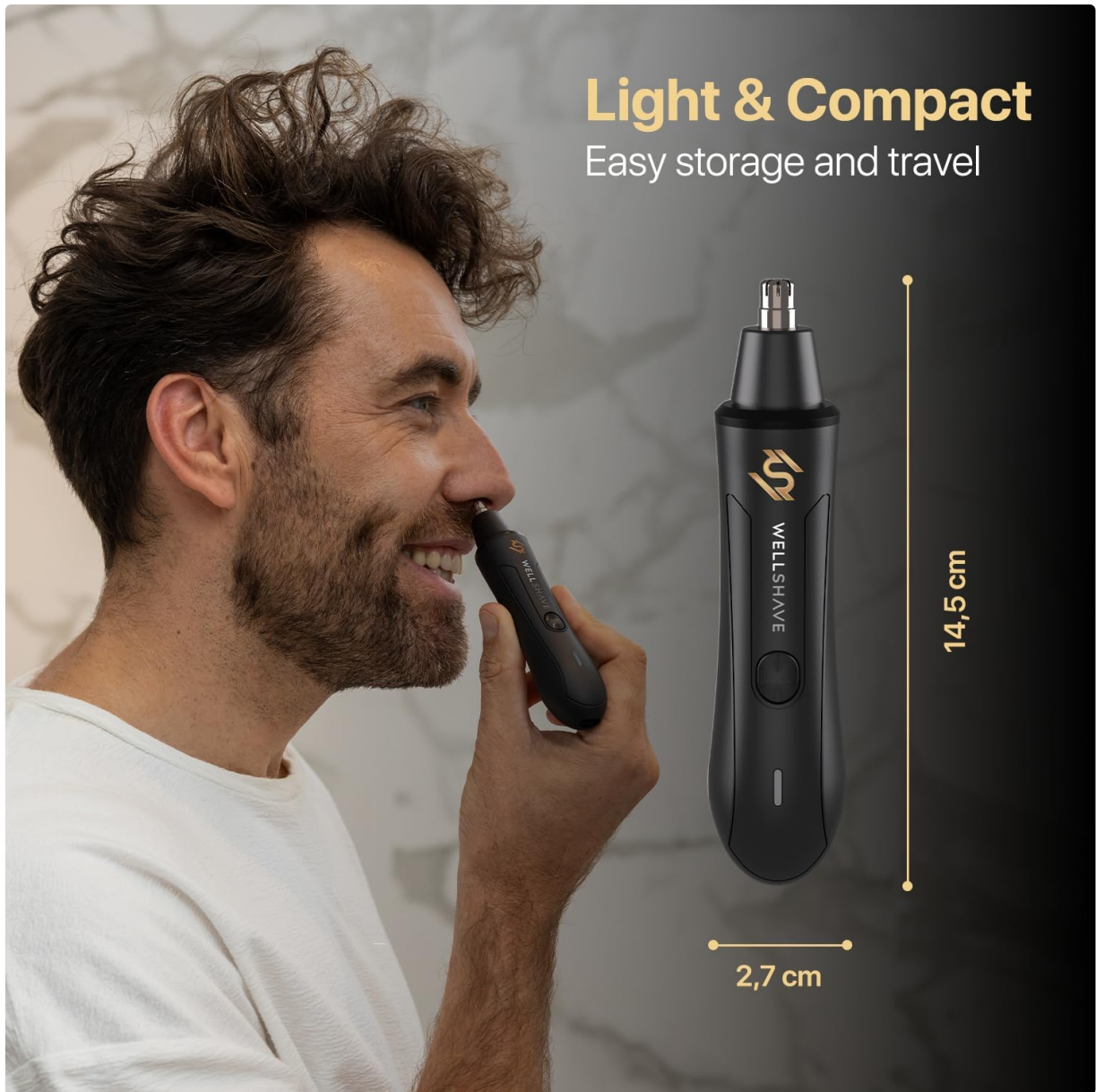
Image: Demonstrates the light and compact design of the Wellshave Advance 3-in-1 Trimmer, highlighting its dimensions.