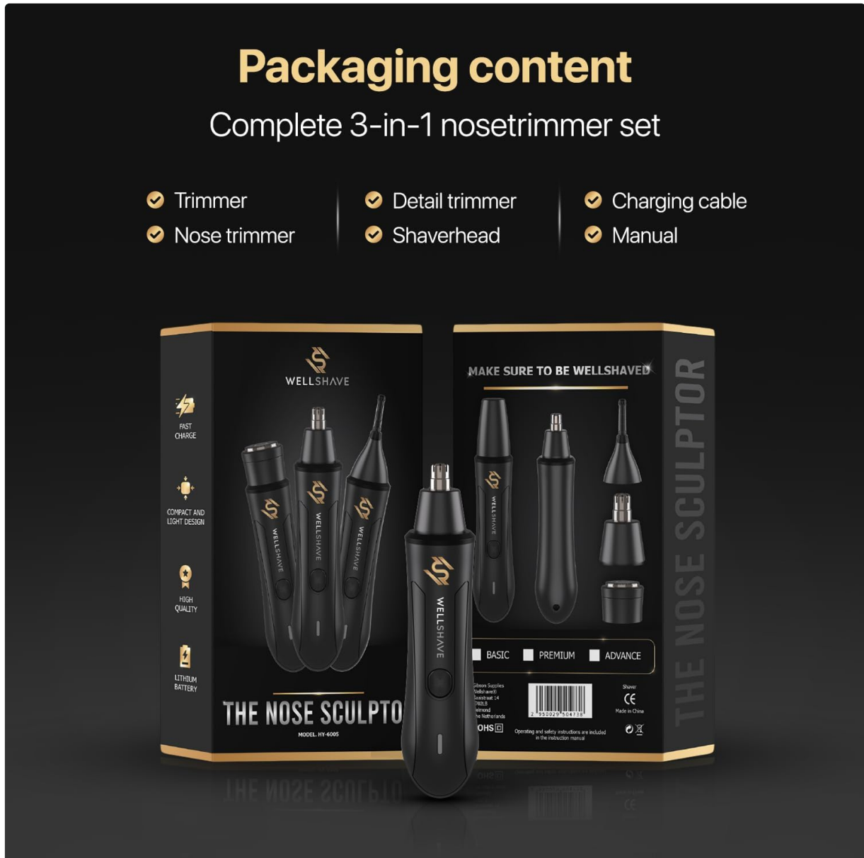
Image: All components included in the Wellshave Advance 3-in-1 Trimmer package.