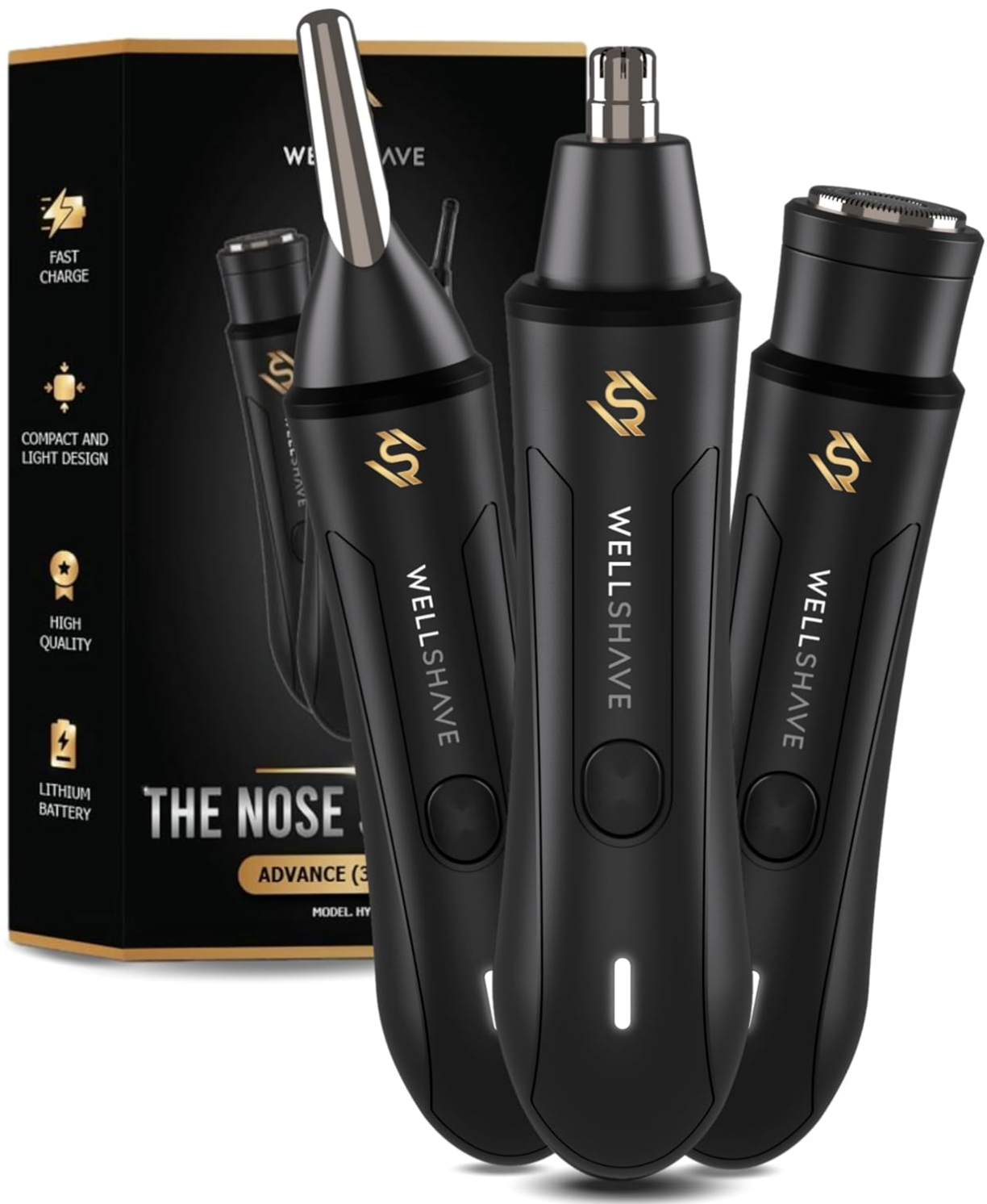
Image: The Wellshave Advance 3-in-1 Nose, Ear, and Eyebrow Trimmer with its packaging.