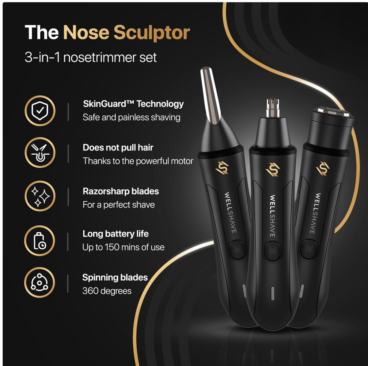
Image: Overview of the Wellshave Advance 3-in-1 Trimmer's key features, including SkinGuard Technology and long battery life.