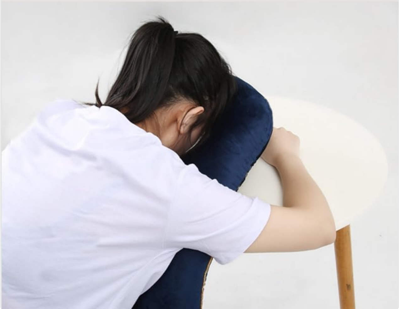
Image: The pillow's adjustable height feature is shown, highlighting its adaptability for use in various prone positions, such as on a table.