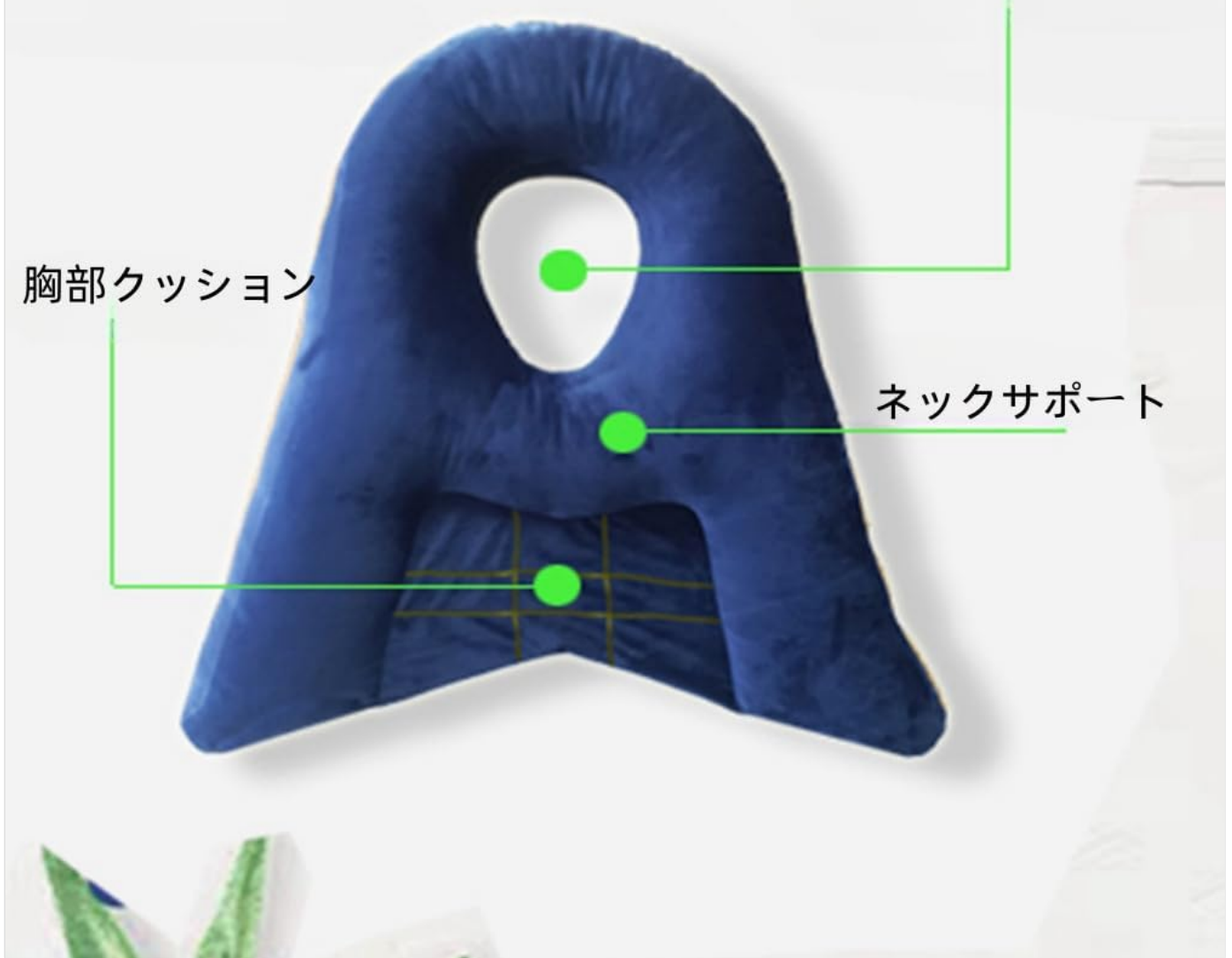
Image: A detailed diagram illustrating the pillow's key features, including the chest cushion and neck support, designed to fit the face shape and avoid eyeball compression.