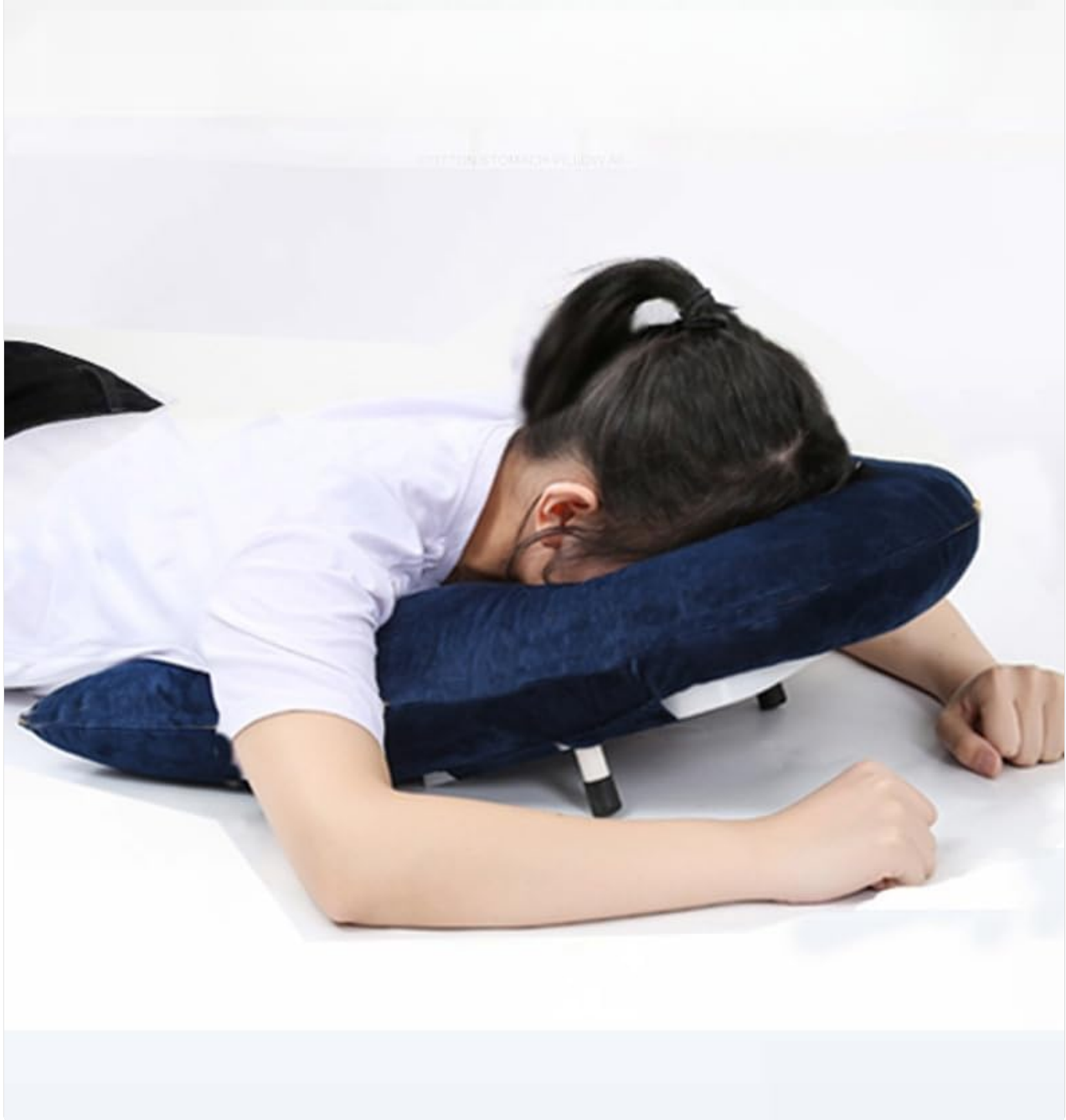
Image: This image demonstrates the hollow and breathable design of the pillow, which ensures smooth breathing even when lying face down.

中空の通気性のあるデザインにより、 うつ伏せで寝ているときでも呼吸がスムーズになります。