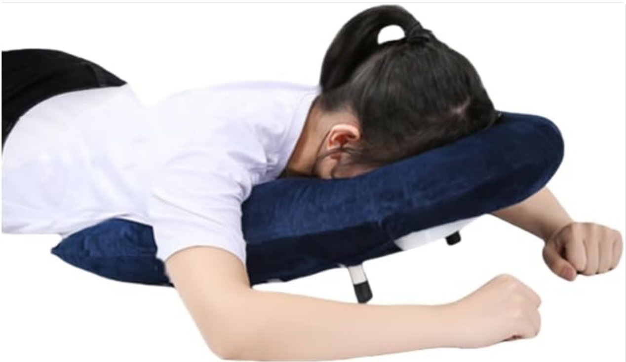
Image: A person comfortably positioned face down on the KCNN Ophthalmic Prone Pillow, illustrating its primary use for maintaining a prone posture.

The KCNN Ophthalmic Prone Pillow is specifically designed to provide comfort and support for individuals who need to maintain a face-down position, such as those recovering from retinal vitreous surgery or requiring prone therapy. Its ergonomic design ensures proper alignment of the head, neck, and shoulders, promoting relaxation and aiding recovery.