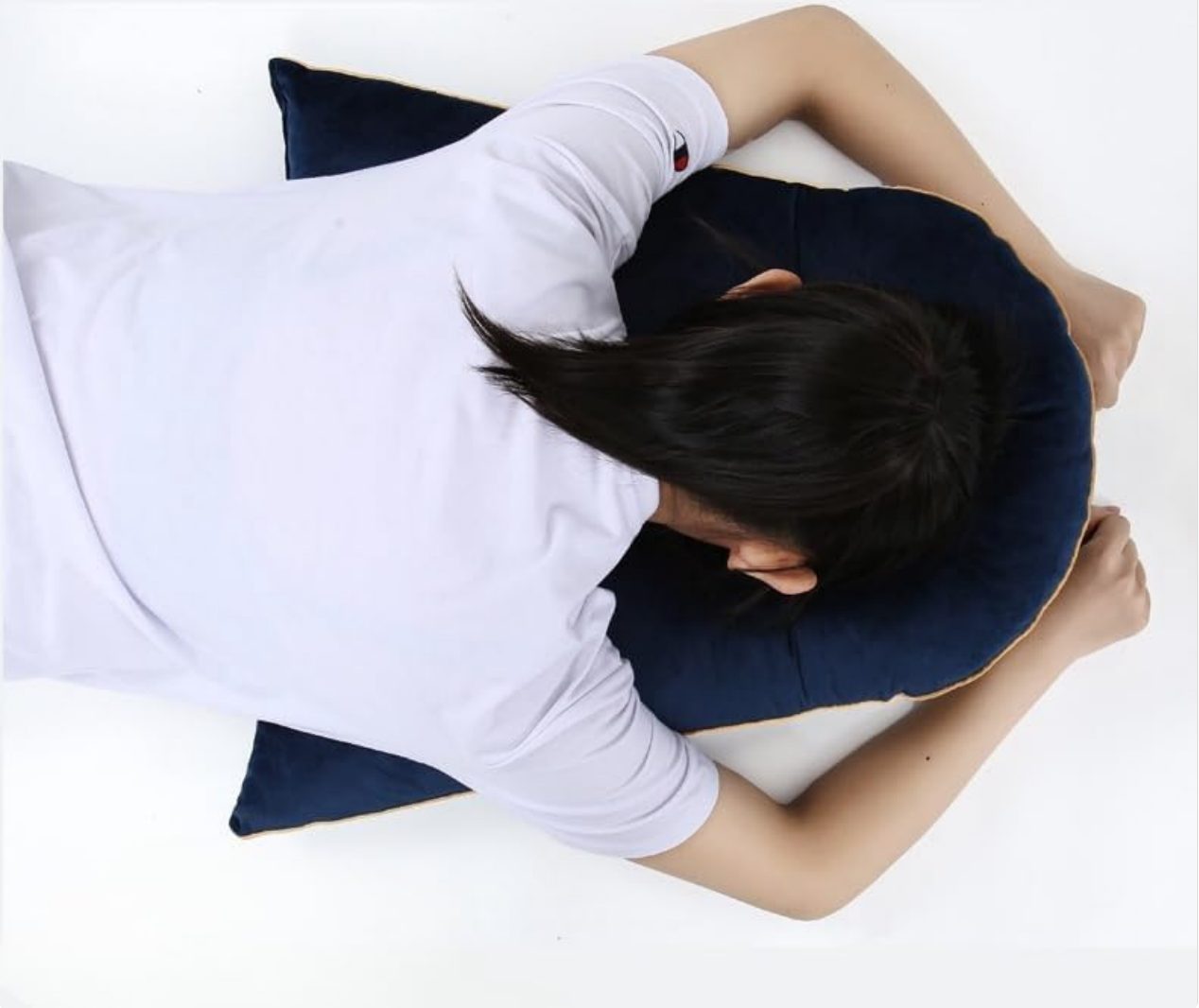
Image: An overhead view showing how the pillow naturally conforms to the head, neck, and shoulders, emphasizing comfort and relaxation.