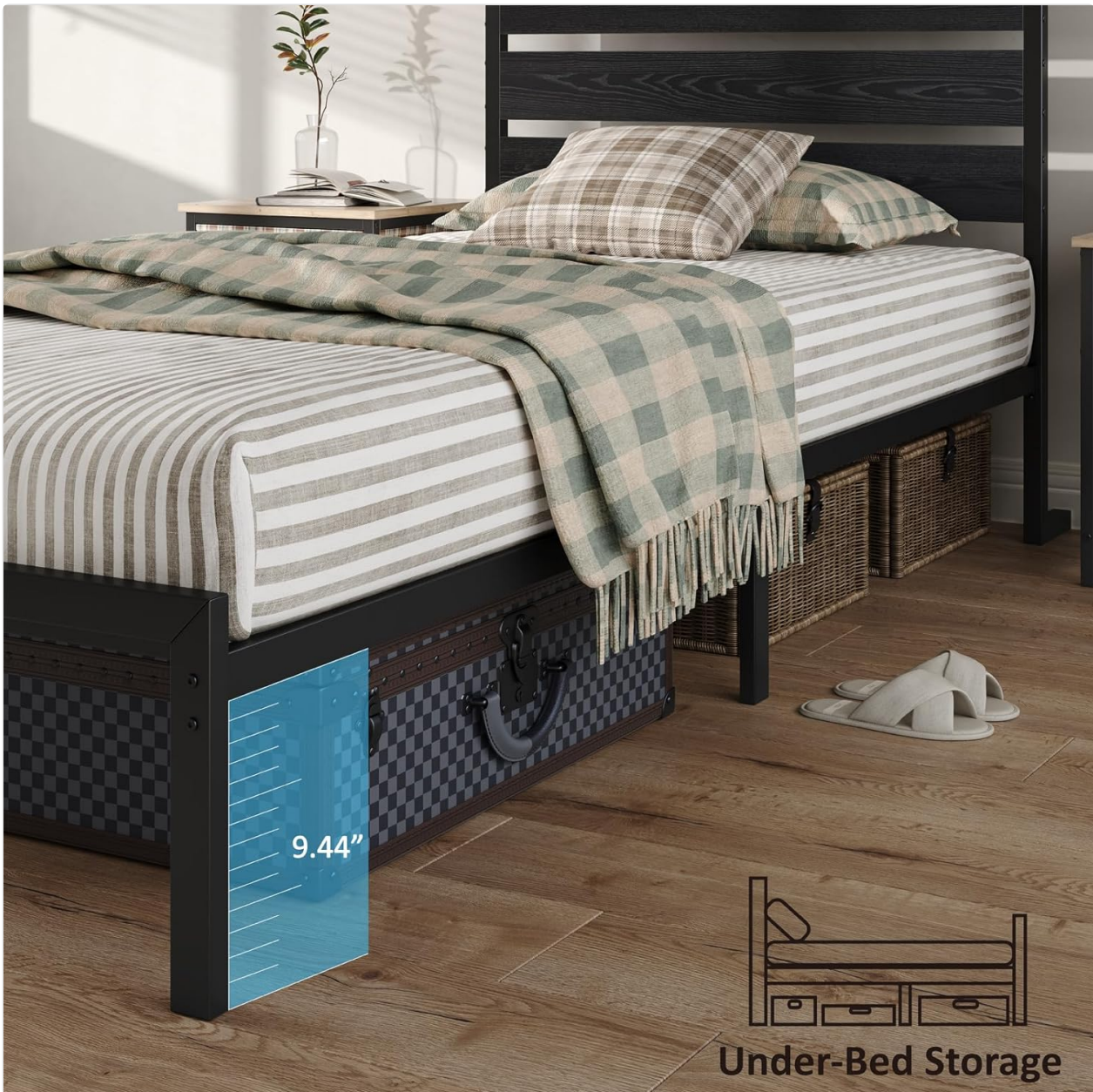
Figure 5: Illustration of the under-bed storage area, highlighting the 9.44-inch clearance suitable for various storage containers.