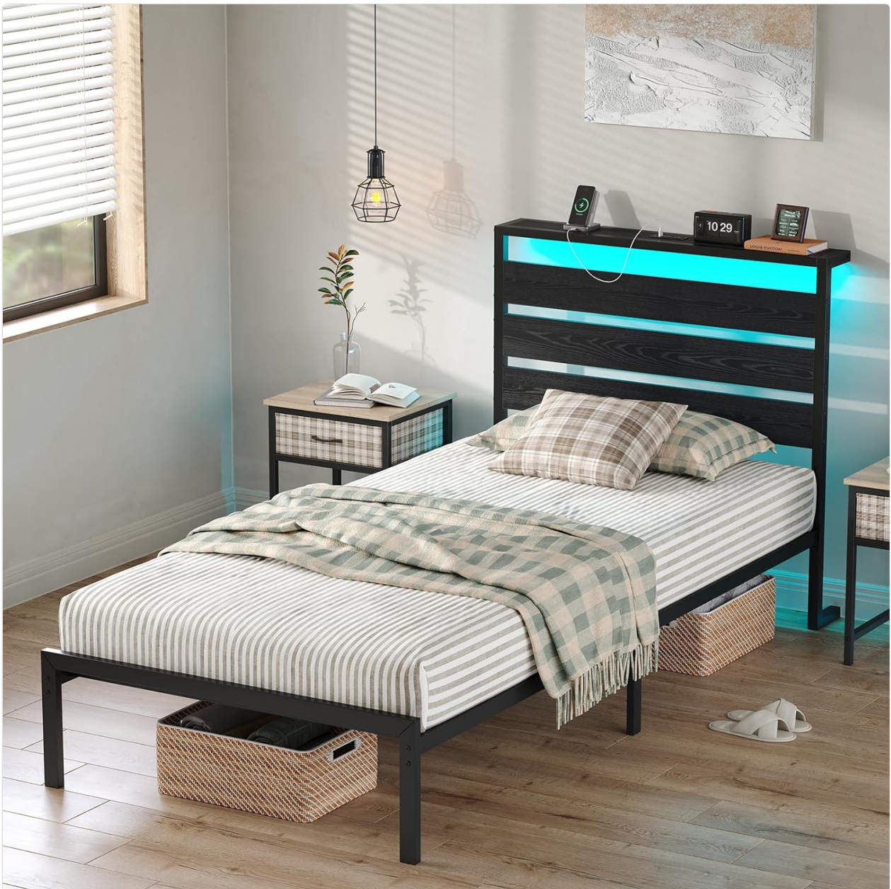
Figure 2: An assembled CollaredEagle Twin Bed Frame, showcasing the headboard with integrated LED lighting and charging station. The bed is shown with a mattress and bedding, and baskets for under-bed storage.