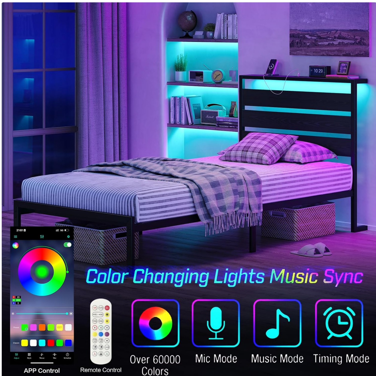
Figure 4: The LED lighting system in operation, demonstrating various color options and control methods including a mobile application and remote control. Features like music sync and timing are highlighted.