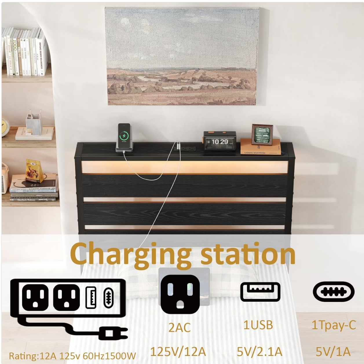
Figure 3: Detail of the headboard's charging station, illustrating the two AC outlets, one USB-A port, and one USB Type-C port for convenient device charging.