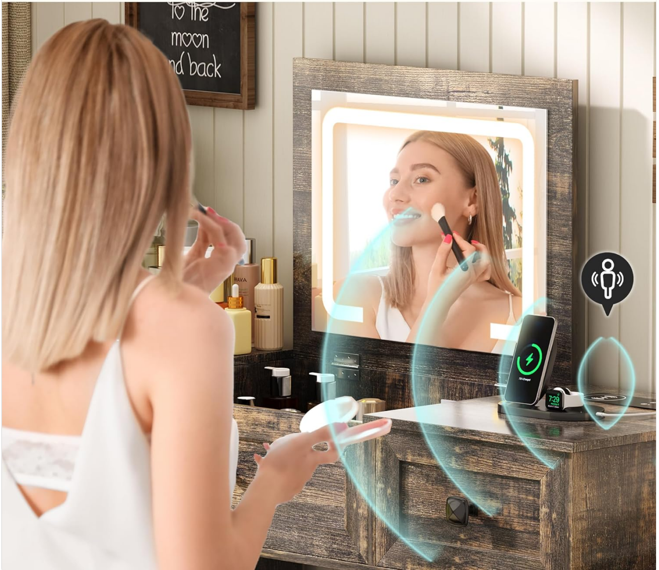
Image: The Gurexl vanity desk with its flip-top mirror open, revealing the LED lighting and organized storage compartments for cosmetics and accessories.