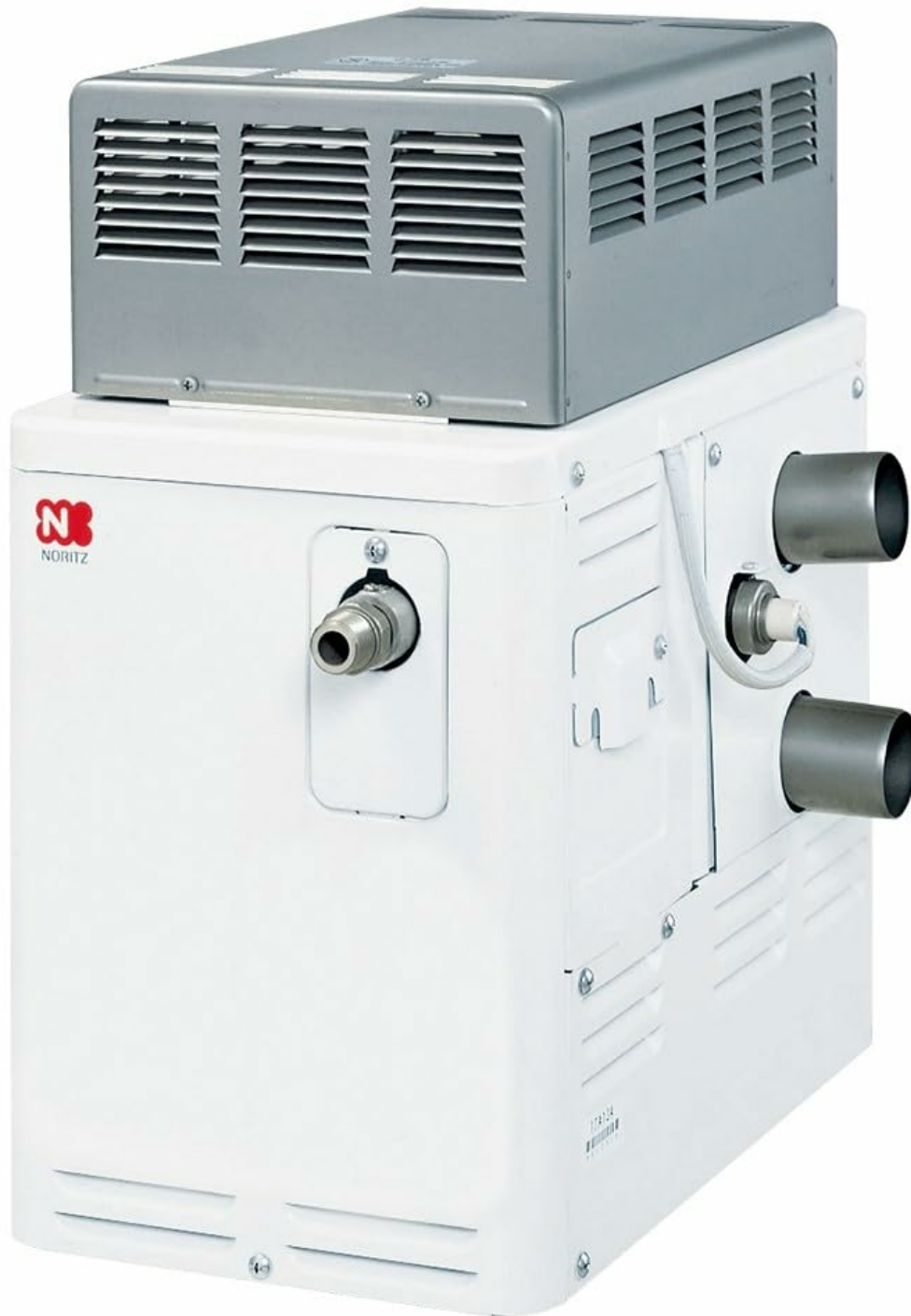
Front view of the Noritz GSY-132D gas water heater, designed for outdoor installation and compatible with city gas.