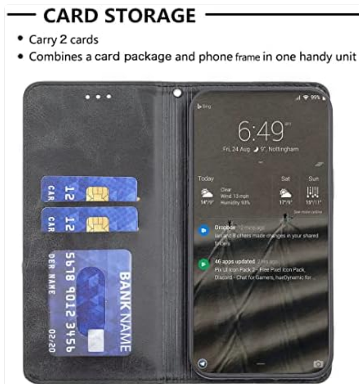
Figure 5: Detailed view of the card storage area within the phone case, capable of holding multiple cards.