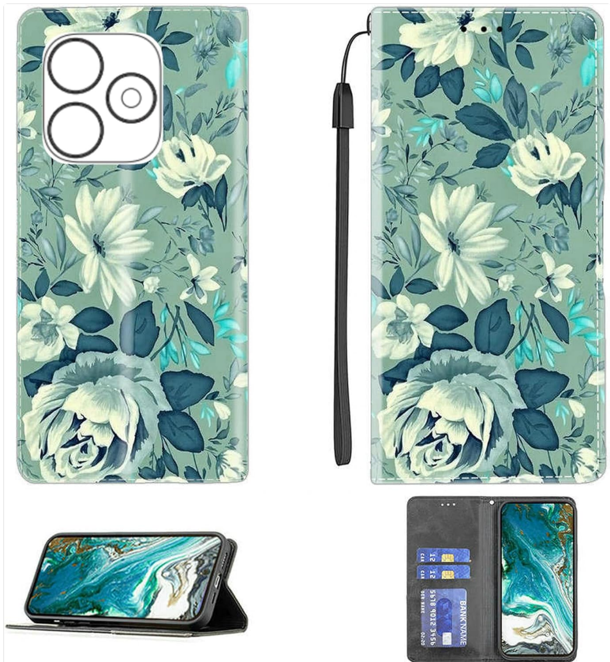
Figure 1: Overview of the Tecno Bg6m phone case, illustrating its design and functionality, including the ability to stand horizontally.