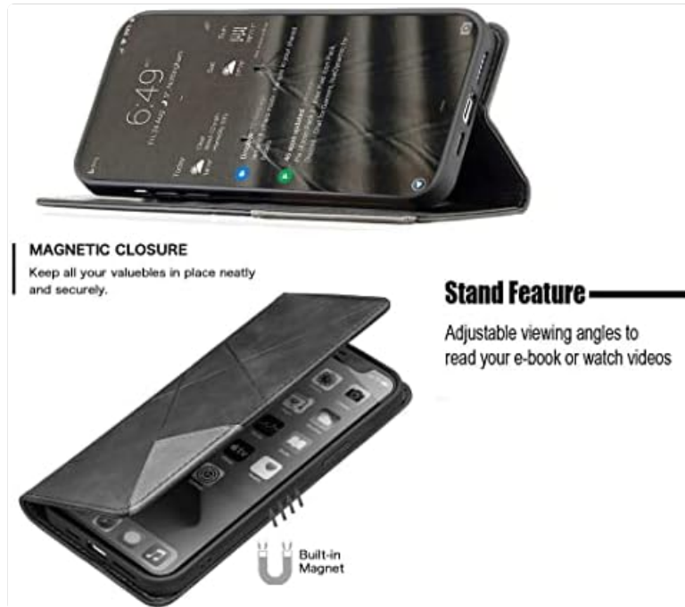
Figure 4: Illustration of the kickstand feature and the magnetic closure mechanism of the phone case.

The case is designed with a built-in kickstand feature. To use, simply fold the back cover of the case to create a triangular support. This allows your phone to stand horizontally, providing a convenient viewing angle for watching videos or making video calls.