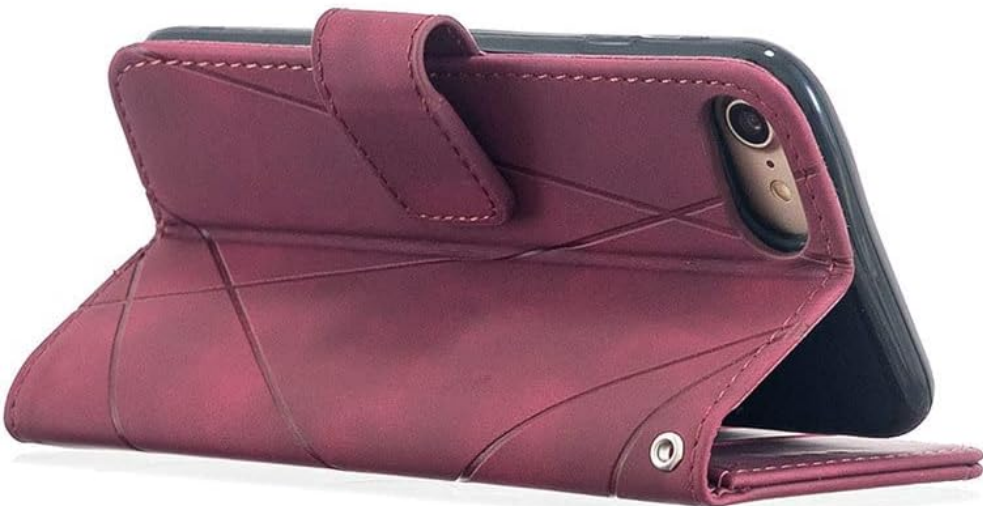
Image: A phone case with its back cover folded to form a kickstand, supporting the phone in landscape mode for viewing. Text overlay indicates "Stand Feature - Adjustable viewing angles to read your e-book or watch videos."

Adjustable viewing angles to read your e-book or watch videos