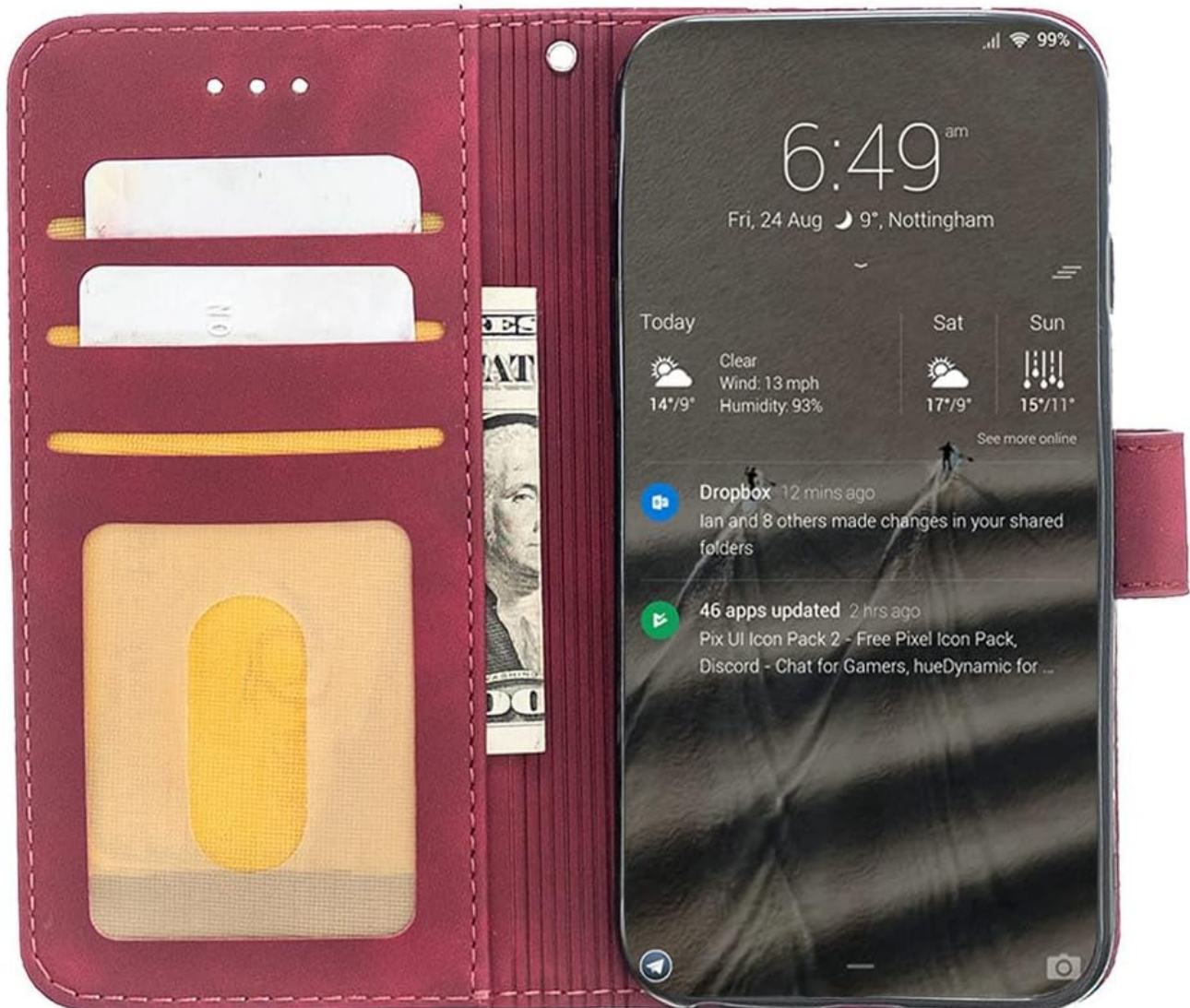
Image: An open phone case revealing multiple card slots and a larger pocket for cash. Text overlay indicates "CARD STORAGE - Carry 3 cards and cash - Combines a wallet and phone case in one handy unit."