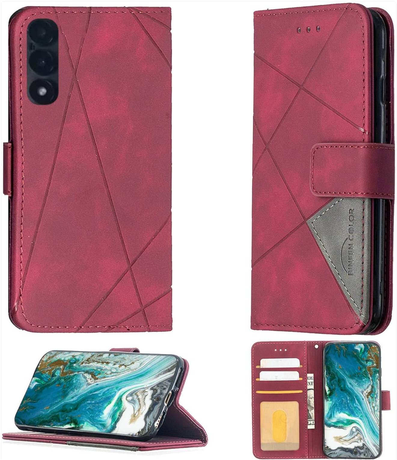
Image: Contents of the product package, showing the red phone case and the included tempered glass screen protector.