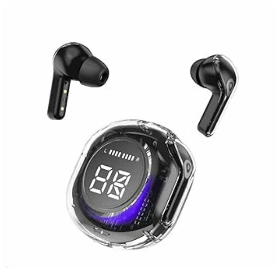
Image: Ultrapods Pro Wireless Earphones with their transparent charging case, showing the earbuds inside.