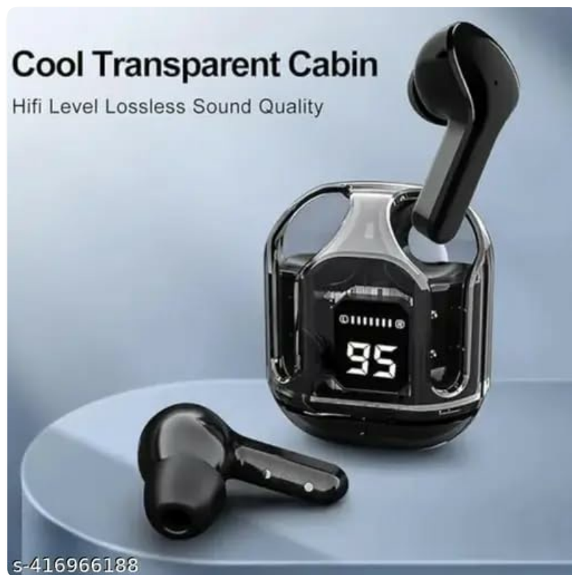
Image: Close-up view of the Ultrapods Pro transparent charging case with one earbud inserted and another lying beside it, highlighting the digital battery display.