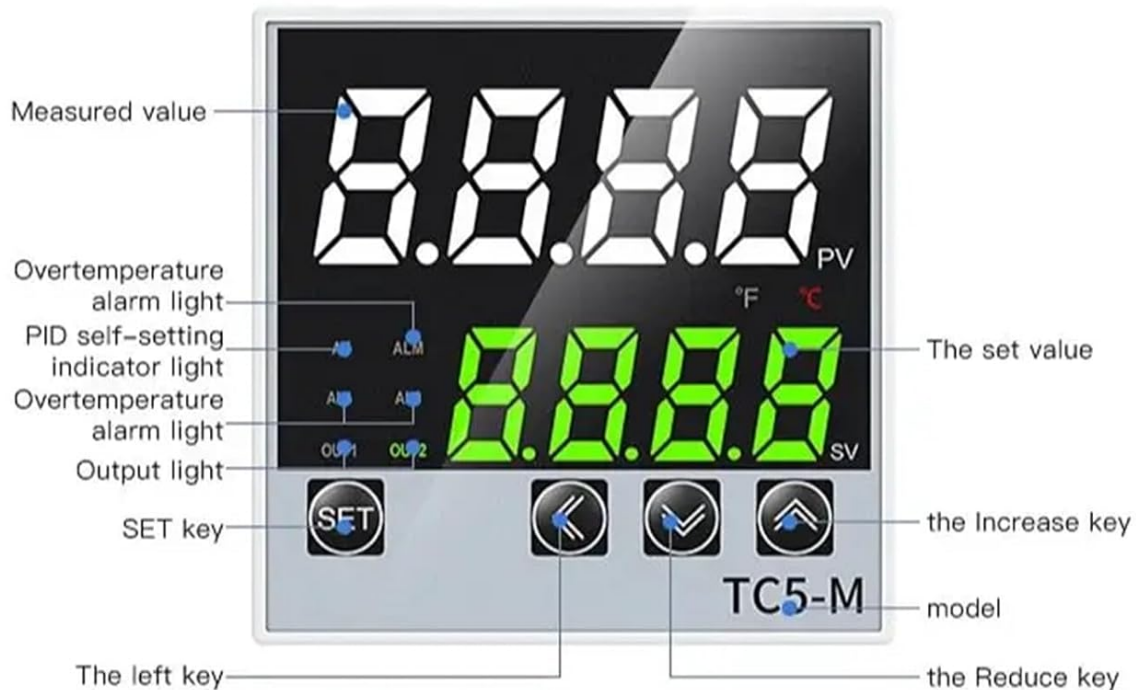
Figure 6: Front panel layout and button functions, illustrating the measured value (PV), set value (SV), and control buttons (SET, Left, Increase, Reduce).