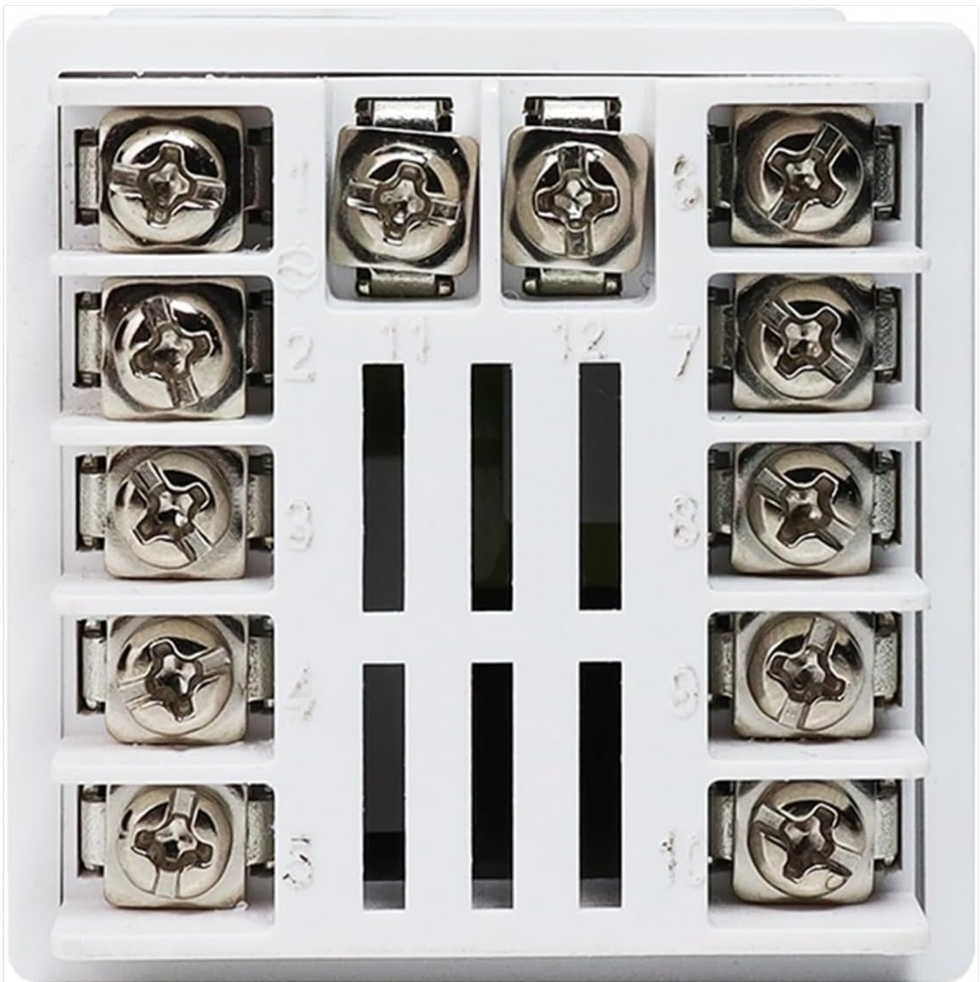
Figure 5: Close-up view of the screw terminal block on the rear of the TC5-L controller, showing numbered terminals for wiring connections.