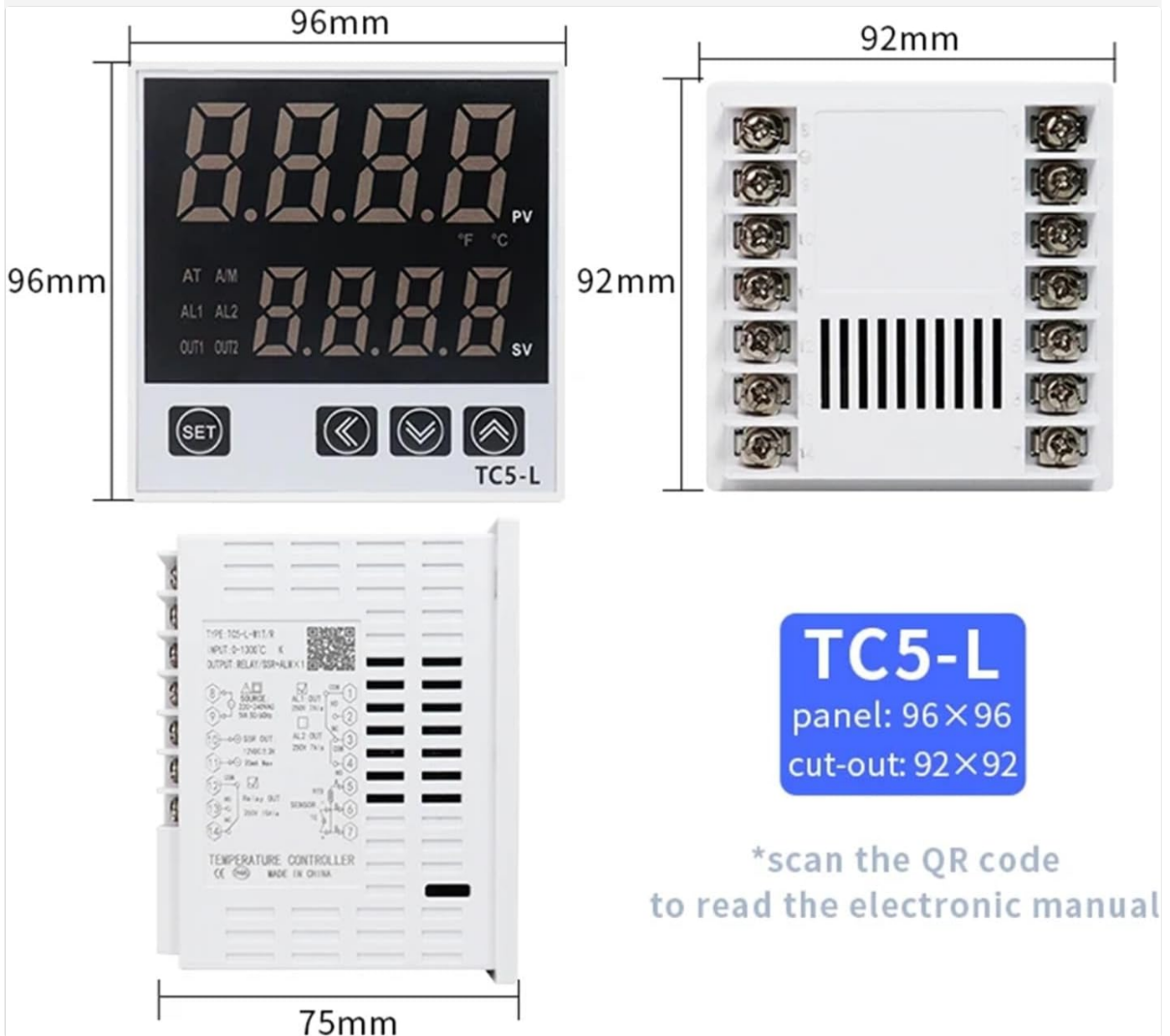
Figure 4: Detailed wiring diagram for the TC5-L controller, showing connections for power (220-240VAC), sensor inputs (RTD/TC), and output terminals (Relay, SSR, Alarm).

Refer to the wiring diagram below for connecting power, sensor, and output devices. Incorrect wiring can damage the unit or connected equipment.