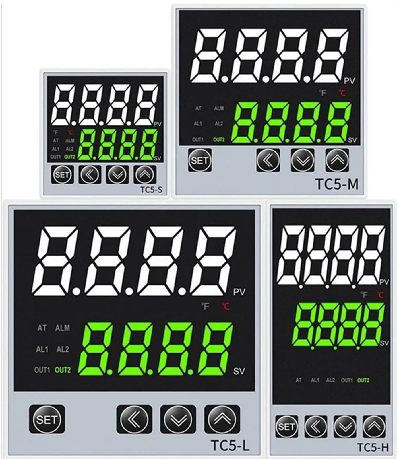
Figure 1: Front view of the TC5-L Temperature Controller, showing the display, control buttons, and overall dimensions of 96mm x 96mm for the panel and 92mm x 92mm for the cut-out.