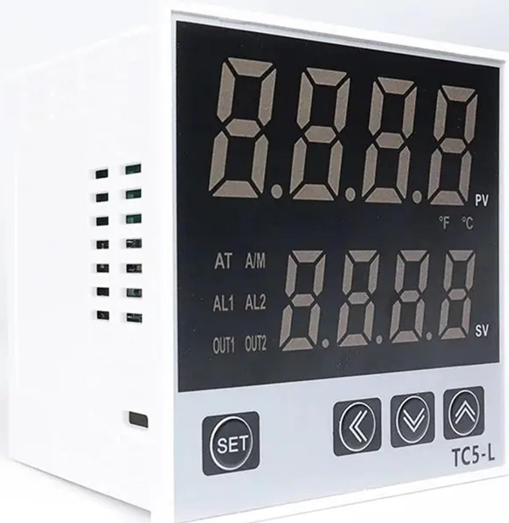
Figure 2: The TC5-L controller highlighting its intelligent PID control capabilities for accurate and stable temperature management.

CONTROL ACCURATE AND STABLE REAL-TIME MONITORING, A WIDE RANGE OF ARBITRARY TEMPERATURE SETTINGS