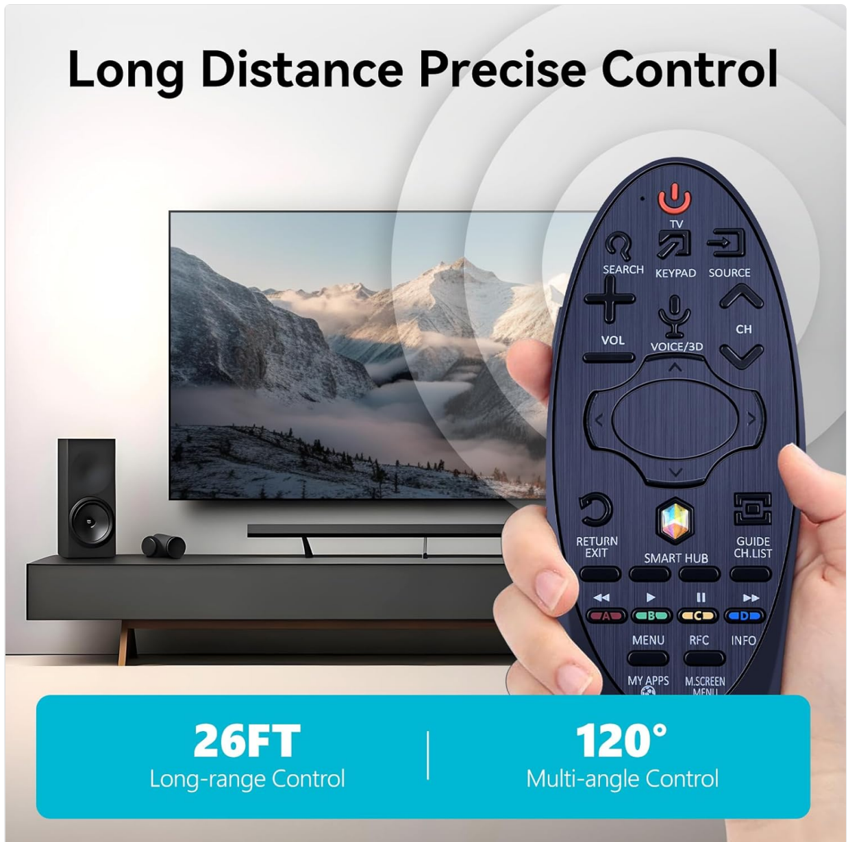
Figure 4.1: The remote control offers long-range and multi-angle precise control for seamless operation.