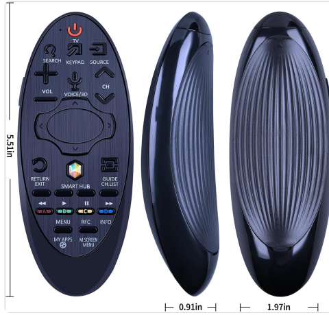
Figure 2.2: Dimensions of the remote control, illustrating its length (5.51 inches), width (1.97 inches), and thickness (0.91 inches).