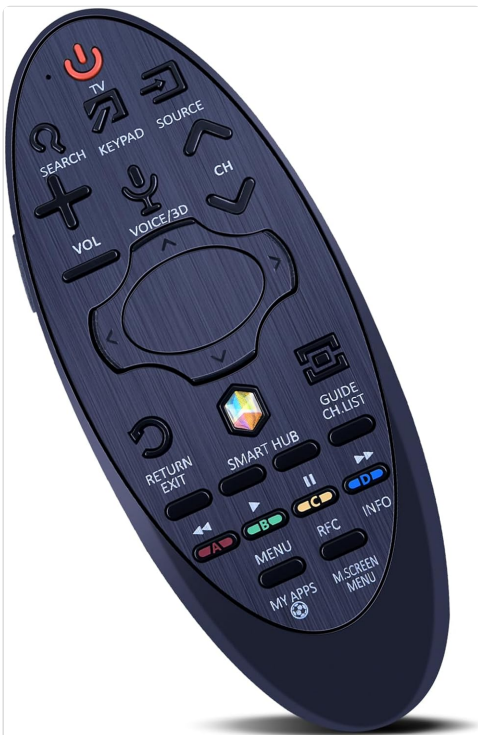
Figure 2.1: Front view of the ZWP BN59-01181B Replacement Remote Control, showing