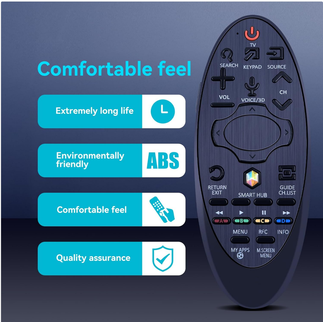
Figure 5.1: The remote is designed with a comfortable feel and made from environmentally friendly ABS material for durability.