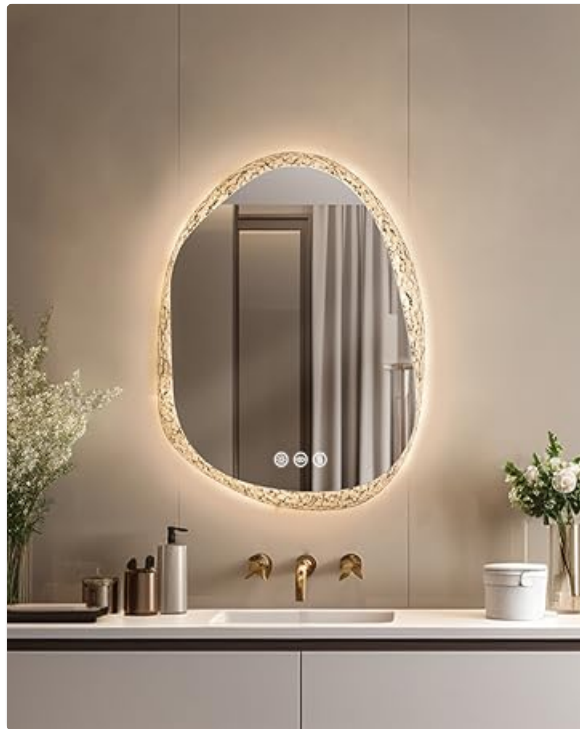
Image: Visual representation of the smart touch sensor for brightness control and cycling through three lighting colors.