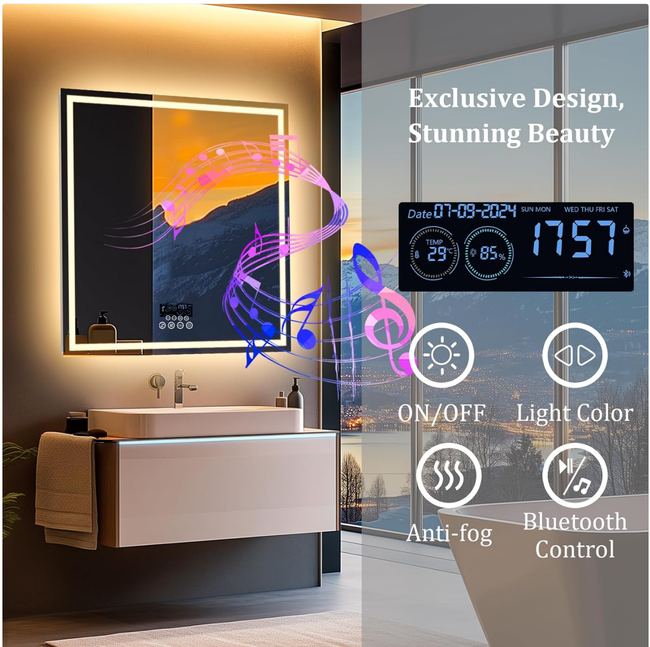
Image: Close-up of the mirror's digital display and touch control icons for various functions.