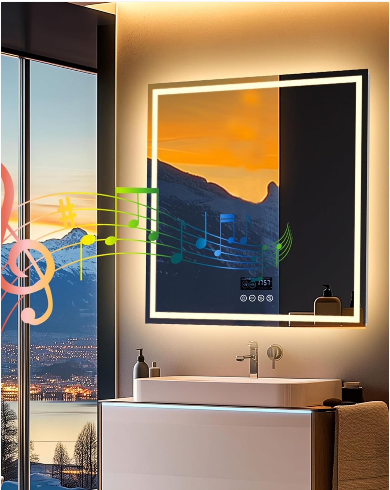
Image: The LUVODI Smart LED Bathroom Mirror, showcasing its illuminated design.