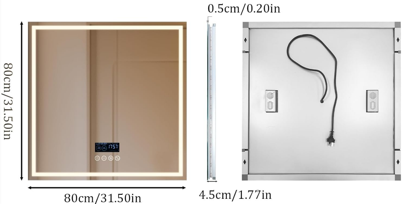
Image: Detailed dimensions of the mirror (31.5 inches x 31.5 inches) and a view of the back panel showing the electrical connection.