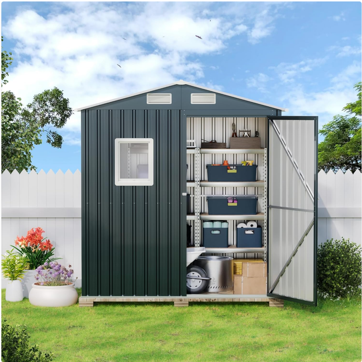
Image: The Mistmo 6X4FT shed with its doors open, showcasing internal shelving and stored items.