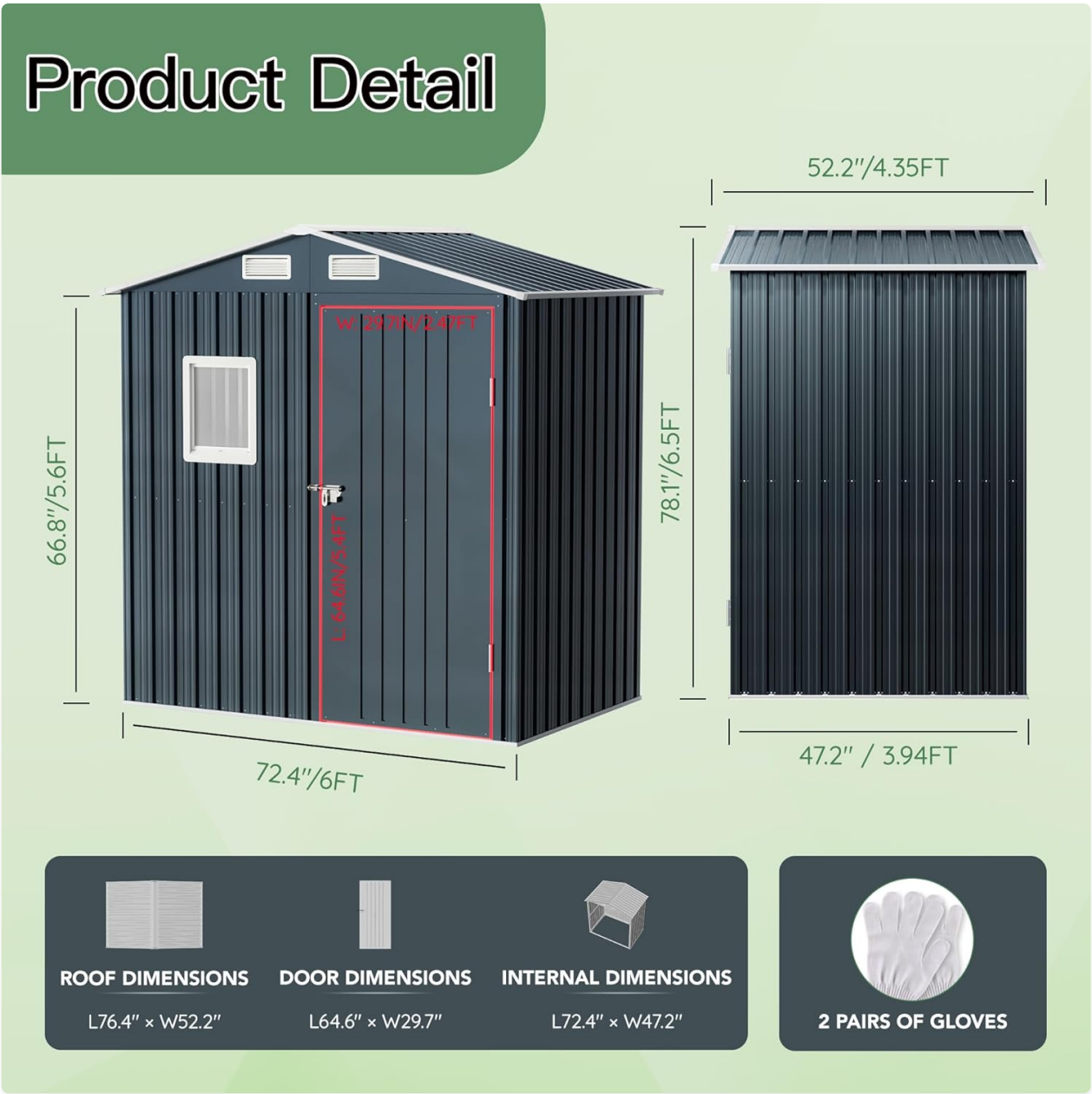
Image: A detailed diagram illustrating the dimensions of the shed components.