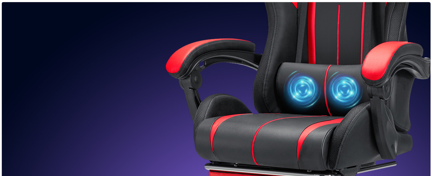
Image: A close-up view of the lumbar massage cushion, showing the two vibrating motors designed to relieve fatigue.

The lumbar cushion features a 2-point vibrating massage function. Ensure the USB power cable for the massage function is connected. The massage function is typically activated via an on/off switch located on its power cord.