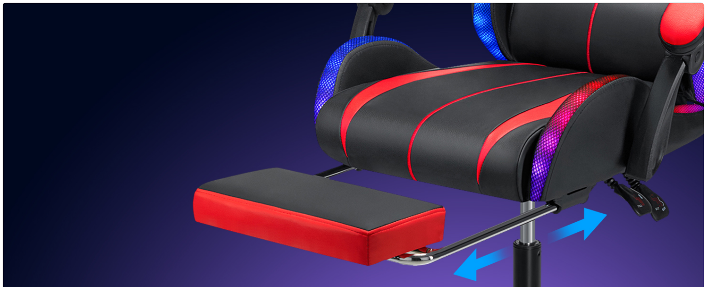
Image: A close-up view demonstrating the retractable footrest mechanism, showing arrows indicating extension and retraction.

To extend the footrest, pull it out from underneath the seat. To retract, push it back in until it is fully stored.