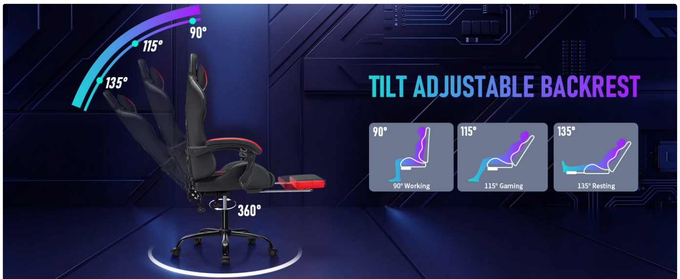
Image: Illustration of the chair's recline functionality, showing working (90°), gaming (115°), and resting (135°) positions.