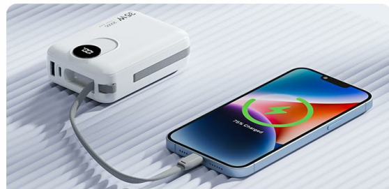
Dual-way fast charging