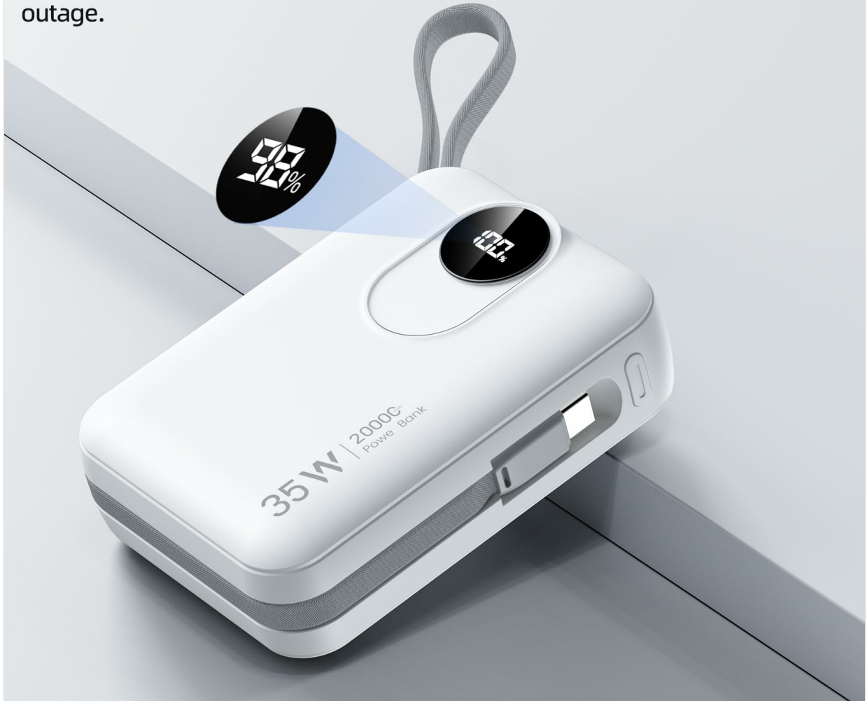
Image: A close-up view of the power bank's LED digital display, indicating the remaining battery level.

The large LED screen displays the battery level when charging the device or pressing the switch, avoiding an unprepared power outage.