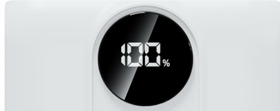
LED battery level display