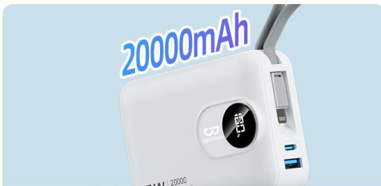
20000mAh large capacity