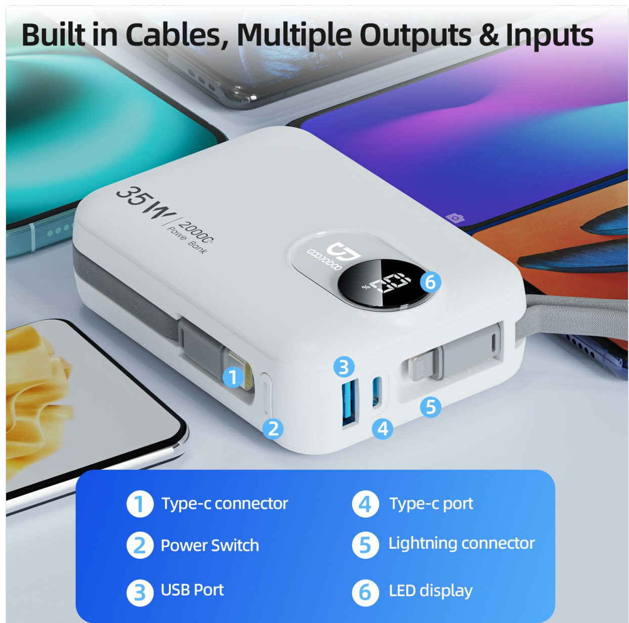
Image: Detailed view of the GOOJODOQ AD4017 Power Bank showing its built-in cables, USB port, Type-C port, power switch, and LED display.

Familiarize yourself with the various components of your power bank: