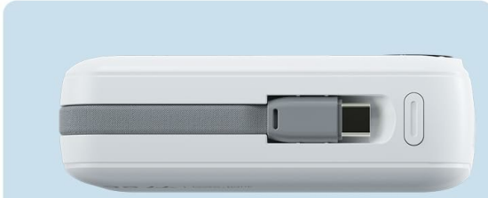
Self-contained hidden cable