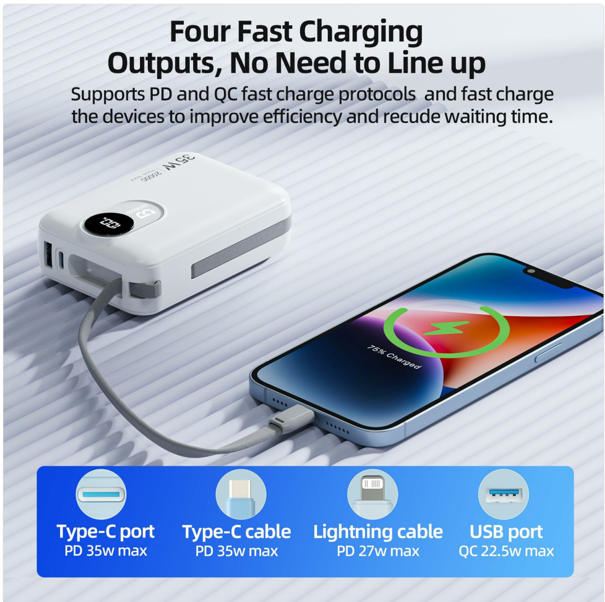
Image: A smartphone being charged by the power bank using the built-in Type-C cable, demonstrating one of the four fast charging outputs.