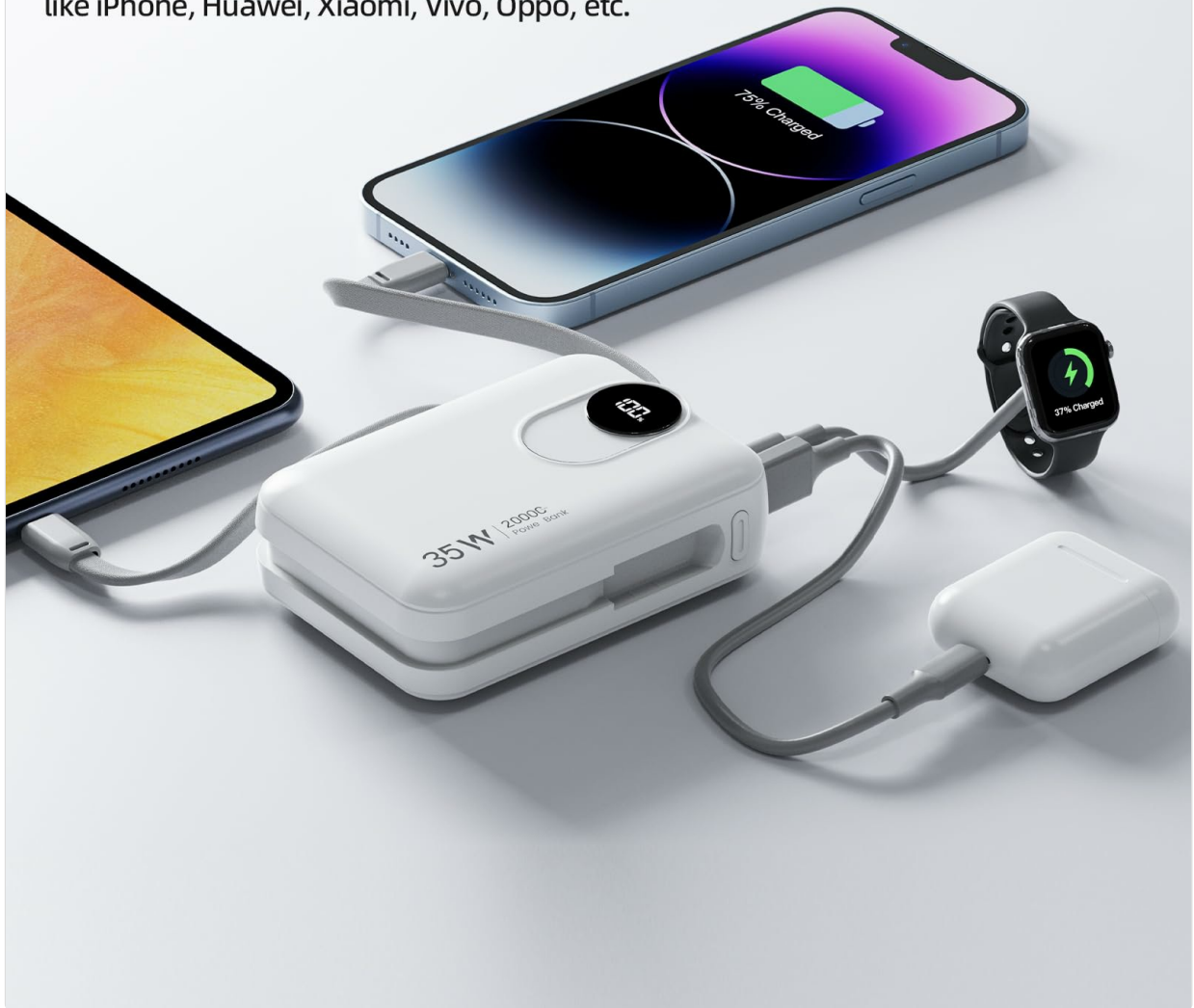
Image: The power bank charging multiple devices including a smartphone, smartwatch, and earbuds, showcasing its ability to charge four devices simultaneously.

The two charging cables and two extra output ports allow 4 devices charge at the same time, widely compatible to most electronic equipment of various brand like iPhone, Huawei, Xiaomi, Vivo, Oppo, etc.