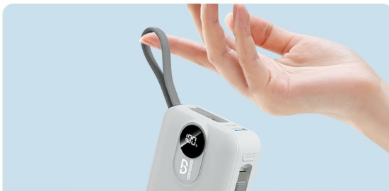
Versatile lanyard design