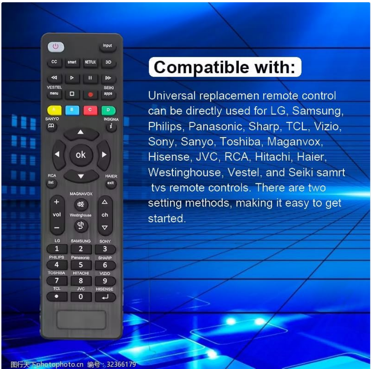
Figure 1.1: The remote control highlighting its wide compatibility with various TV brands. This image illustrates the range of televisions the remote can operate, including LG, Samsung, Philips, Panasonic, Sharp, TCL, Vizio, Sony, Sanyo, Toshiba, Maganvox, Hisense, JVC, RCA, Hitachi, Haier, Westinghouse, Vestel, and Seiki.