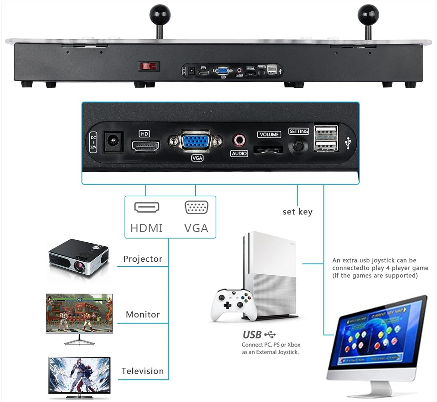
Image: Rear view of the FVBADE 78S console showing DC 12V, HDMI, VGA, Audio, Volume, Setting, and USB ports, with diagrams illustrating connections to a projector, monitor, TV, and PC/Xbox.