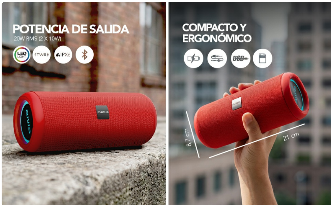
Image: Two Aiwa AW-KF4 speakers (red and black) illustrating key features: 20W output, LED lighting, TWS function, IPX6 water resistance, Bluetooth, USB, and SD card compatibility.