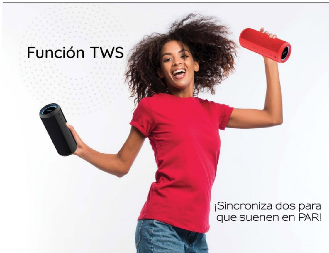
Image: A visual representation of the TWS (True Wireless Stereo) function, showing two Aiwa AW-KF4 speakers

The TWS function allows you to pair two Aiwa AW-KF4 speakers together for a stereo sound experience.