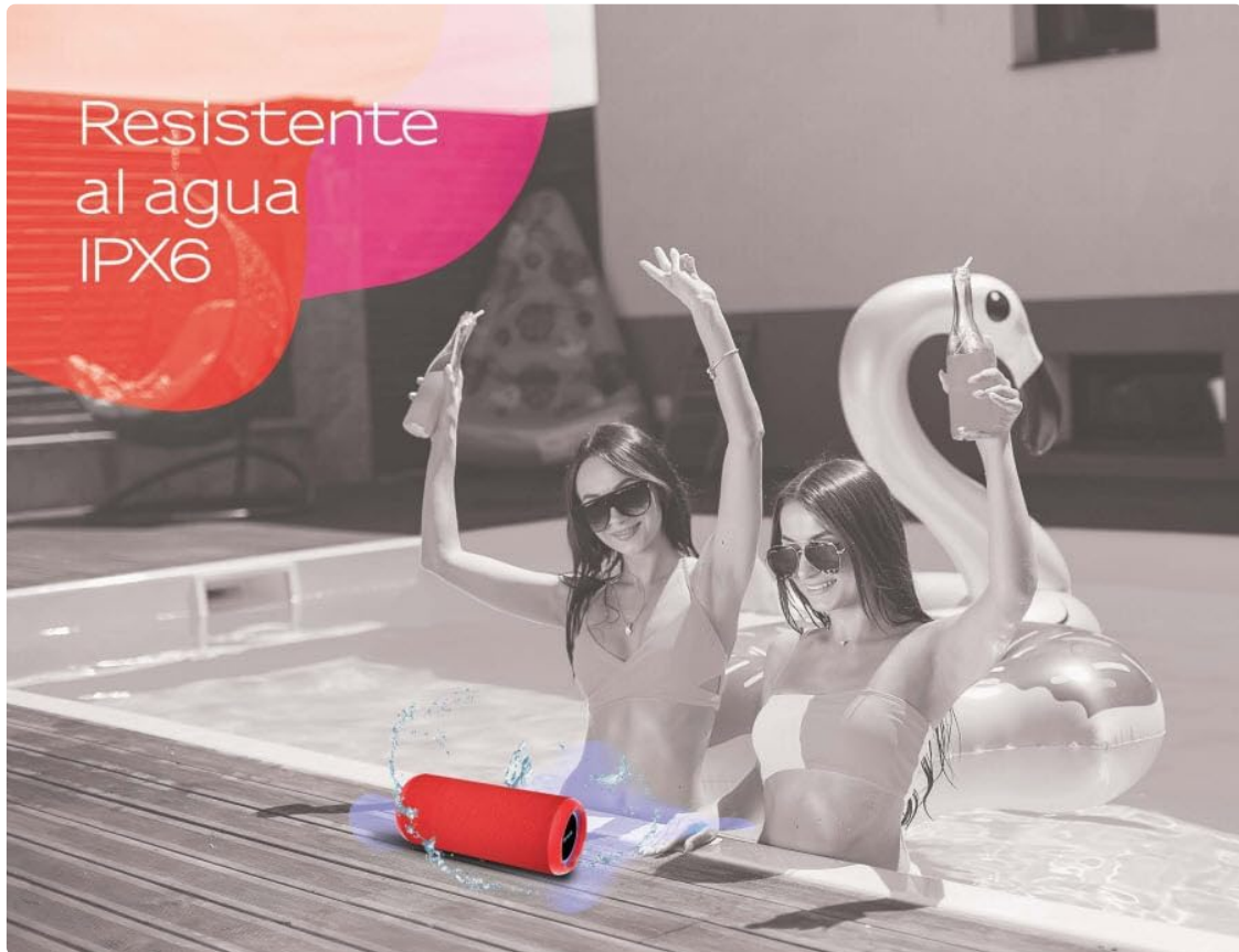
Image: The Aiwa AW-KF4 speaker positioned near a pool, illustrating its IPX6 water resistance feature, suitable for outdoor and poolside use.