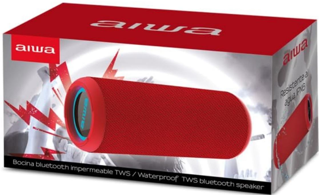
Image: The Aiwa AW-KF4 speaker in its retail packaging, showing the speaker and branding.