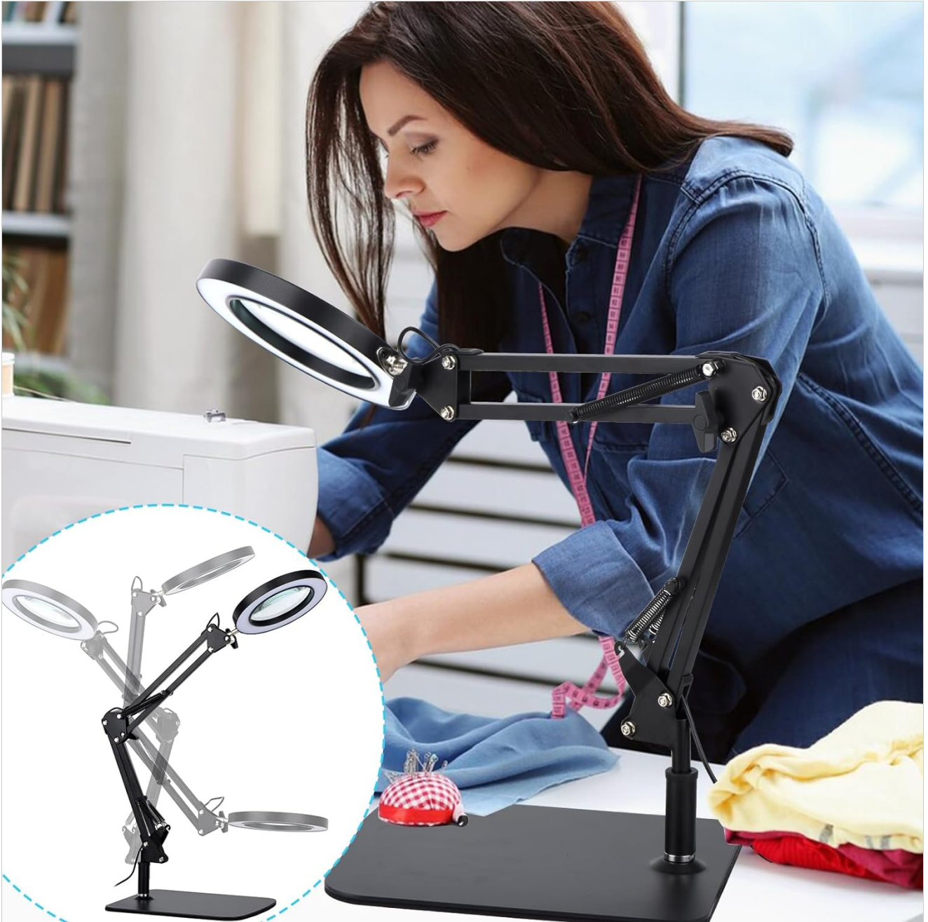
Image: A user engaged in sewing, utilizing the Dylviw LED Magnifier Desk Lamp mounted on its weighted stand for enhanced visibility.