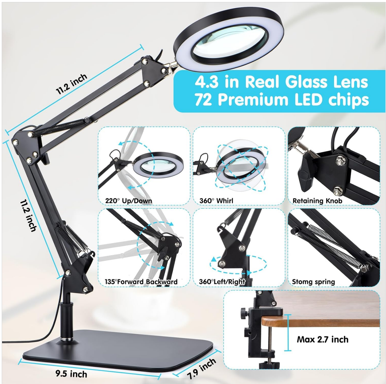
Image: A detailed diagram highlighting the adjustable components and key dimensions of the Dylviw LED Magnifier Desk Lamp, including arm articulation and lens size.