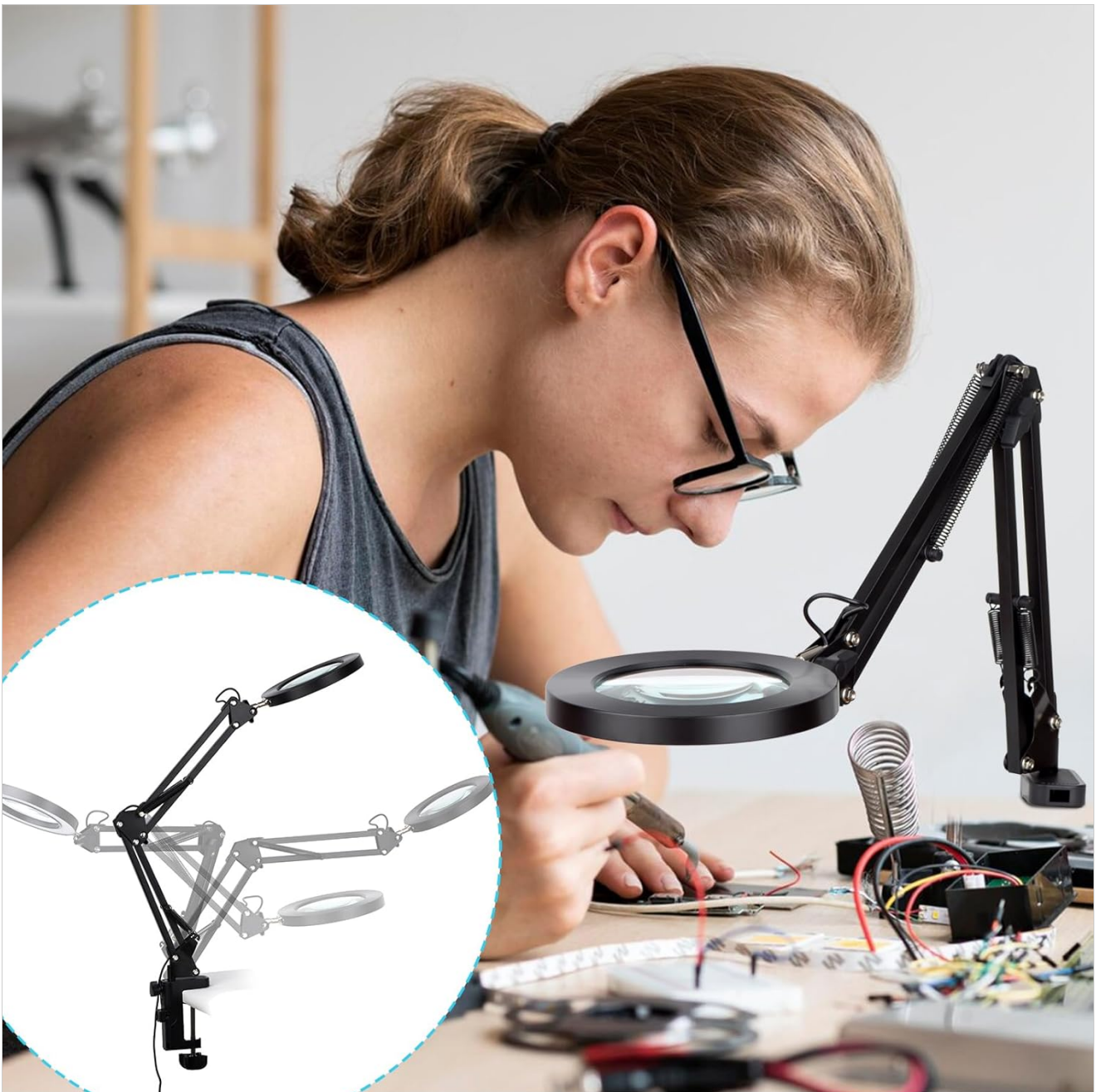
Image: A user performing detailed electronics work with the Dylviw LED Magnifier Desk Lamp securely attached via its clamp mount