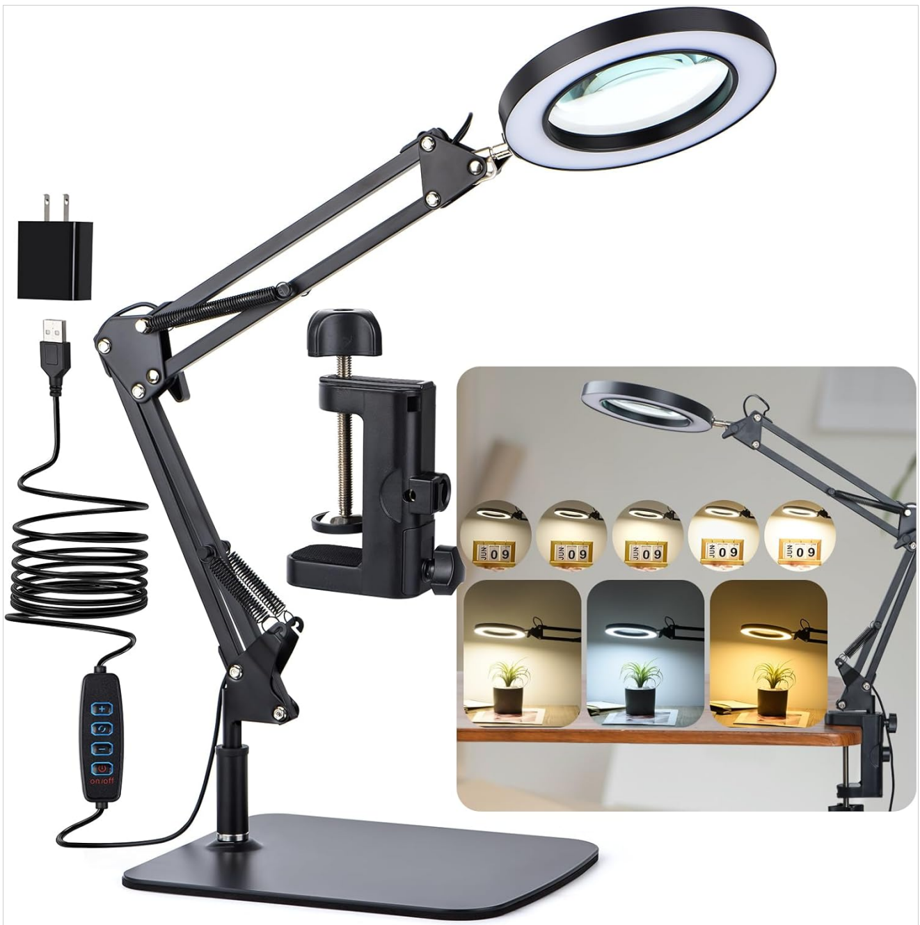
Image: The Dylviw LED Magnifier Desk Lamp, illustrating its versatile design with both clamp and stand configurations.