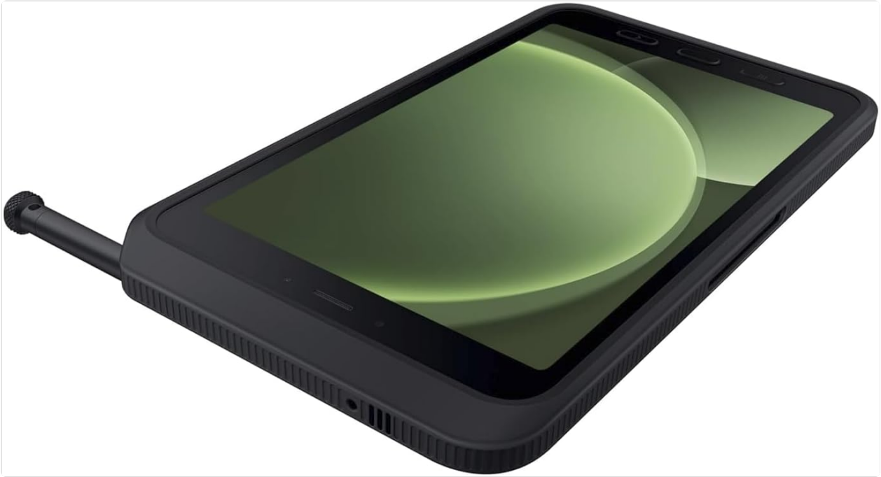
Figure 4: The Samsung Galaxy Tab Active5 shown with its S Pen.

The Galaxy Tab Active5 includes a sensitive touchscreen, compatible with an S Pen (sold separately or included with some models). The S Pen allows for precise input, drawing, and note-taking, even in wet conditions or while wearing gloves.