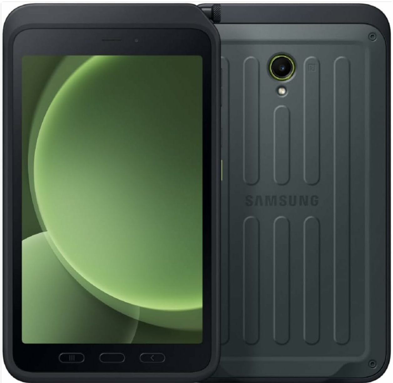
Figure 1: Front view of the Samsung Galaxy Tab Active5 tablet.