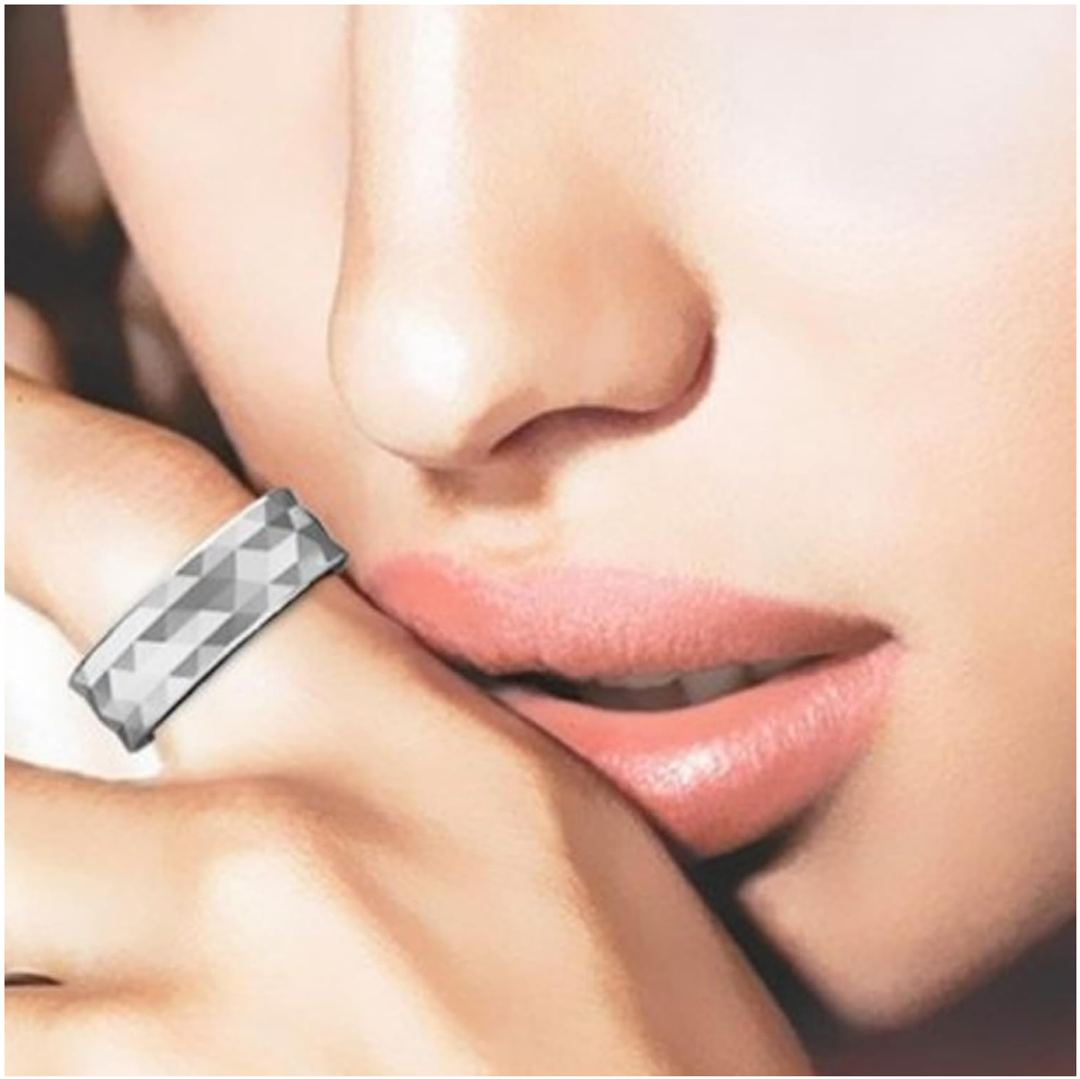
Image: A close-up of a person's hand wearing the silver Smart Ring Fitness Tracker on their index finger, demonstrating how the ring is worn.