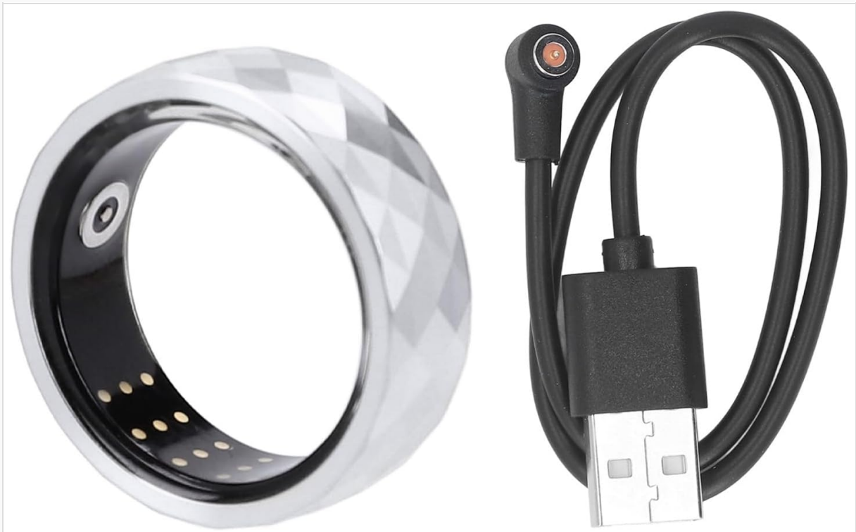
Image: The Smart Ring Fitness Tracker shown alongside its dedicated charging cable. The ring is silver with a faceted exterior and a black interior, while the cable is black with a magnetic charging connector.