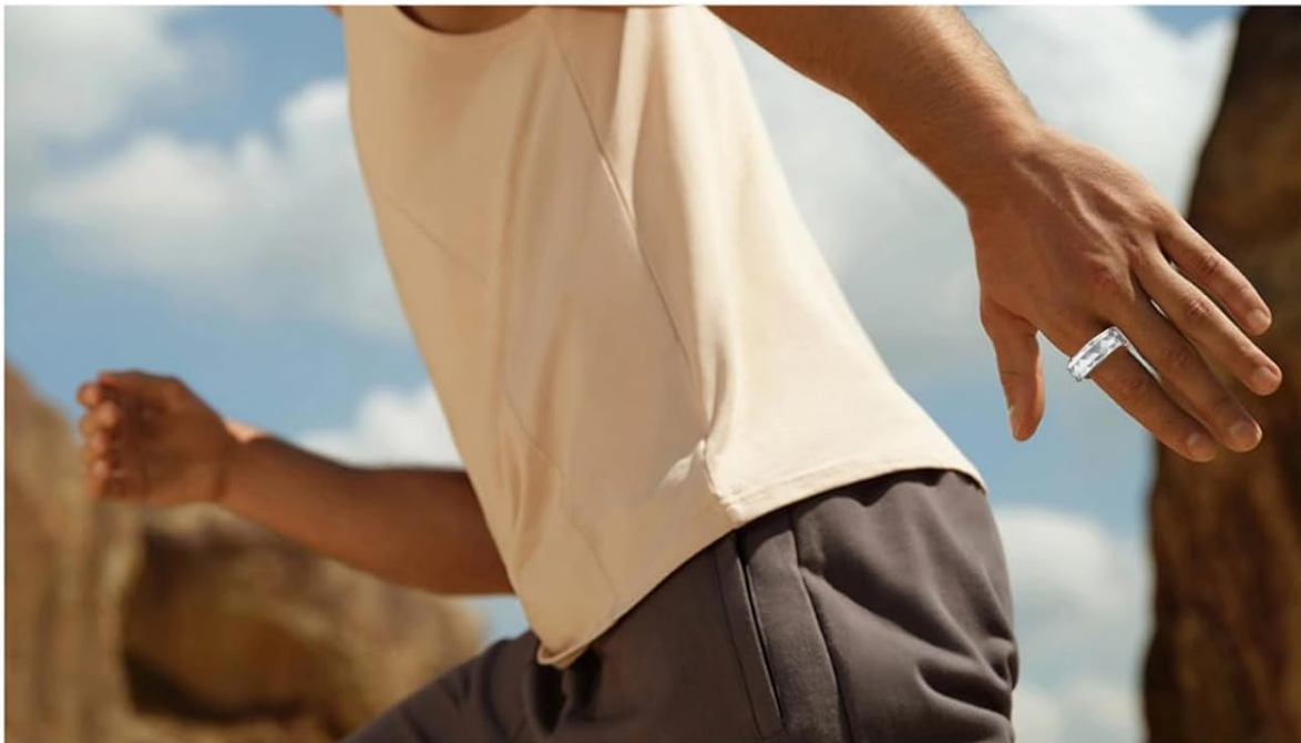
Image: The Smart Ring Fitness Tracker positioned next to two images of individuals engaged in sports: one skiing and another running. This visual emphasizes the ring's utility across multiple sport modes.