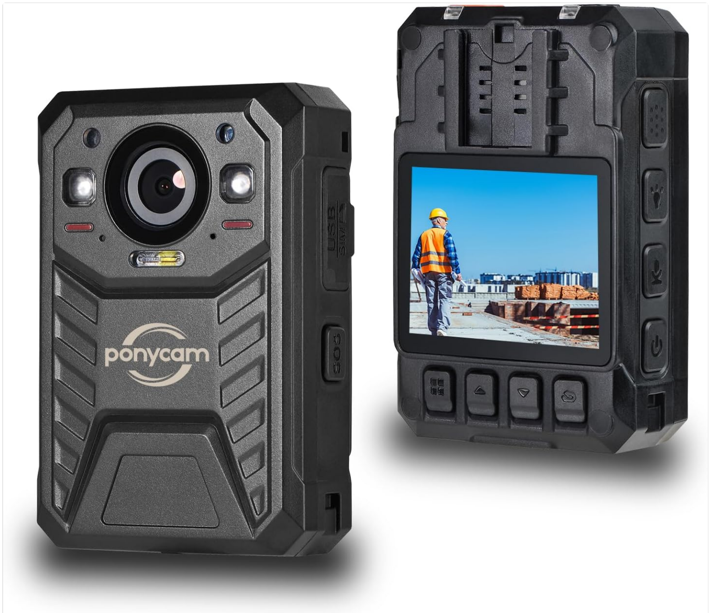
Image 1: Front and back view of the Ponycam BC605 Body Worn Camera, showing the lens, screen, and controls.