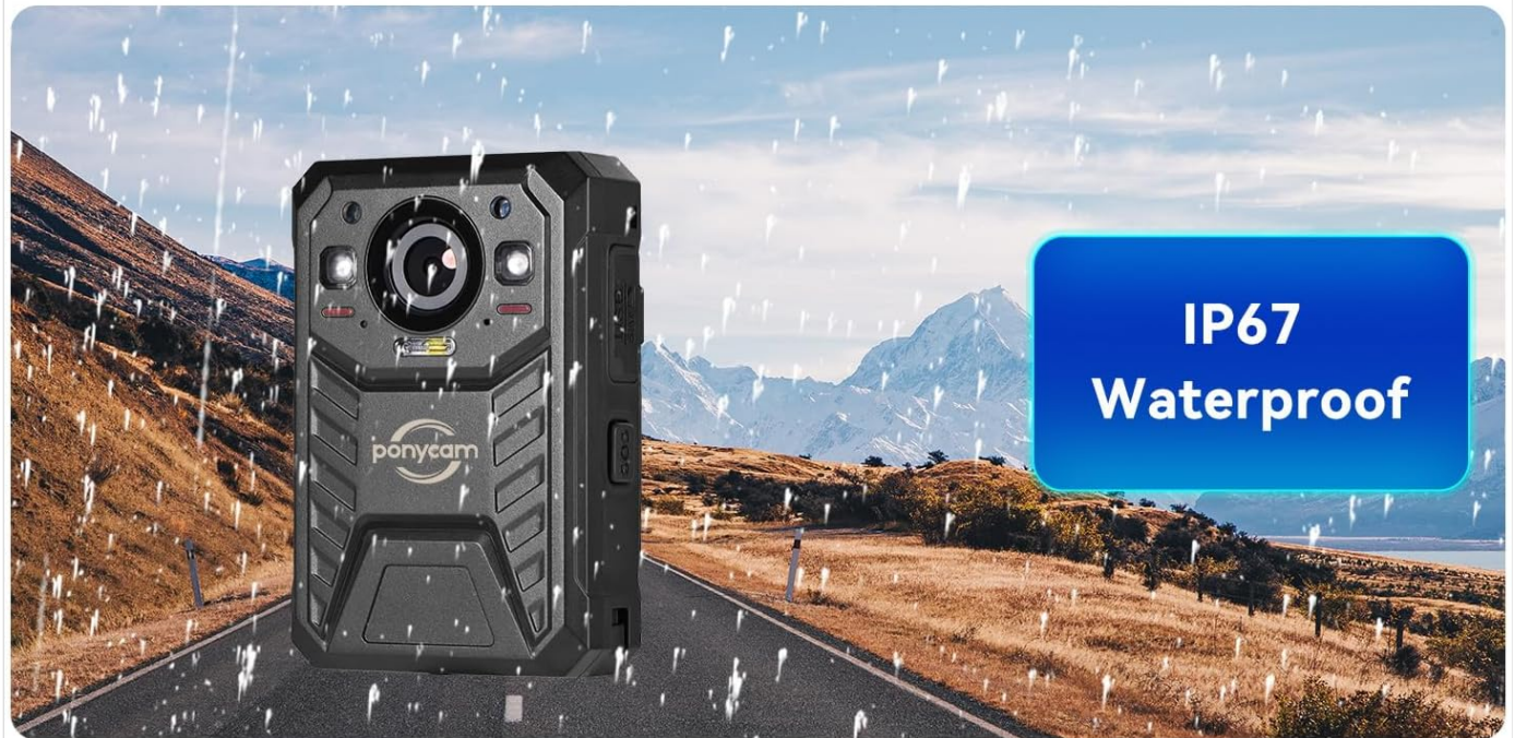
Image 7: Visual representation of the camera's durability, highlighting its 2-meter drop resistance and IP67 waterproof rating.