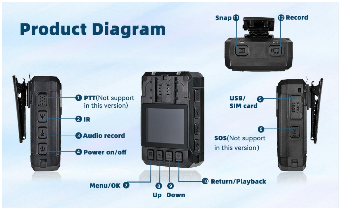
Image 3: Detailed product diagram showing the camera's buttons and ports, including PTT (not supported in this version), IR, Audio record,

Familiarize yourself with the various parts and controls of your BC605 Body Worn Camera: