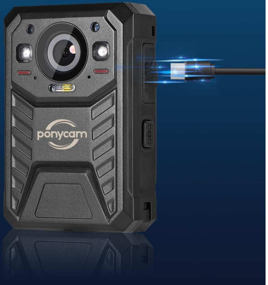
Image 5: Illustration highlighting the camera's 17-hour continuous recording time and 3600mAh high-capacity battery.