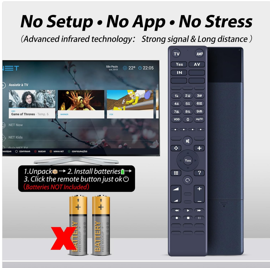
Figure 3.1: Battery installation for the remote control. Insert two AAA batteries according to polarity markings.

Once batteries are installed, the remote is ready for immediate use.