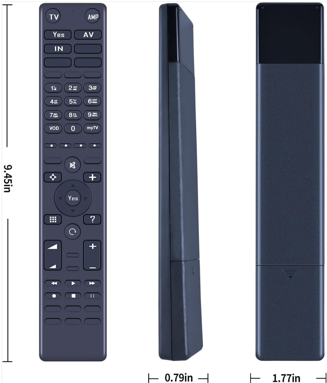
Figure 7.1: Physical dimensions of the WDZP Replacement Remote Control.