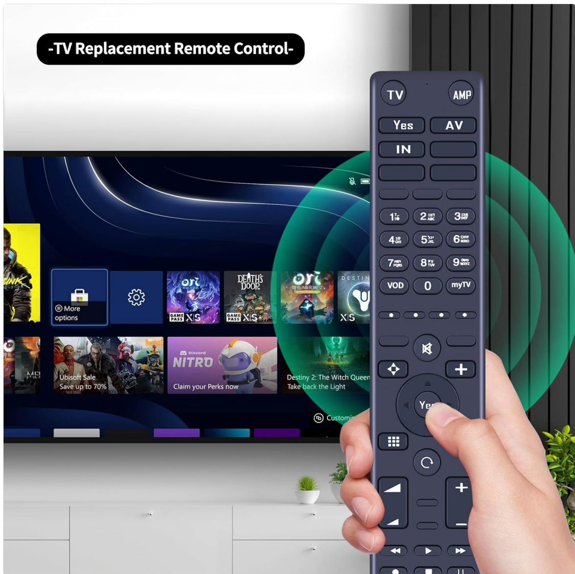
Figure 4.2: Overview of the remote control buttons and typical usage scenario.