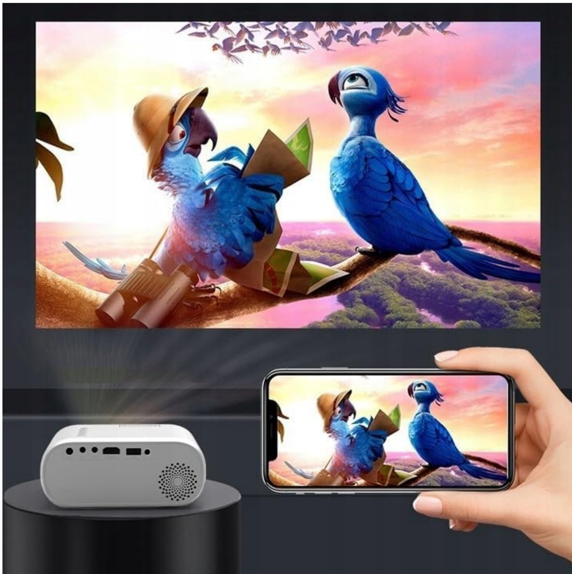
Image 4.2: Examples of devices that can be connected to the projector.