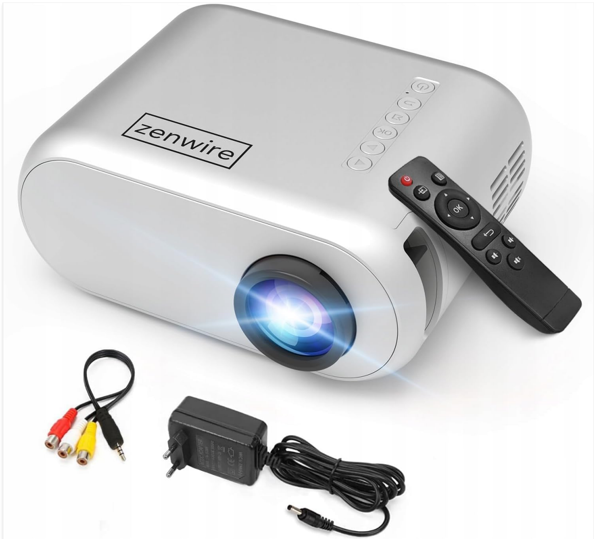
Image 3.1: Front and top view of the projector, showing the lens and top control panel.