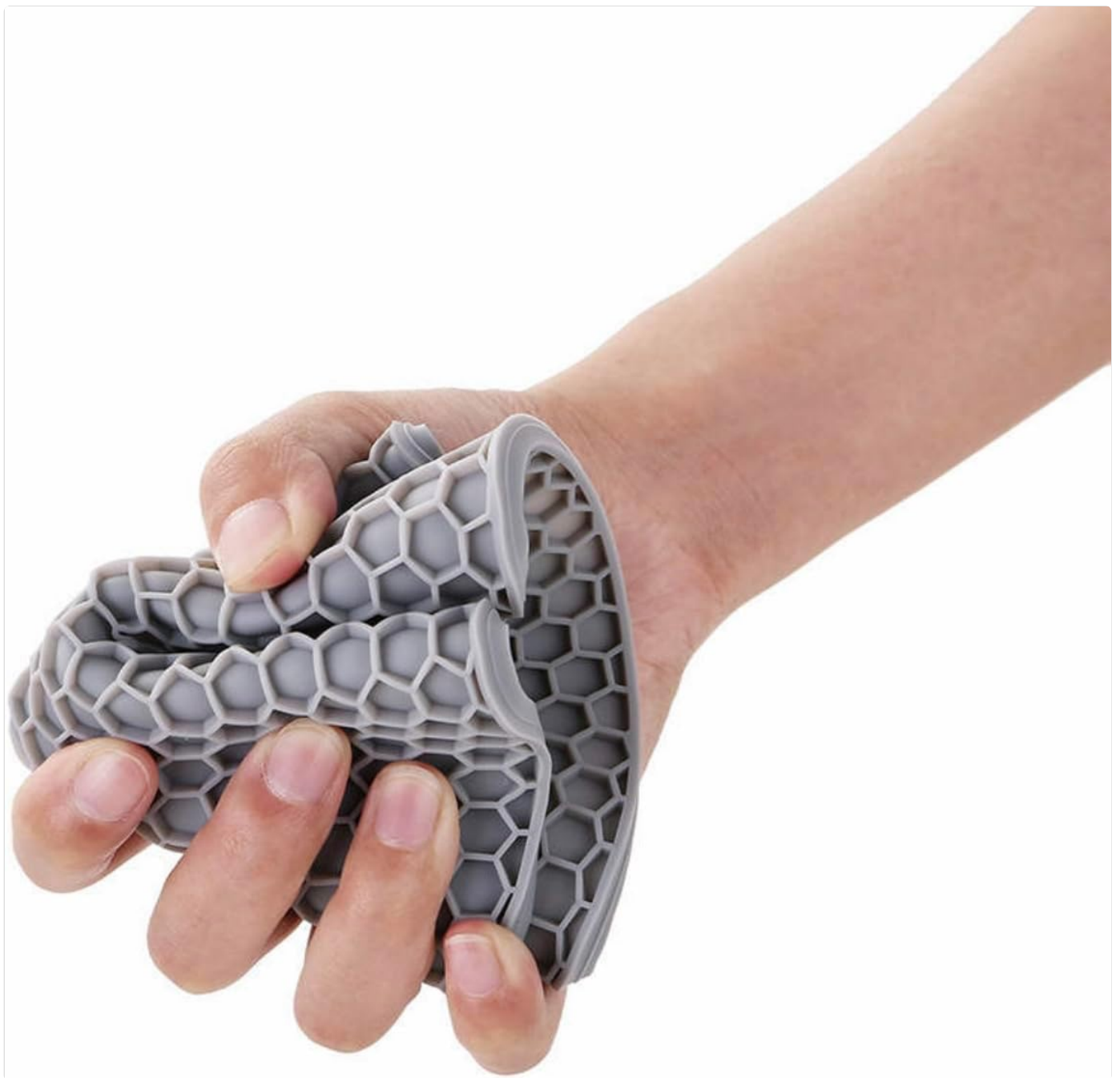
Image: A hand demonstrating the flexibility of the honeycomb silicone placemat by squeezing it into a crumpled shape.