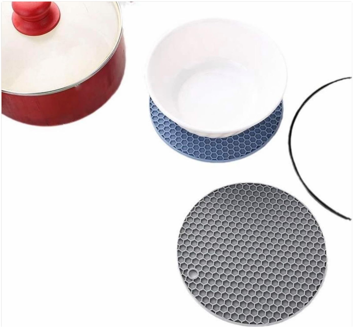
Image: Two honeycomb silicone placemats on a white surface. One is grey, and the other is blue, with a white bowl placed on top of the blue one. A red pot is also visible in the background.