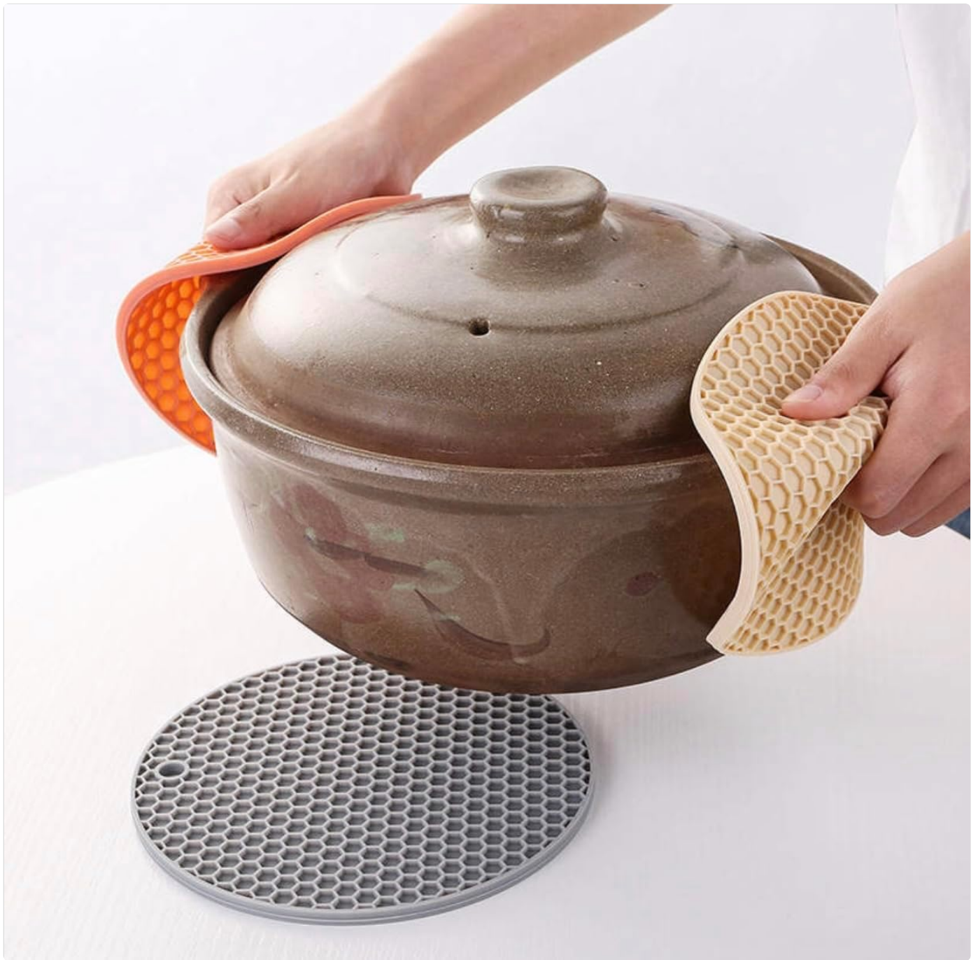
Image: A person using two honeycomb silicone placemats, one orange and one beige, to safely lift a large hot pot from a surface. Another grey placemat is visible on the table.