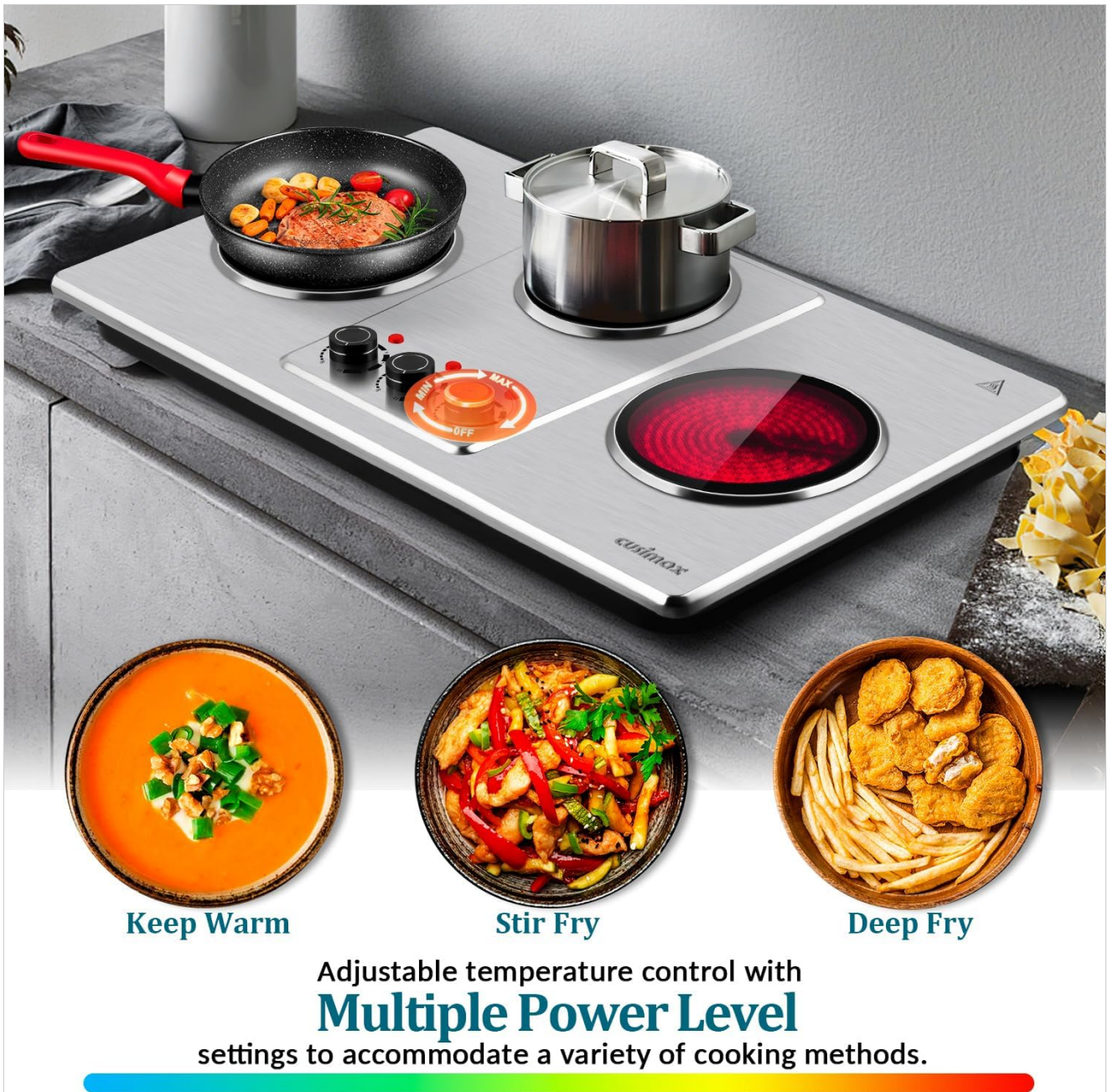
Figure 1: The Cusimax Triple Infrared Burner demonstrating its versatility for different cooking methods such as keeping food warm, stir-frying, and deep-frying.