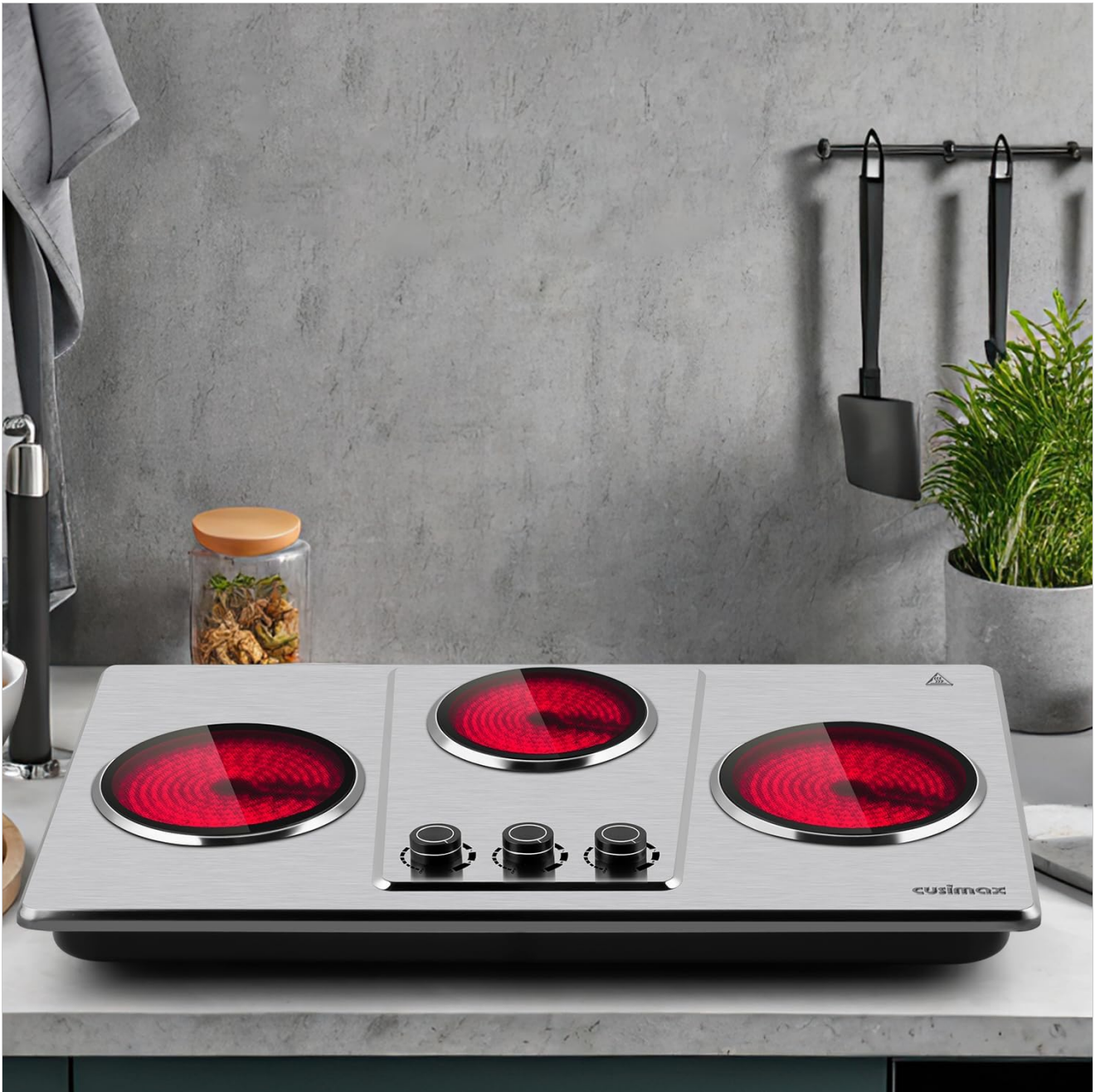
Figure 3: The Cusimax Triple Infrared Burner positioned on a countertop, illustrating its readiness for various cooking applications.