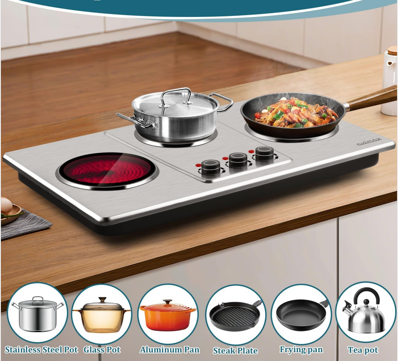
Figure 4: An illustration of the wide range of cookware compatible with the Cusimax Triple Infrared Burner, including different materials and types of pots and pans.