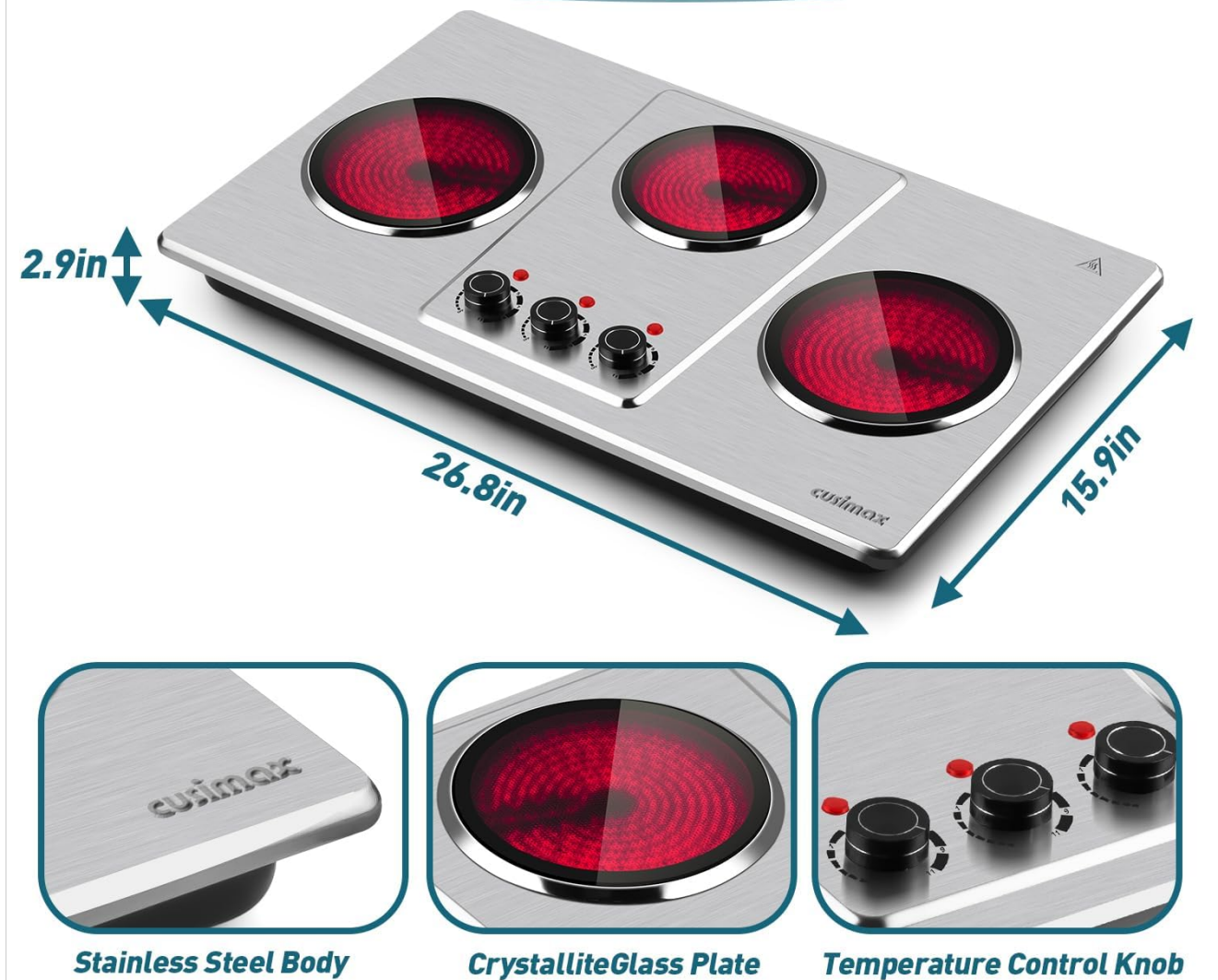
Figure 5: Detailed view of the Cusimax Triple Infrared Burner, highlighting its dimensions and components such as the stainless steel body, crystallite glass plate, and user-friendly temperature control knobs.